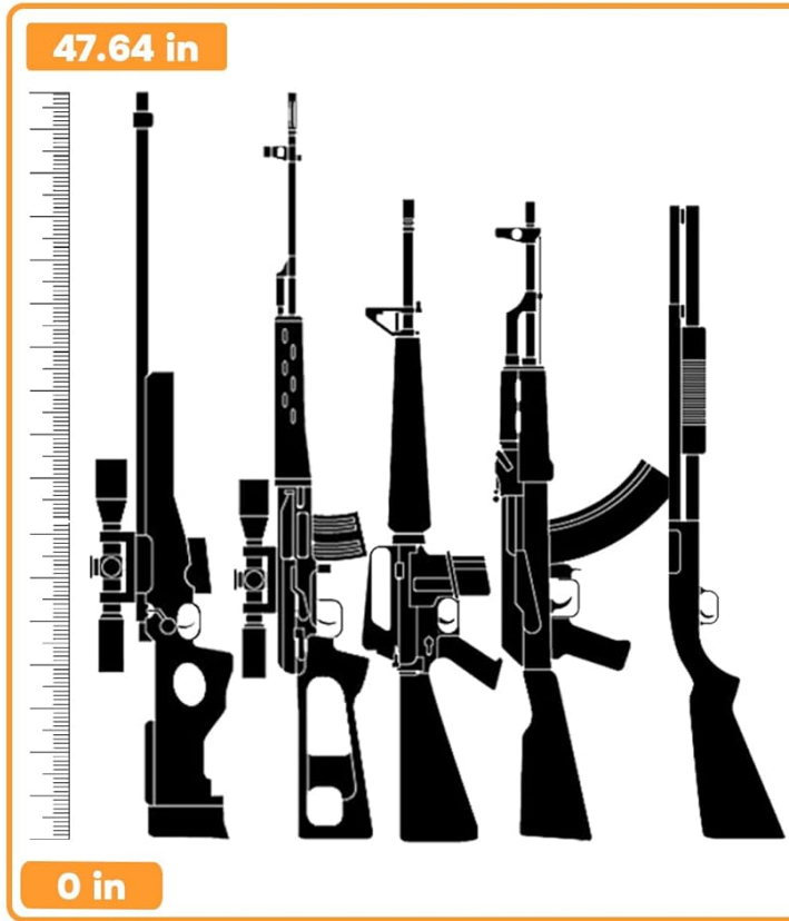
Image: Interior dimensions and capacity for various firearms with adjustable shelving.

THIS GUN SAFE HOLDS LONG GUNS AND 4 HANDGUNS. WITH DETACHABLE PARTITIONS, IT ADAPTS TO FIREARM LENGTHS