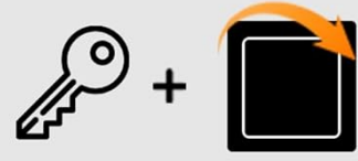
Key + Handle