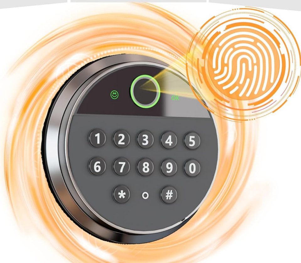
Image: The safe offers three methods for unlocking: electronic password, fingerprint, and emergency key.