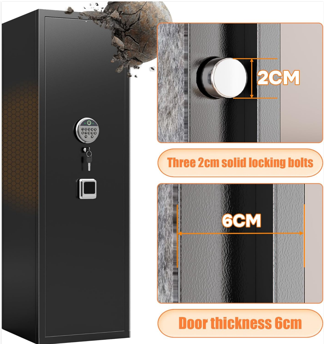
Image: The safe features solid locking bolts and a thick door for enhanced security.