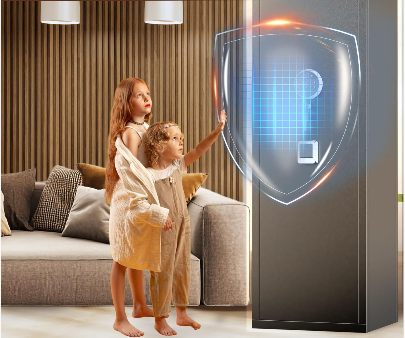
Image: The safe is designed to protect children from accessing dangerous items. Always ensure the safe is locked.