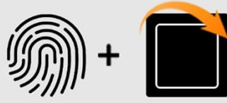
Fingerprint + Handle