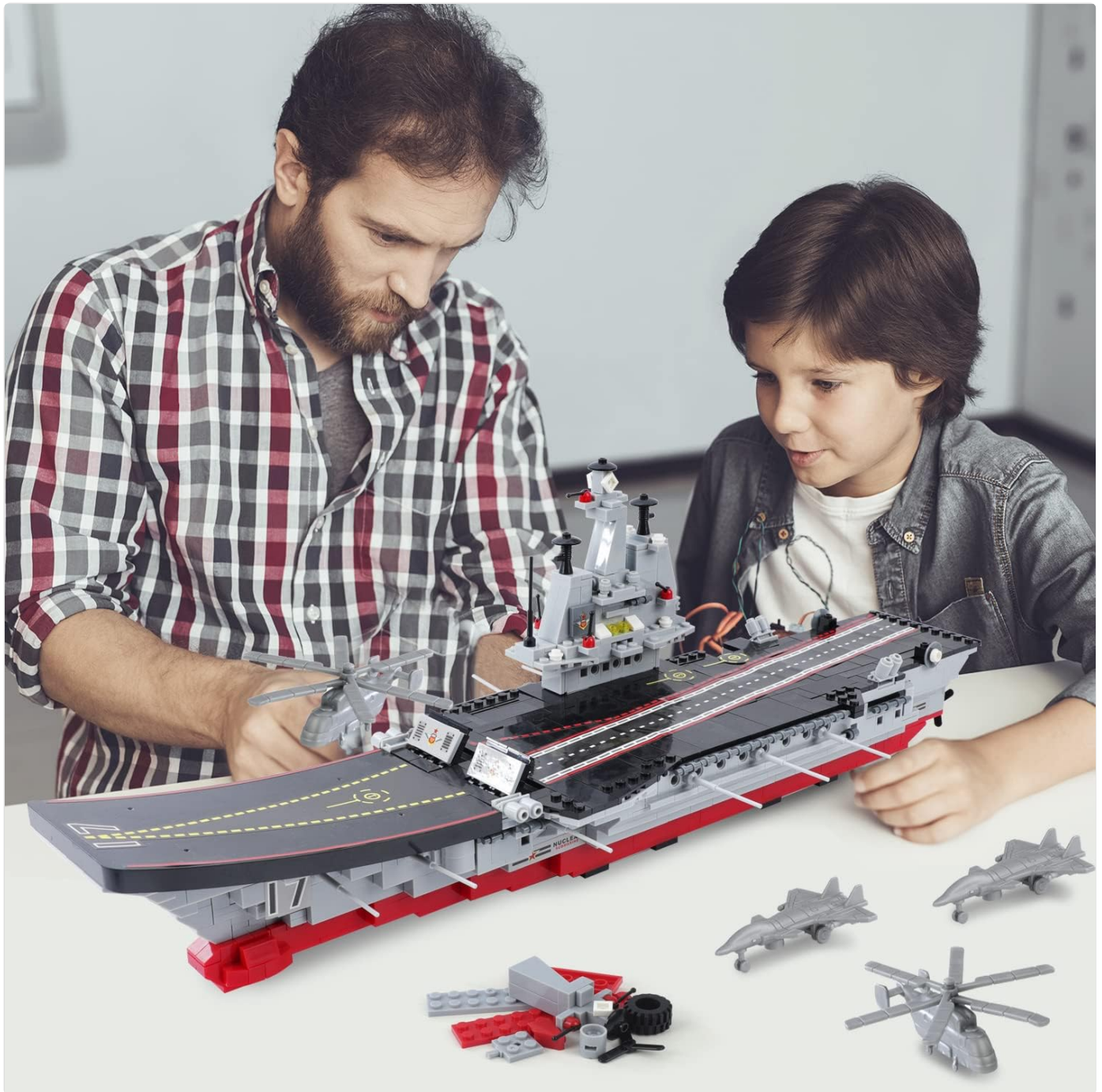
Figure 2: An example of the assembly process, showing two individuals working together to build the aircraft carrier model. This highlights the collaborative nature of construction.

5. Attach Accessories: Once the main carrier structure is complete, attach the mini aircraft, helicopters, and other detailed elements as per the instructions.