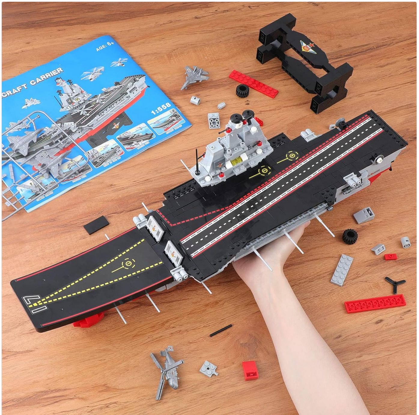
Figure 1: Overview of the building blocks set with the instruction booklet and various pieces. The partially assembled aircraft carrier is shown being held by a hand, illustrating its size and detail.