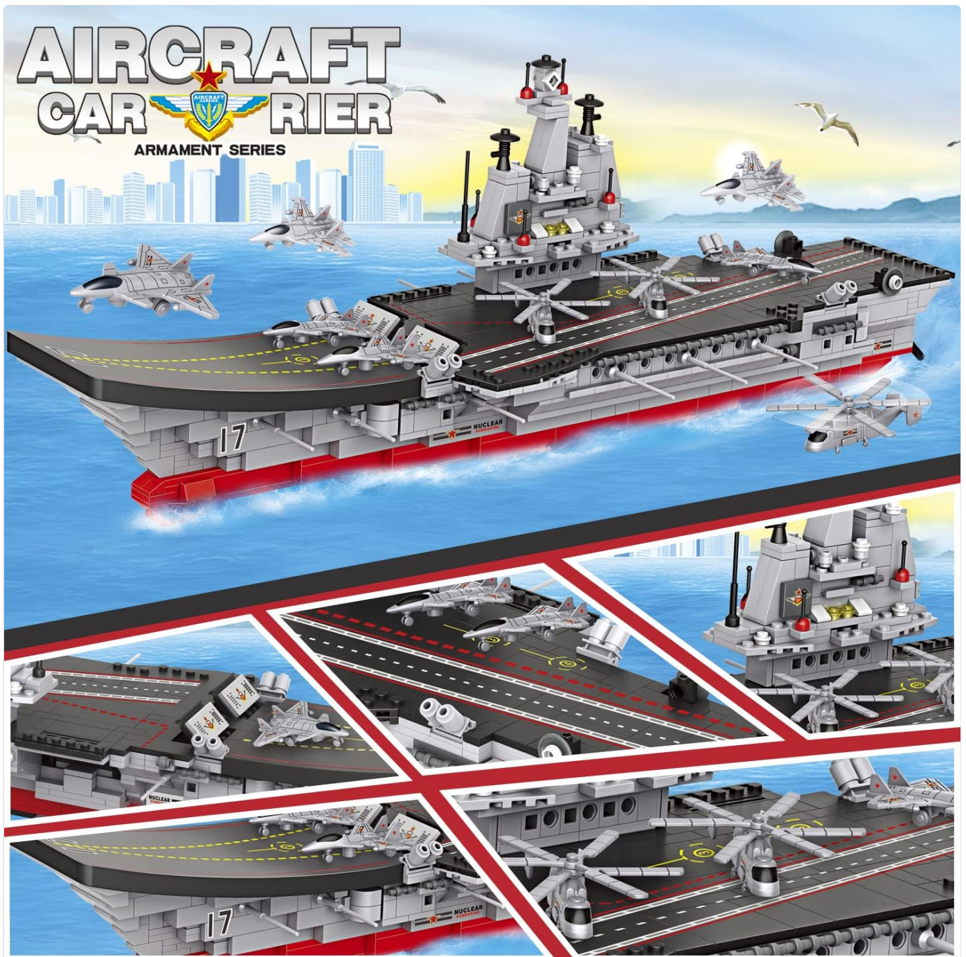
Figure 4: The fully assembled military aircraft carrier model, showcasing its scale and the arrangement of mini aircraft and helicopters on its deck, ready for play or display.