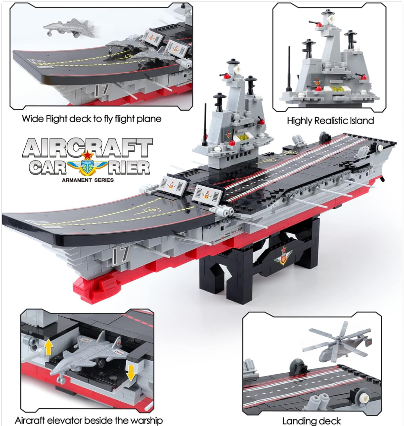
Figure 3: Detailed views of the completed aircraft carrier, showcasing key features such as the wide flight deck for aircraft, the highly realistic island command center, the functional aircraft elevator beside the warship, and the designated landing deck area.