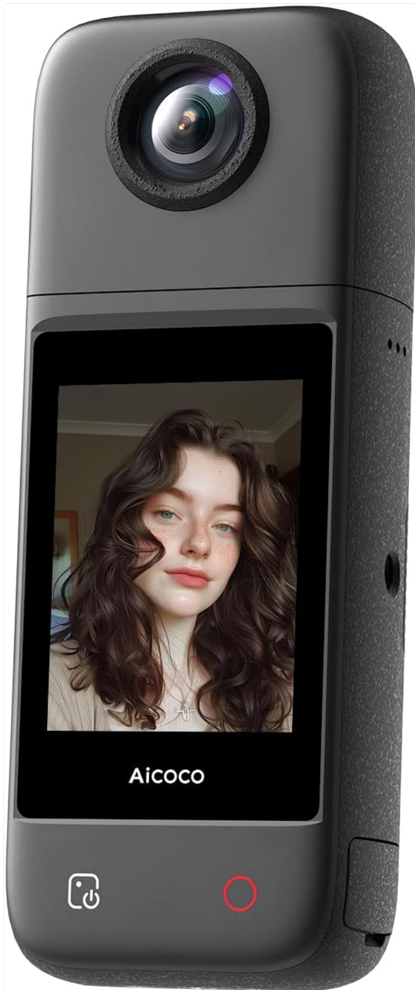
Figure 2.2.1: Front view of the Aicoco StreamCam OnAir camera, showing the main lens, display screen, and control buttons.