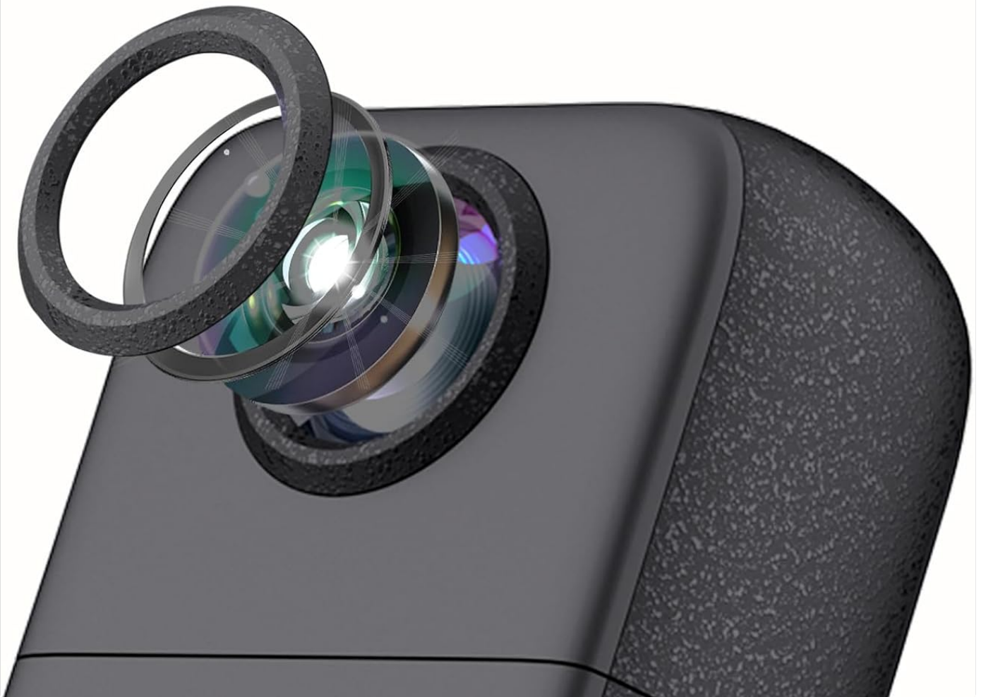
Figure 4.2.1: Illustrates the camera's 4K/1080P recording capabilities, SONY 1/1.8" STARVIS 2 CMOS sensor, 8Bit Color, and HDR video support.