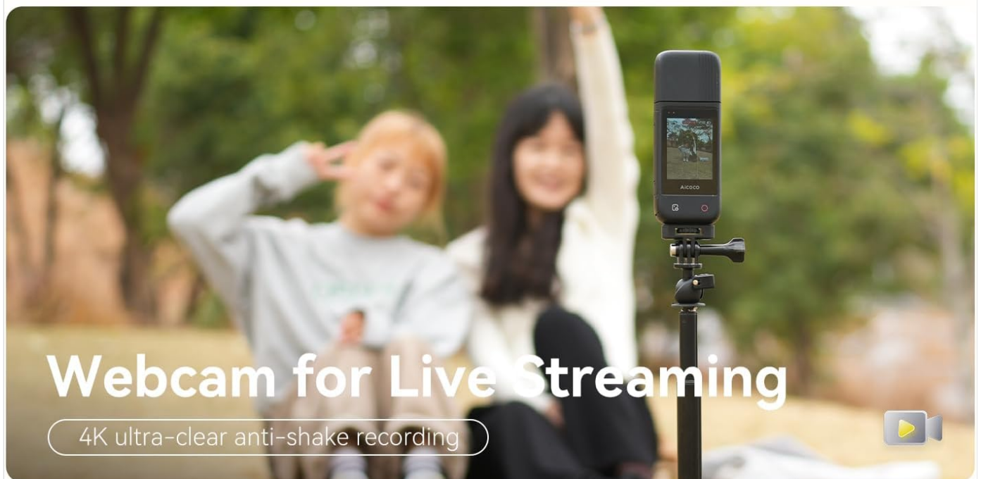
Figure 4.5.1: Depicts the camera's versatility as a USB camera (no capture card needed) and a 4K ultra-clear anti-shake webcam for live streaming.