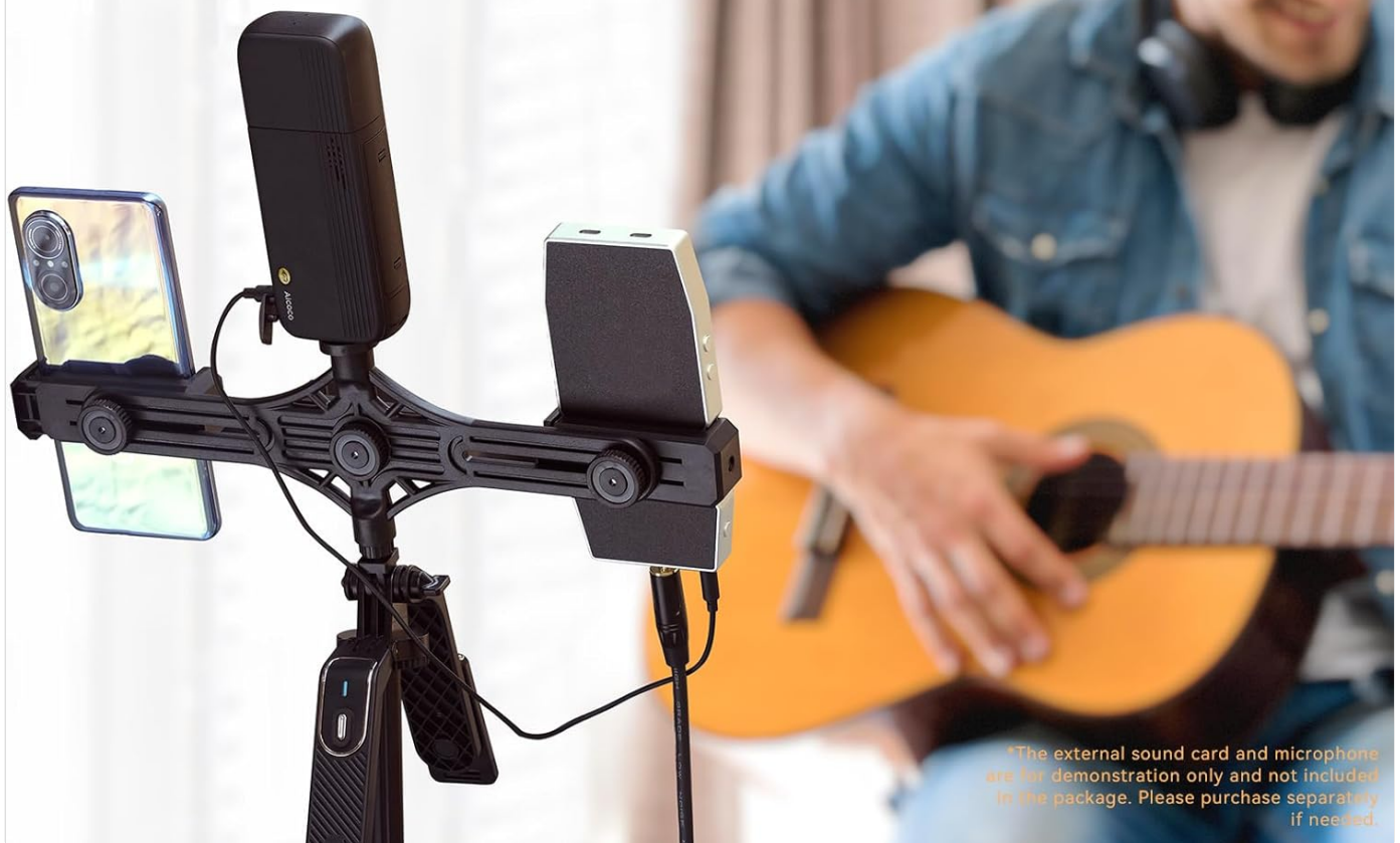
Figure 4.4.1: Shows the camera connected to an external sound card and microphone via the 3.5mm jack for high-definition audio input.

Built-in dual microphone matrix for precise sound reception supports 3.5mm external audio input