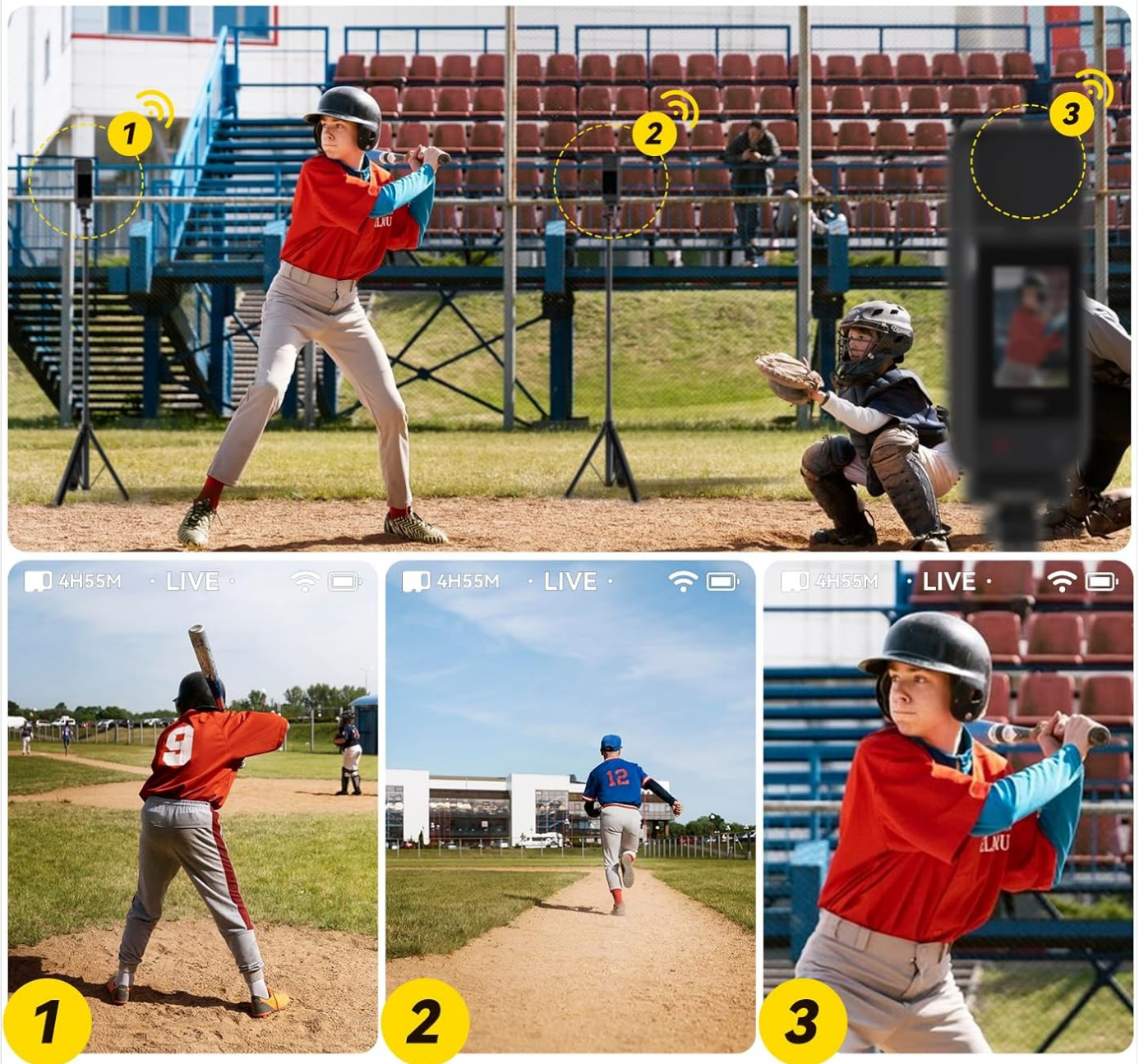
Figure 4.5.2: Illustrates the ease of wireless multicam connection, allowing multiple cameras to be used for a single live stream.