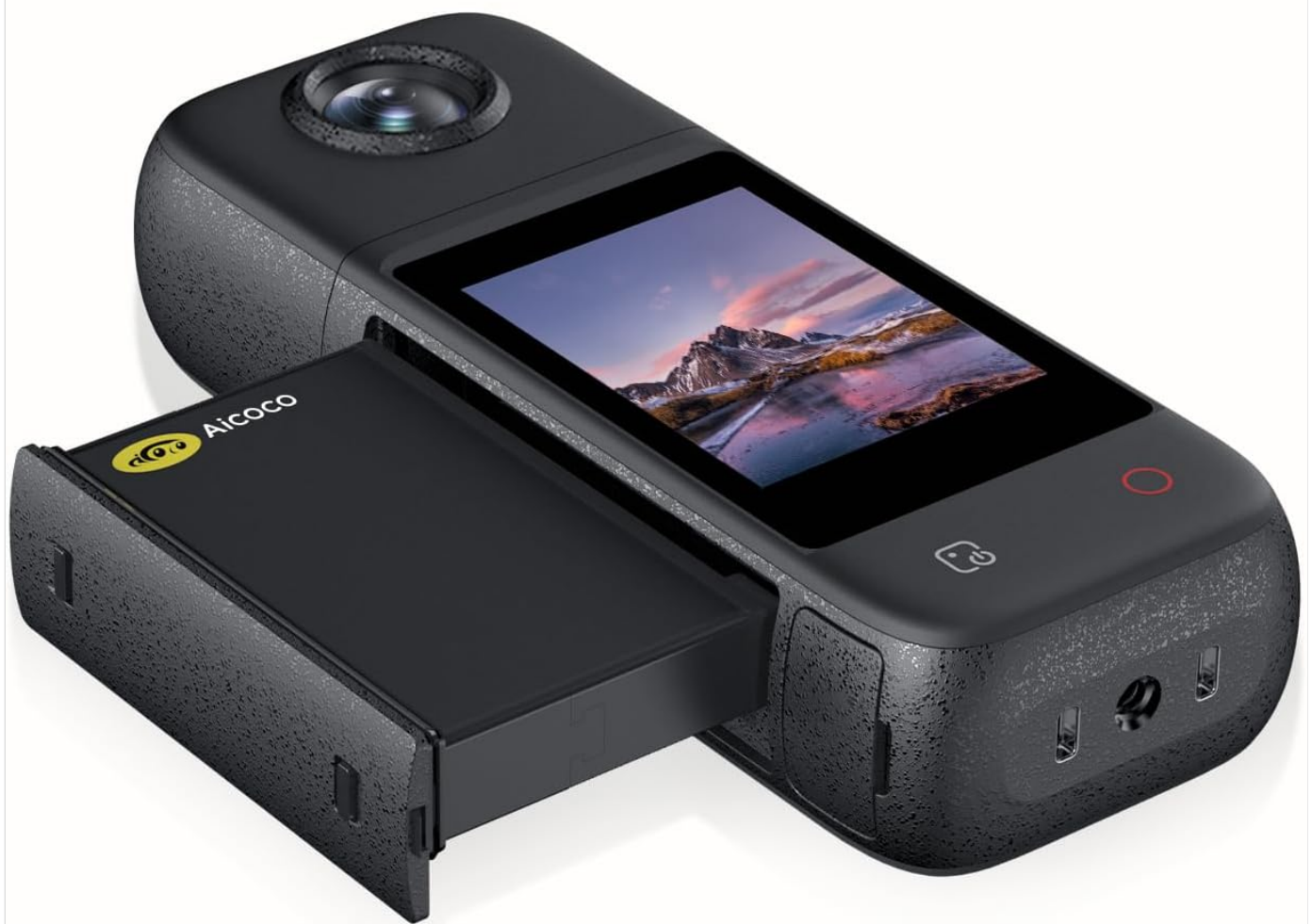
Figure 3.1.1: The camera's battery compartment, illustrating the hot-swappable battery feature for continuous operation.

Live Broadcast Will Continue Without Interruption During Battery Changes Staying Popular