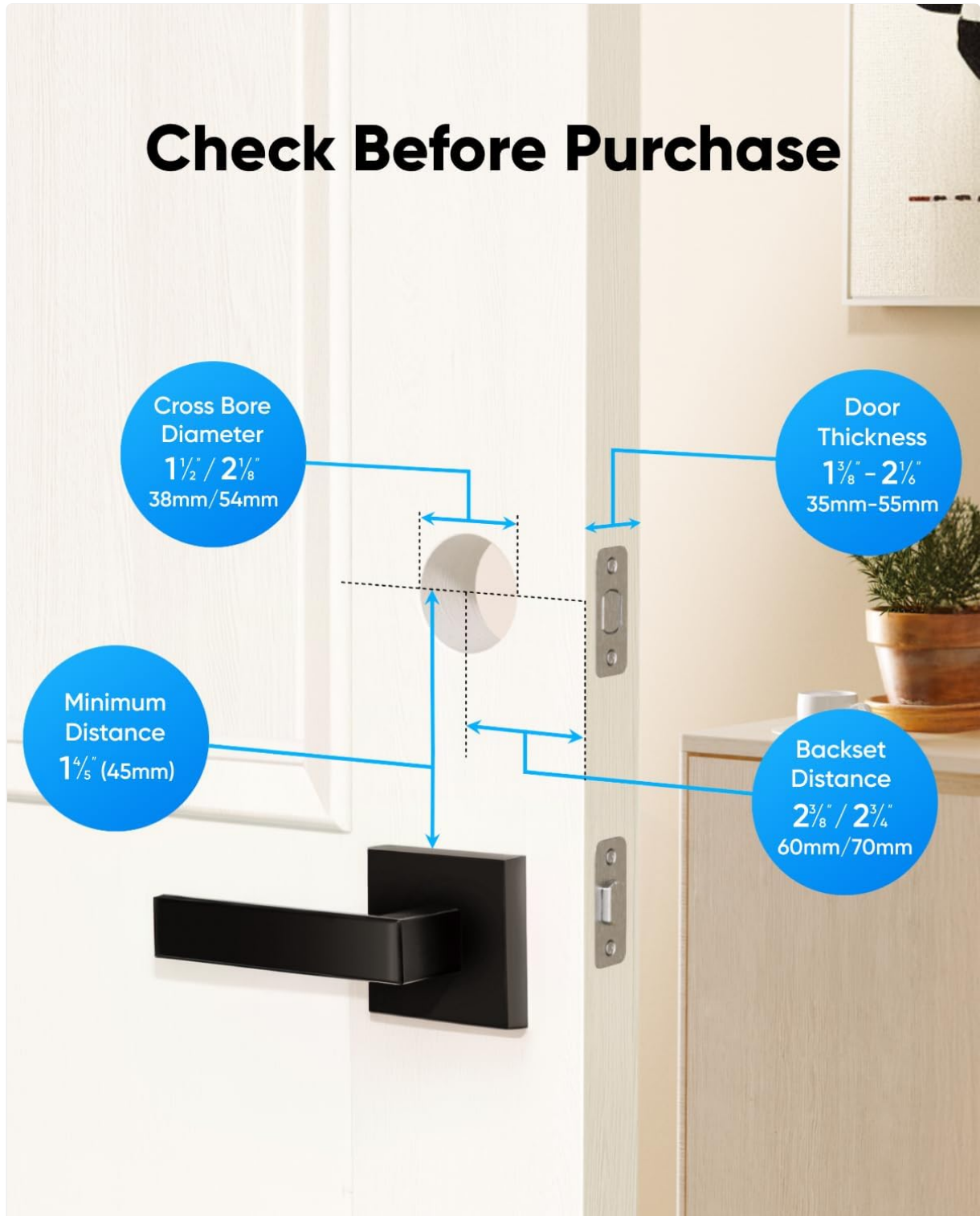
Image: A diagram illustrating the critical measurements required for door compatibility, including cross bore diameter, door thickness, minimum distance, and backset distance.