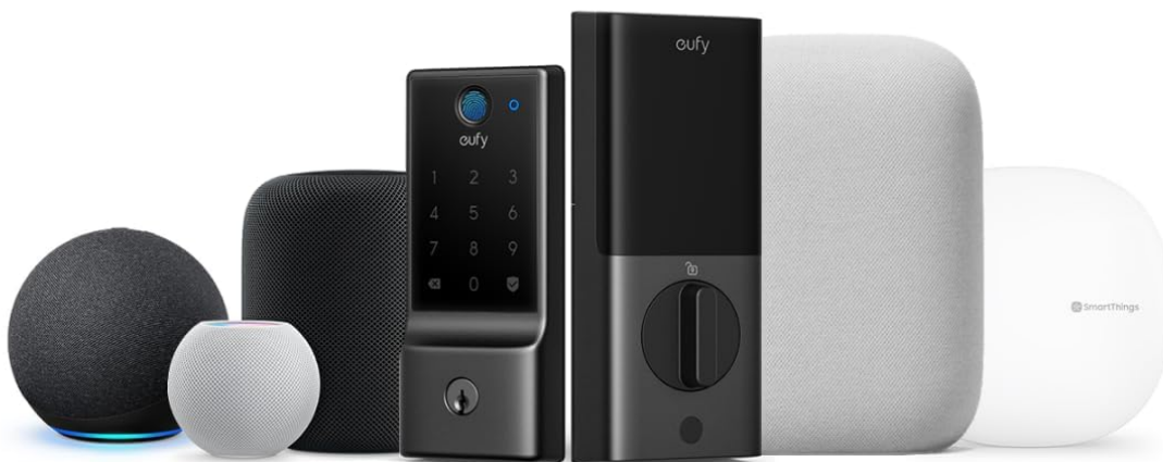
Image: An assortment of smart home devices, including smart speakers and hubs, demonstrating the eufy Smart Lock E30's broad compatibility with major smart home ecosystems.