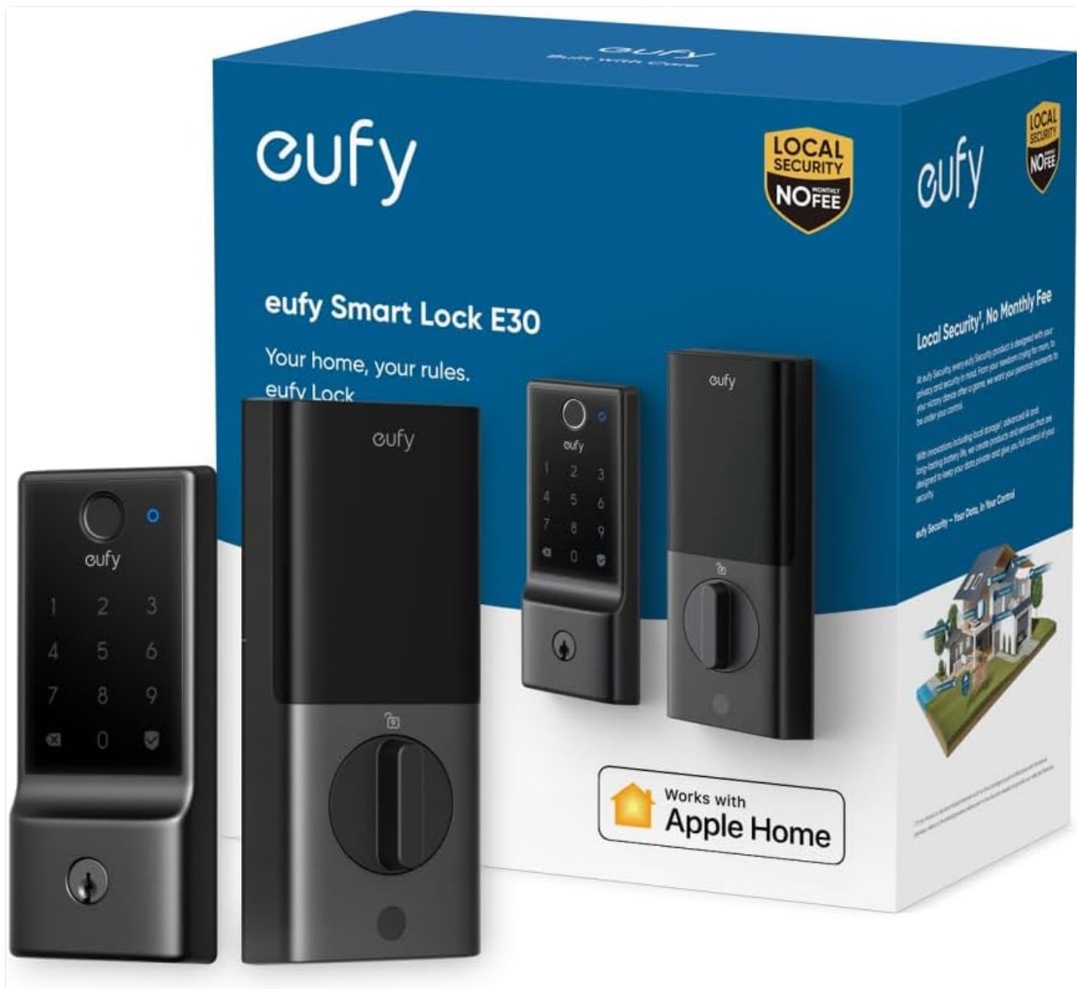
Image: The eufy Security Smart Lock E30 packaging, showcasing the exterior keypad unit and the interior deadbolt mechanism, along with the product box.