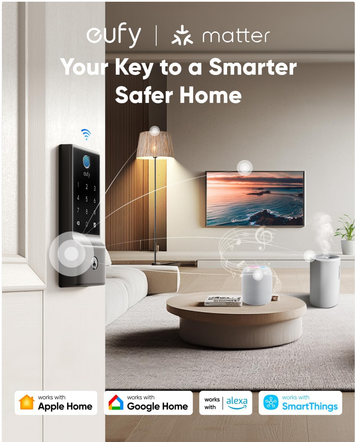
Image: The eufy Smart Lock E30 installed on a door, with icons indicating compatibility and integration with Apple Home, Google Home, Alexa, and SmartThings.