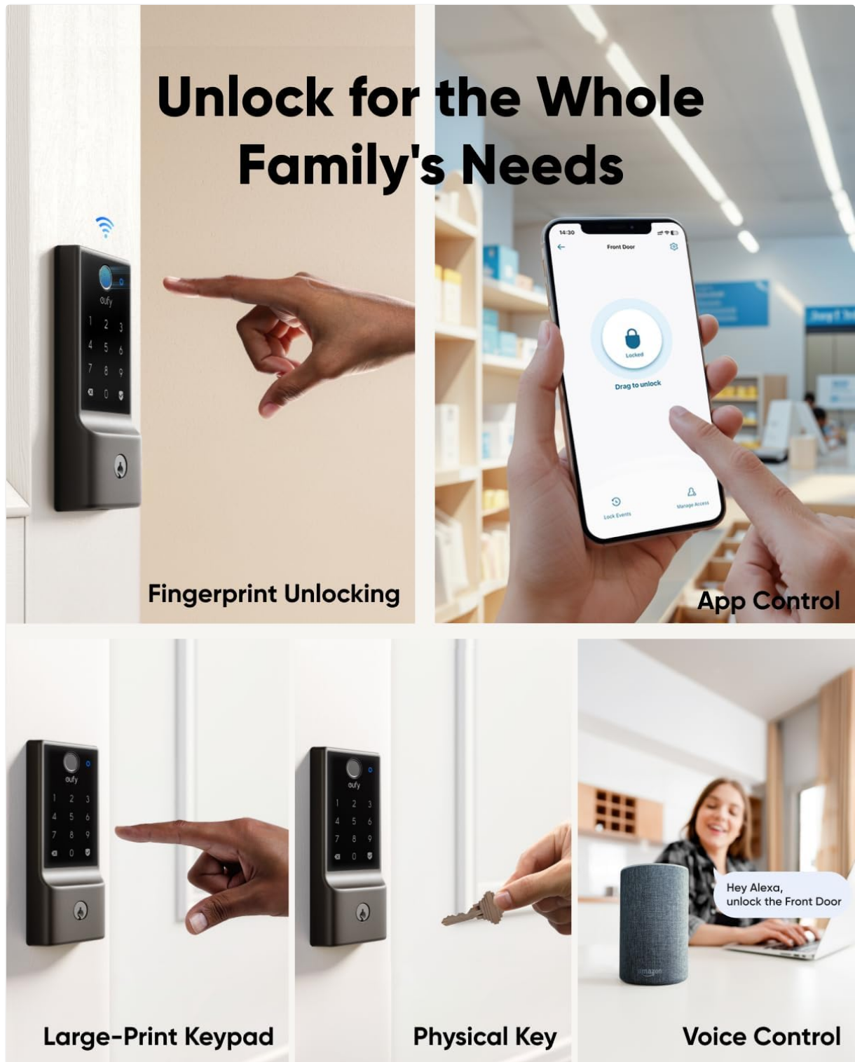
Image: A collage demonstrating the five primary unlocking methods for the eufy Smart Lock E30: fingerprint, app control, large-print keypad, physical key, and voice control via smart assistant.

unlock, or check the status of your door using voice commands.