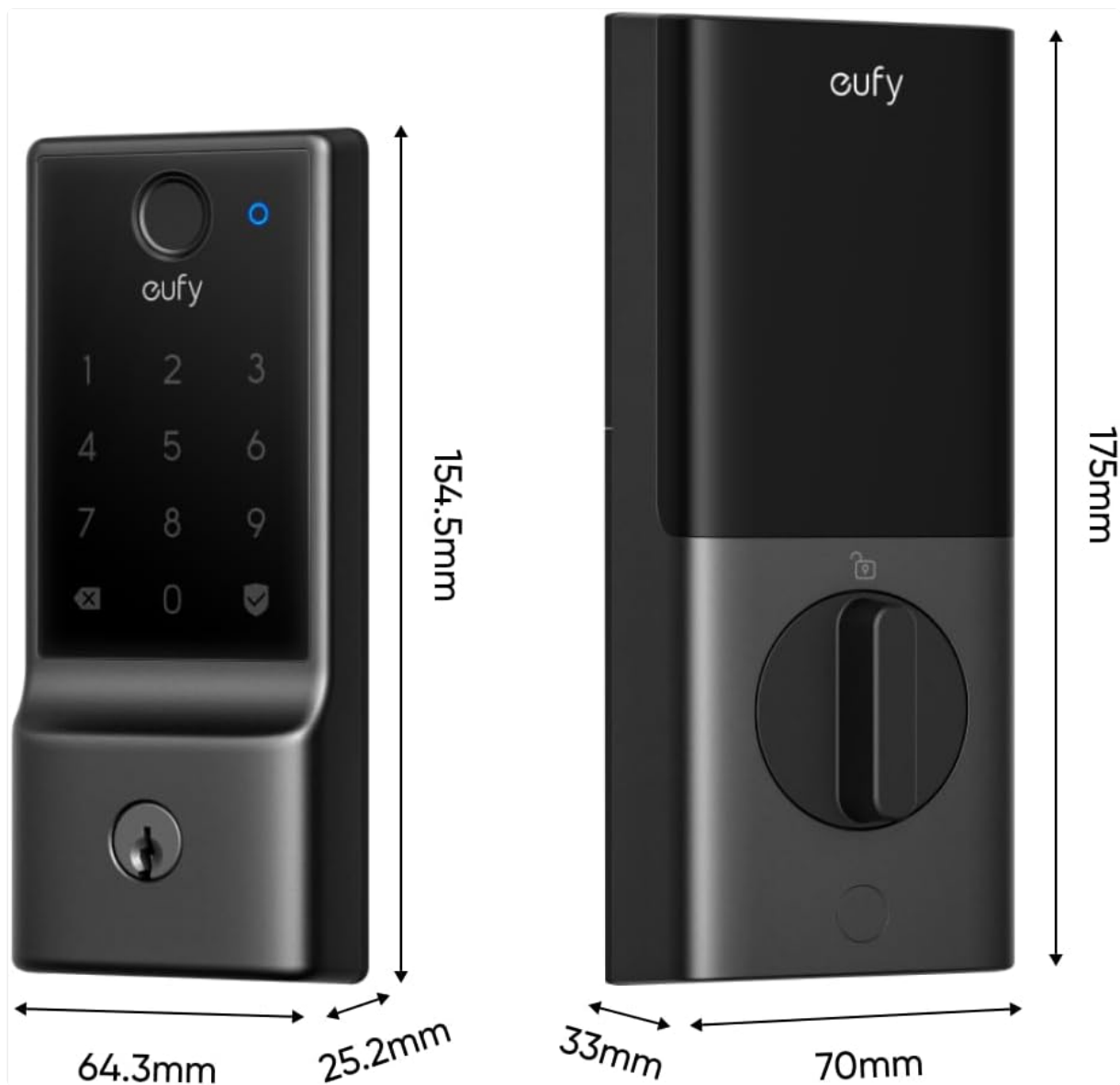
Image: Technical drawing showing the precise dimensions in millimeters for both the exterior keypad and interior thumb turn components of the eufy Smart Lock E30.