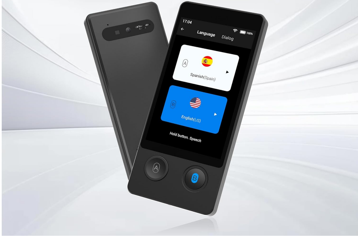
Image: The ANFIER W12S Translator Device, showcasing its 3.7-inch ultra-large HD screen for clear text display.

Easy-to-read text User-friendly for people of all ages