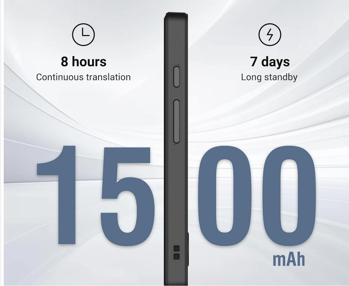
Image: The ANFIER W12S device highlighting its 1500mAh battery, offering up to 8 hours of continuous translation and 7 days of standby time.