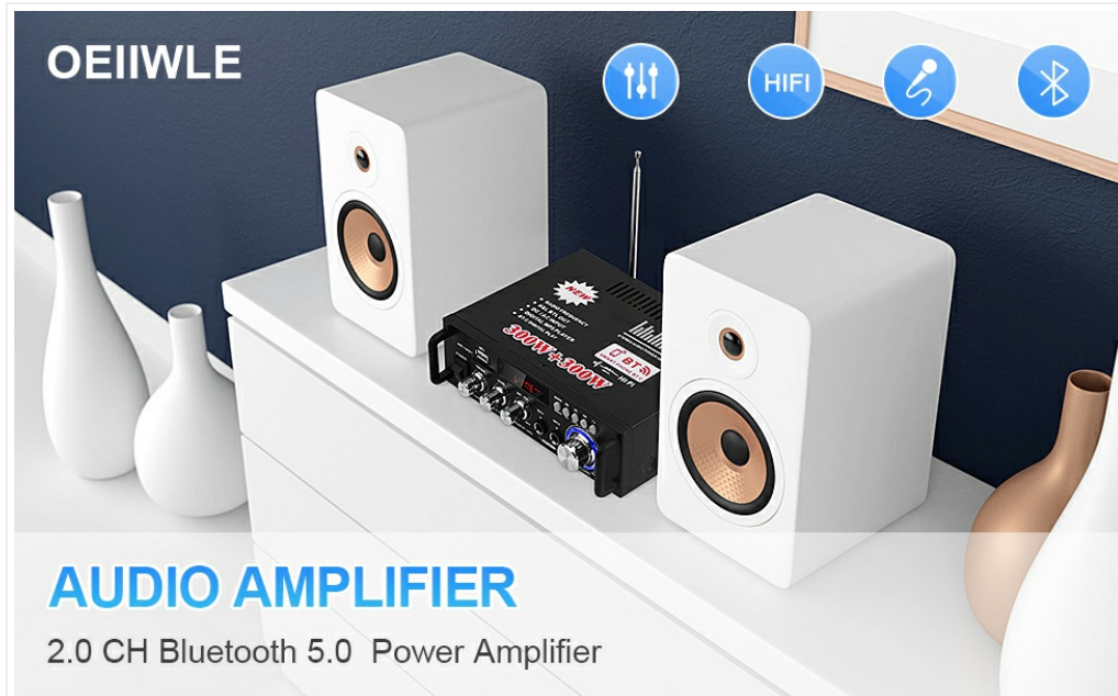
Figure 6.1: Bluetooth Connectivity