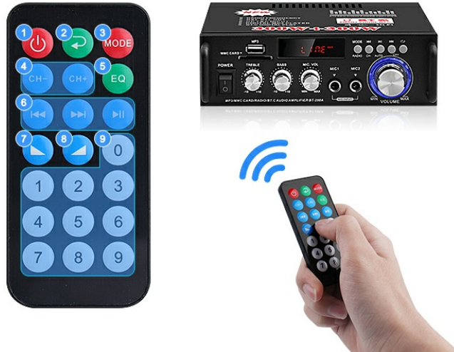
Figure 4.3: Remote Control Functions

The remote control allows for convenient operation of the amplifier from a distance. Functions include power on/off, mode selection, channel adjustment, equalizer settings, playback control, volume adjustment, and number selection for tracks/channels.