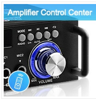
Figure 4.1: Front Panel Layout