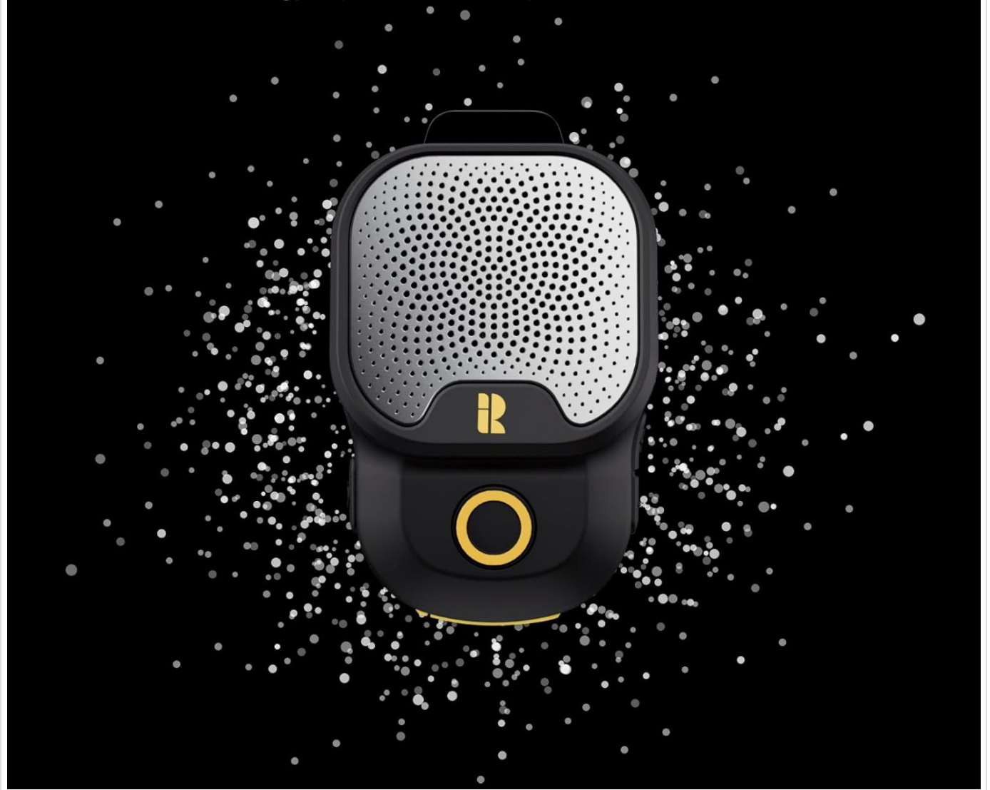
Figure 3: Enhanced Noise Cancellation. The speaker features advanced ENC noise-cancelling technology for clear communication during calls.

Industry-leading noise canceling with Dual Noise Sensor technology. Specific uses for product : Communication