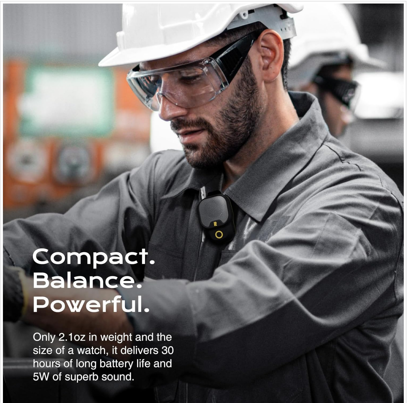
Figure 5: Speaker in Use. The speaker is shown clipped to a user's shirt, highlighting its wearable design for hands-free listening during various activities.