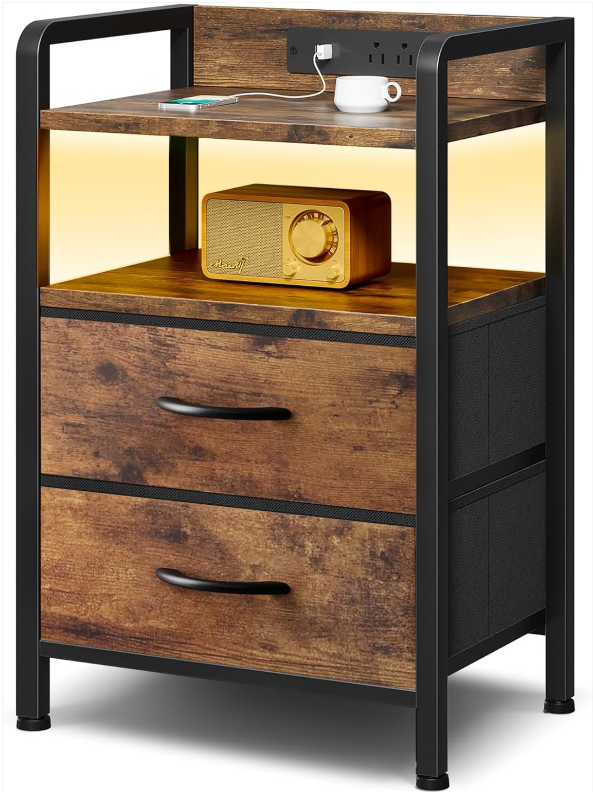
Image: The Lazzanto Night Stand, showcasing its rustic brown finish, two fabric drawers, and top shelf with integrated charging station and LED light strip.