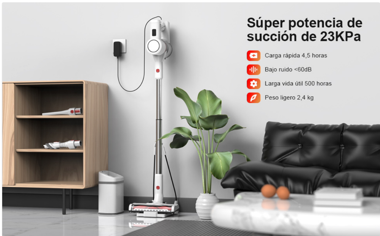
Image 6.1: The vacuum cleaner charging on its stand, highlighting its 23KPa suction power, fast 4.5-hour charge, low noise (<60dB), 500-hour lifespan, and 2.4 kg weight.