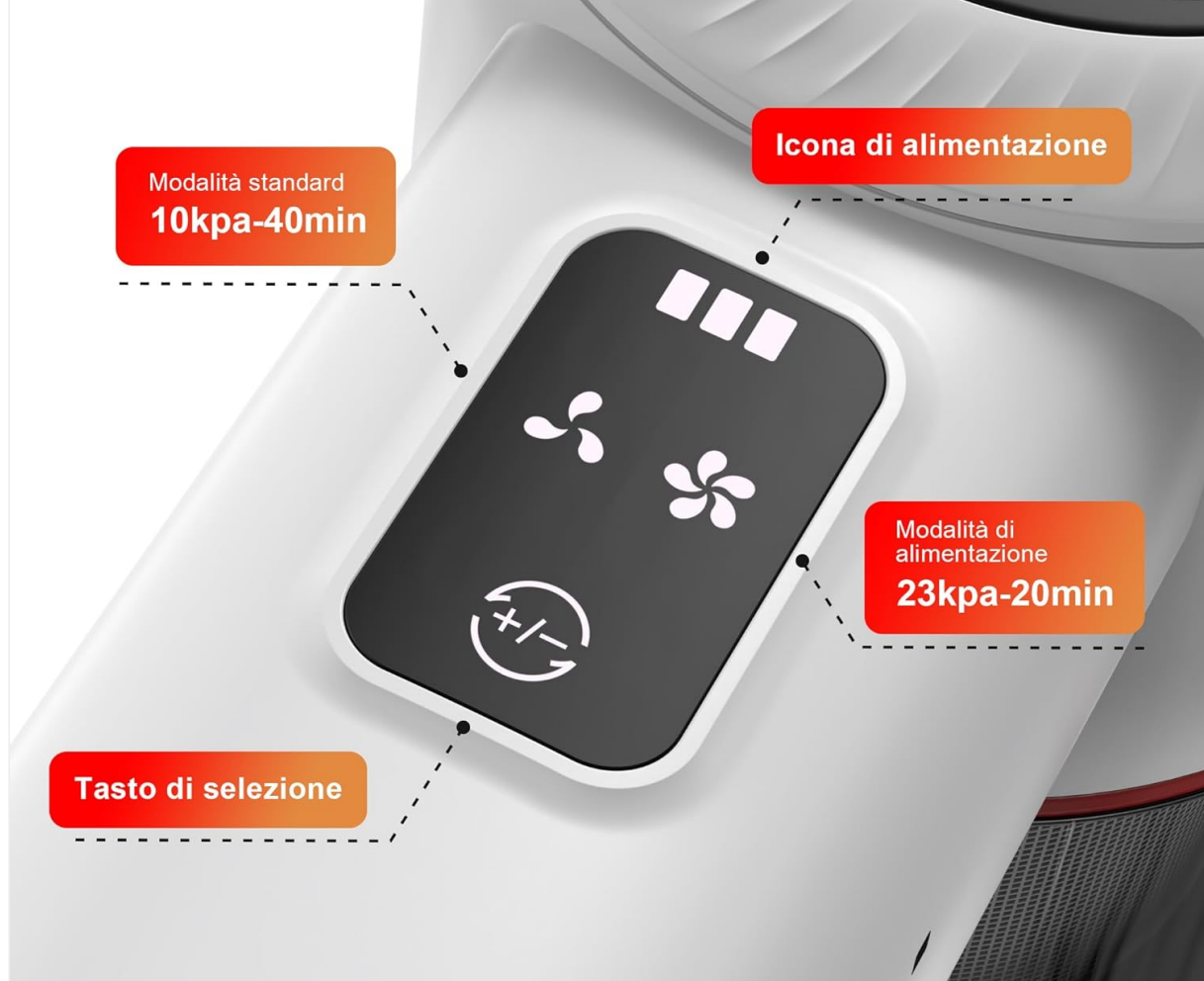
Image 4.2: Close-up of the intelligent LED touch screen, displaying power icon, standard mode (10kpa-40min), power mode (23kpa-20min), and selection button.