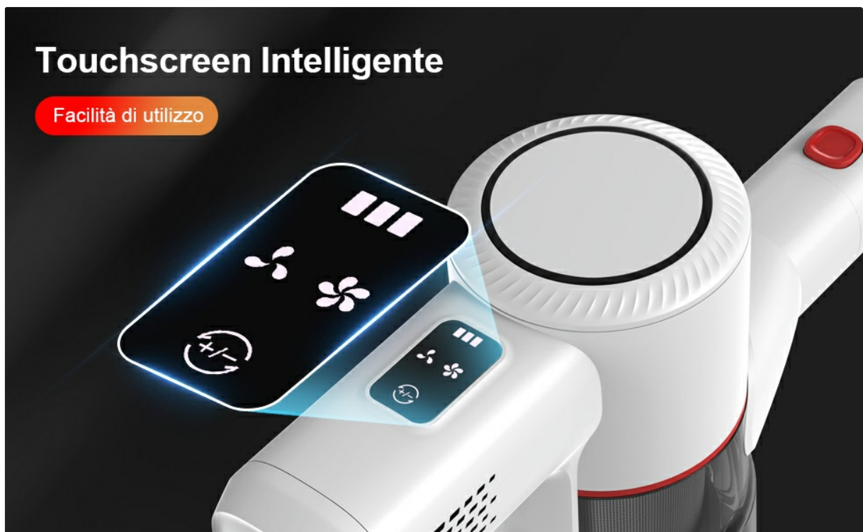
Image 6.2: The intelligent touchscreen interface, showing the fan icons for different power modes and the +/- button for selection.