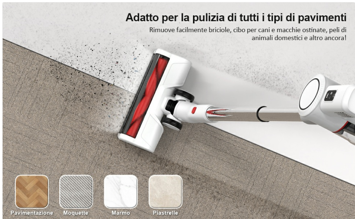
Image 6.4: The vacuum cleaner effectively cleaning different floor types, including pavement, carpet, marble, and tiles, demonstrating its versatility.

For Handheld Cleaning: Detach the telescopic tube and attach the desired accessory (crevice tool or combination brush) directly to the main body. This is ideal for cleaning furniture, curtains, shelves, and car interiors.