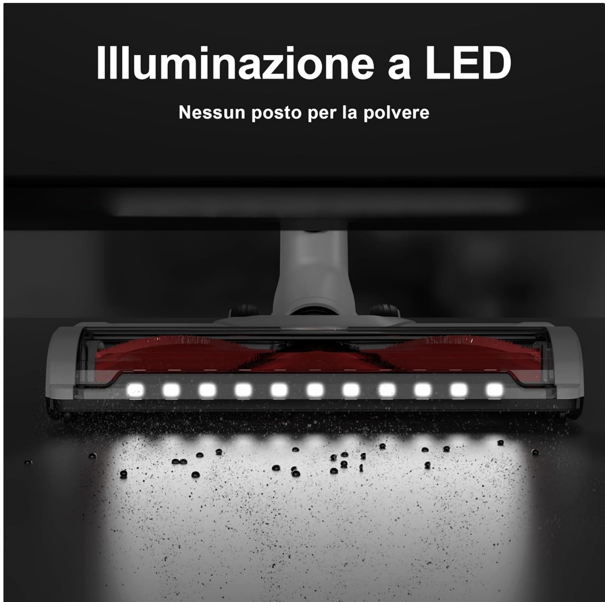
Image 6.3: Close-up of the electric brush head with its integrated LED lights, effectively illuminating dust on the floor.

For Floor and Carpet Cleaning: Attach the electric brush head and telescopic tube. The brush head features LED lights to illuminate the cleaning path, making hidden dust visible.