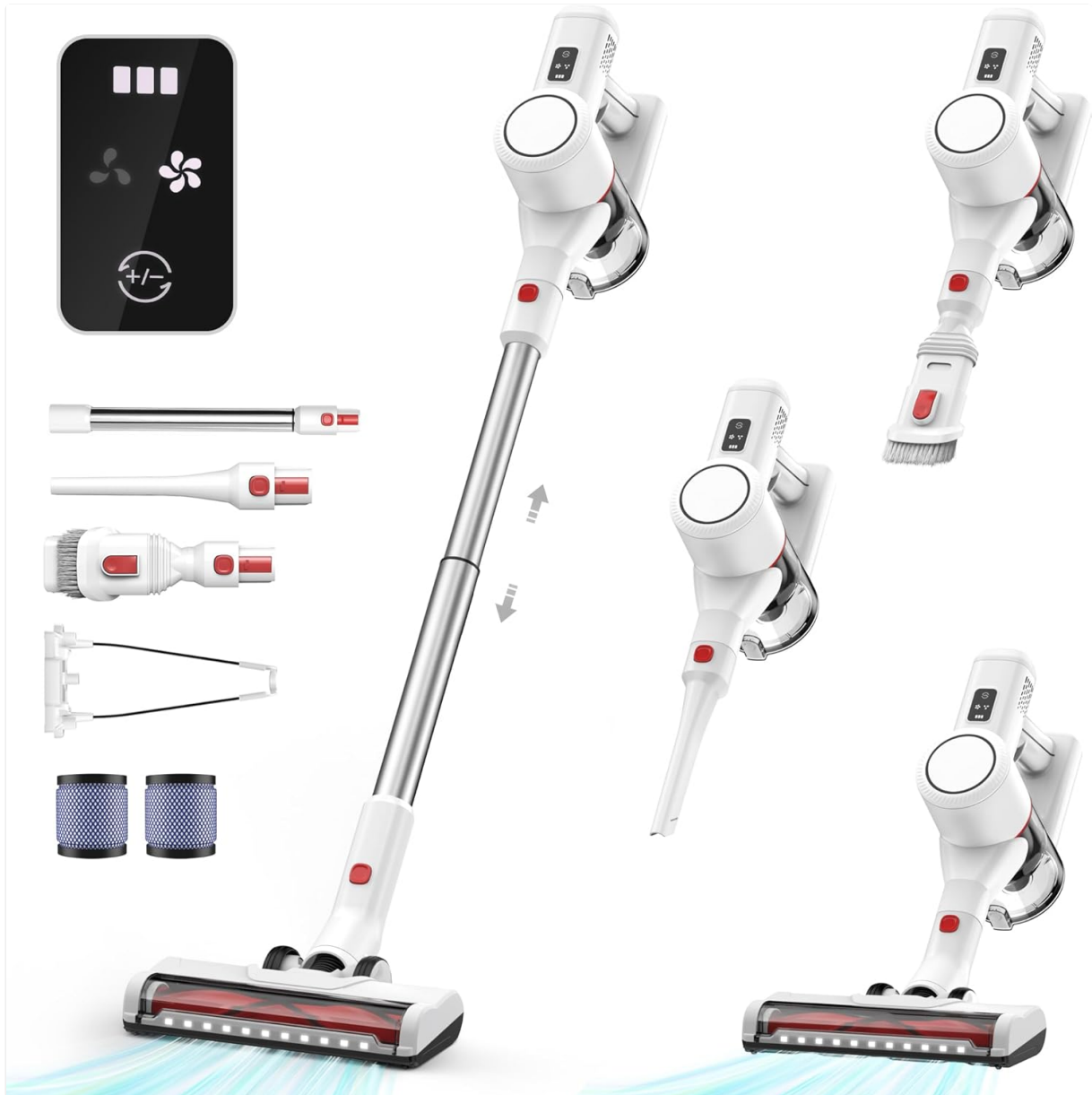
Image 4.1: The Syntecno P9-W cordless vacuum cleaner with its various attachments, showcasing its modular design.