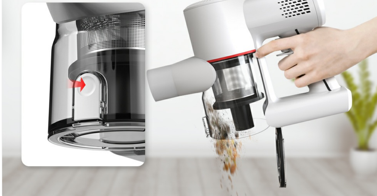
Image 7.1: A visual guide demonstrating the one-click mechanism for emptying the dustbin, showing debris falling out.