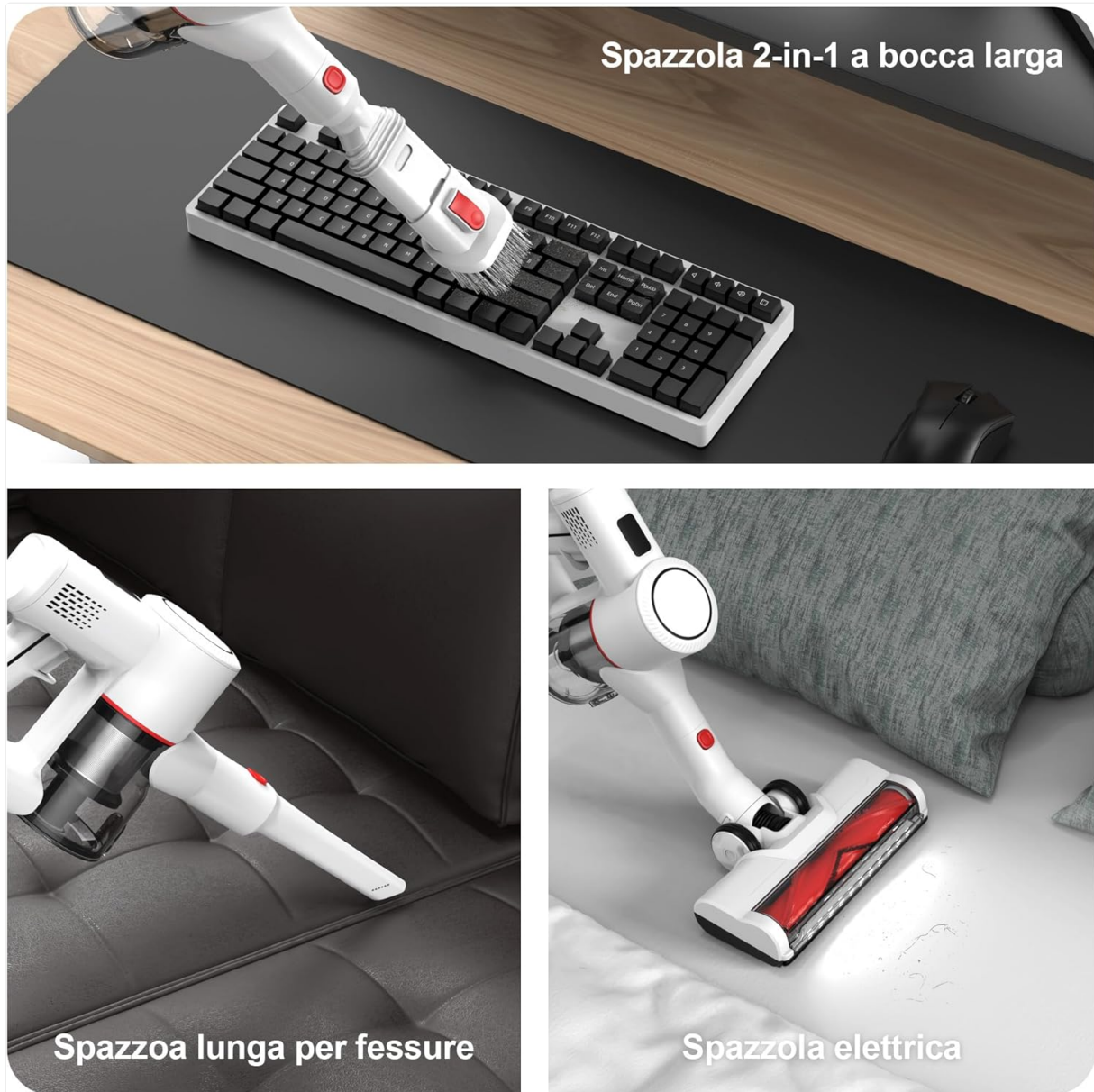
Image 5.2: Various accessories including the 2-in-1 wide mouth brush, long crevice tool, and electric brush, demonstrating their use for different cleaning tasks.