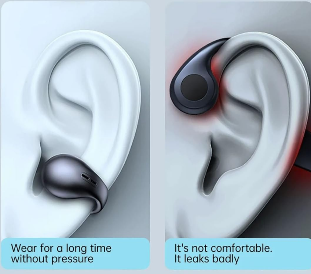
Image: A visual comparison illustrating the comfortable and secure fit of the ear-clip design, contrasting it with less comfortable alternatives that may leak sound.

Made of high elastic skin-friendly material, adjustable and stretchable, suitable for all ear shapes. Lightweight and comfortable, no clamping force can really be worn without feeling