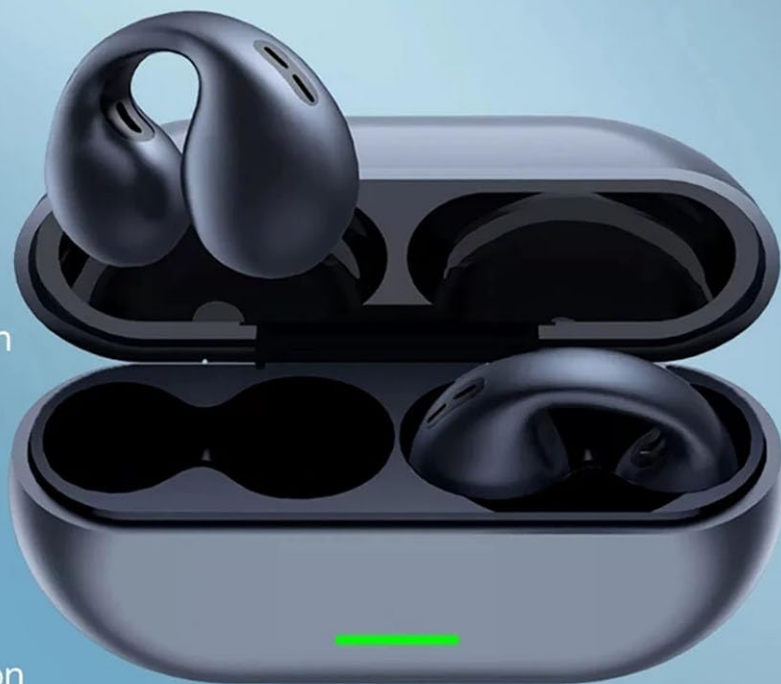
Image: The earbuds in their charging case, illustrating the long battery life and charging duration. A green light indicates charging status.