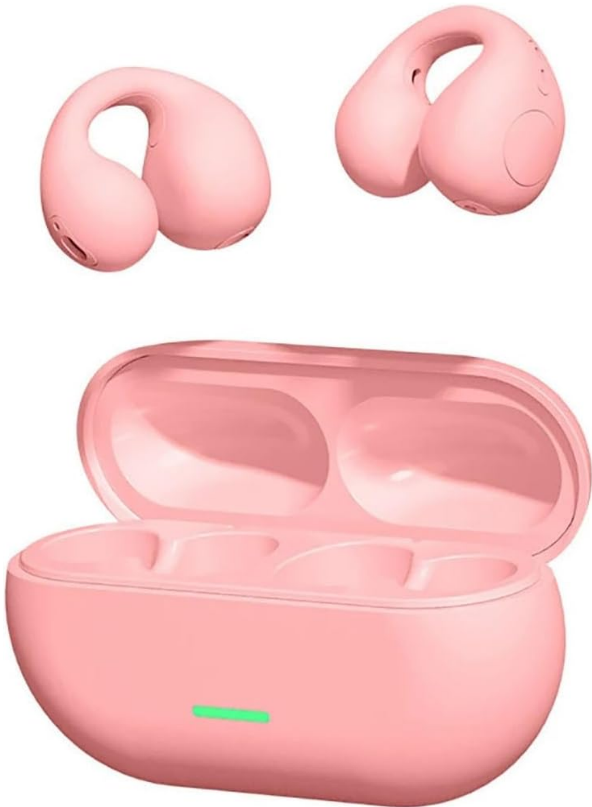
Image: The YYGGWL T75 TWS Bluetooth Earbuds in pink, shown with their open charging case. The earbuds are designed to clip onto the ear.