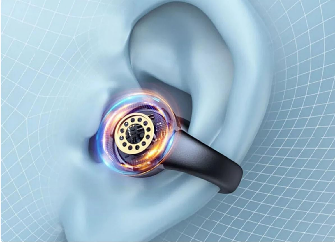
Image: An earbud positioned in an ear, visually representing the stable and high-quality audio transmission achieved through Bluetooth 5.3 technology.

Relying on advanced BT 5.3 technology, ensuring the quality of audio and video while effectively shortening the transmission interval, achieving high-speed and stable transmission of listening to music, drama, and playing games with zero latency, and enjoying the fun of synchronization