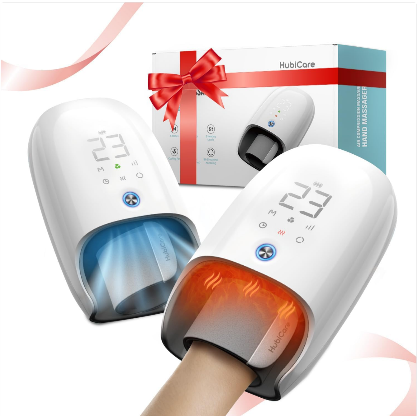
Figure 1: HuBDIC Hubicare Hand Massager with heat and cooling functions shown in use.