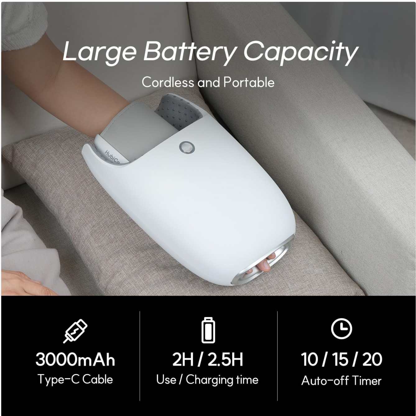
Figure 2: Large battery capacity and USB-C charging port for portability.