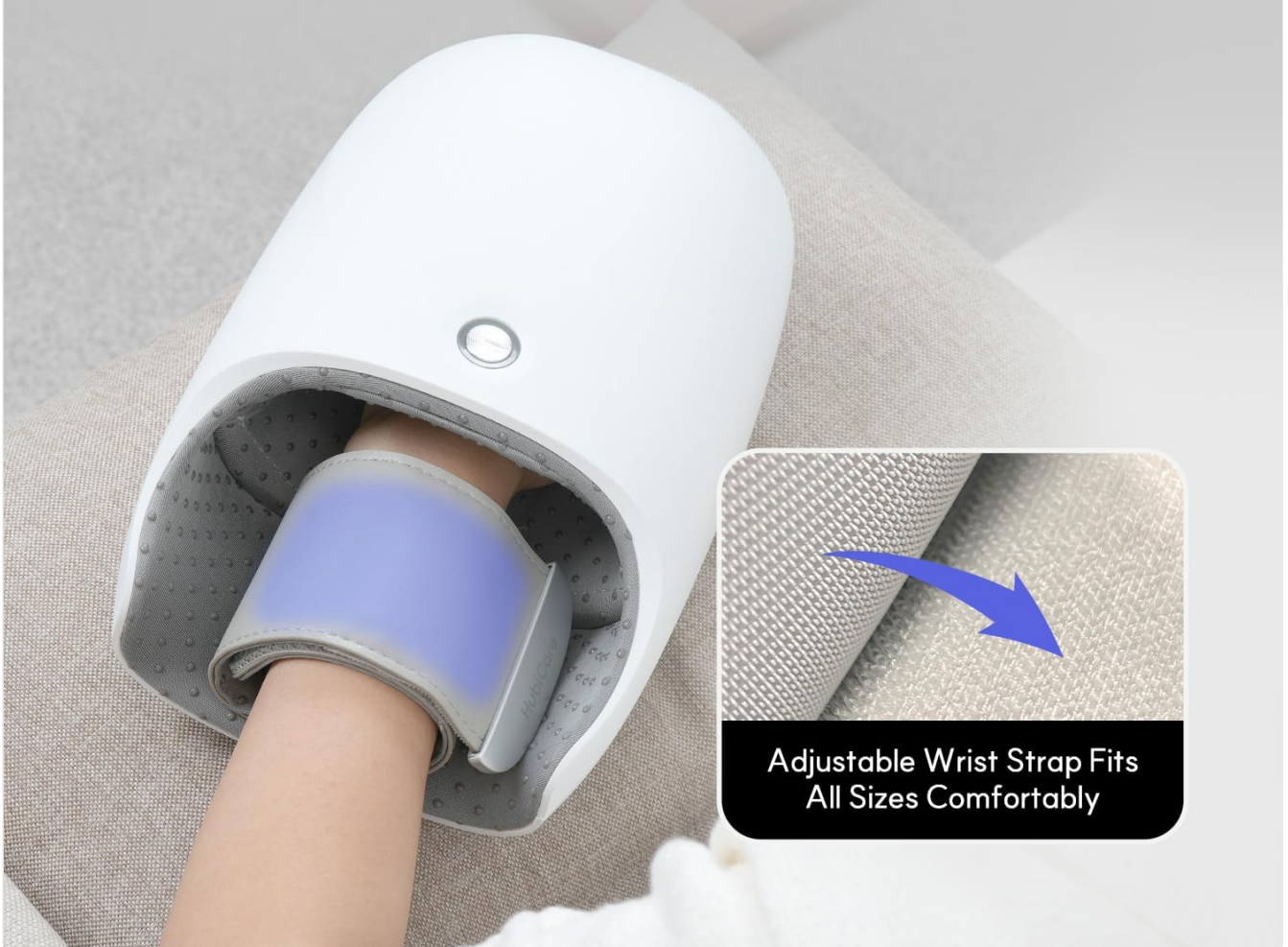
Figure 6: Wrist air compression and adjustable wrist strap for secure fit.

Alleviate Wrist Pain Effectively Adjustable Wrist Strap Fits All Sizes Comfortably