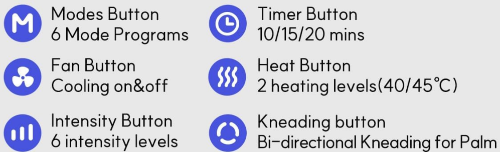
Figure 3: Easy-to-control touchscreen operation panel.