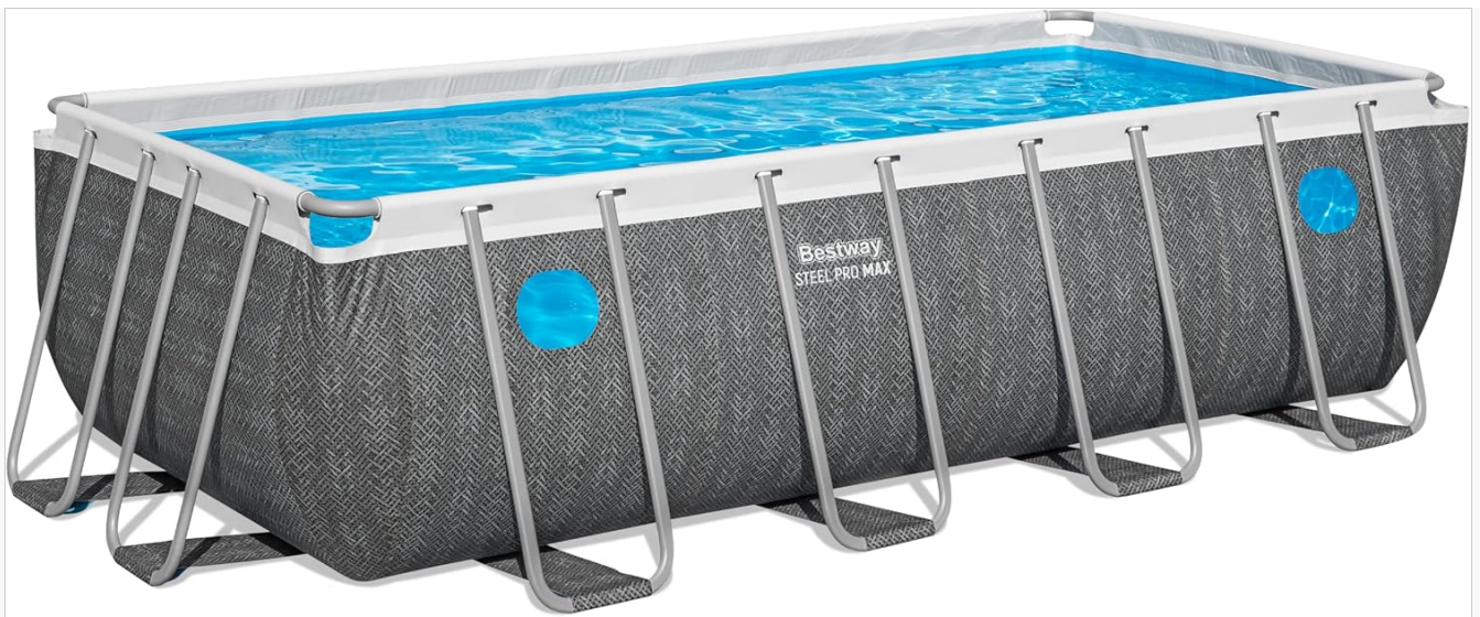
Image: An empty Bestway Steel Pro MAX Splashview rectangular above ground pool, viewed from an angle, highlighting its sturdy grey steel frame and the patterned exterior of the liner before filling with water.