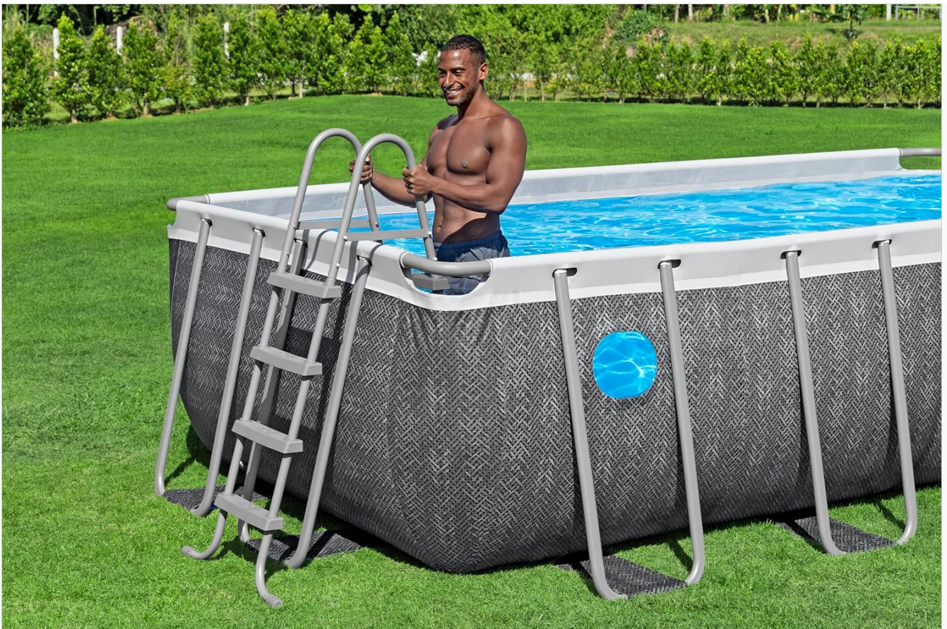
Image: A man carefully descending into the Bestway Steel Pro MAX Splashview pool using the grey safety ladder. The pool's patterned exterior and a blue Splashview window are visible.