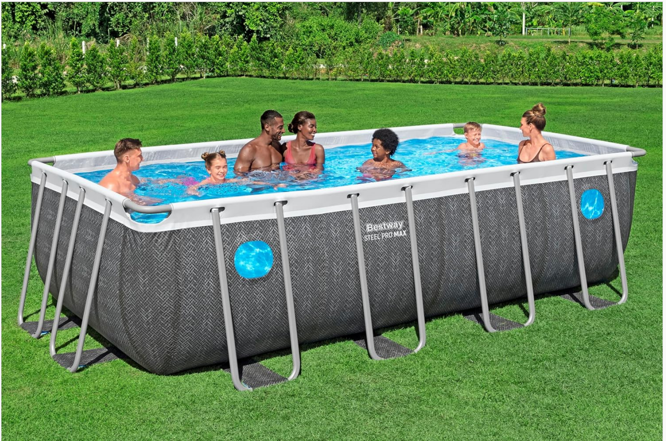
Image: A family of six enjoying the Bestway Steel Pro MAX Splashview rectangular above ground pool, showcasing its size and the clear blue water. The pool's grey patterned exterior and sturdy frame are visible.