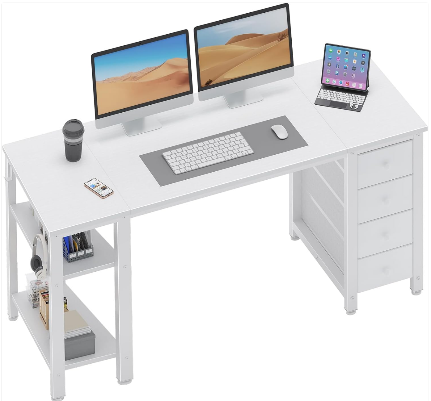
Figure 1: Lufeiya White Computer Desk setup with dual monitors and accessories.