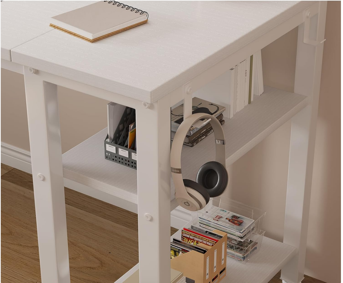
Figure 4: Customize your storage space by selecting one of two available shelf heights.

| Organize your headphone, bags and other things