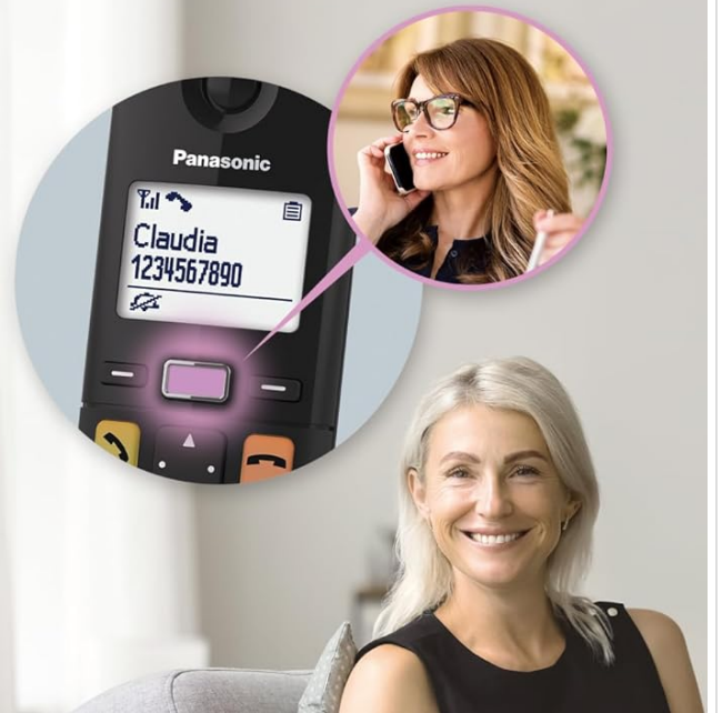
Image: A composite image showing the phone's screen with caller ID information and the highlighted Favorite Call button, alongside a person using the phone.

VOYEZ CLAIREMENT QUAND VOS PROCHES VOUS APPELLENT