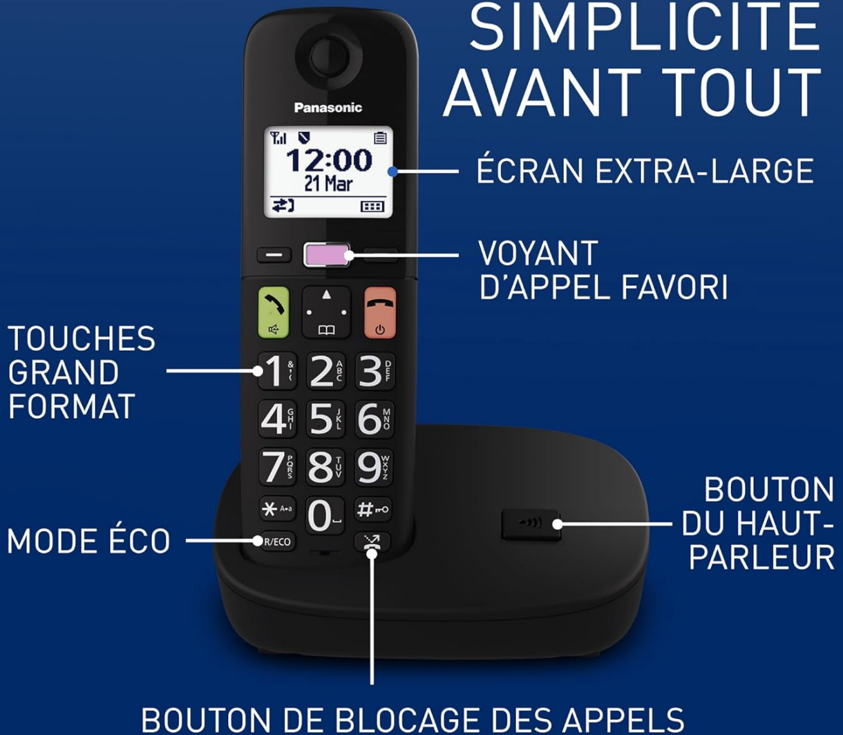
Image: A diagram of the phone highlighting its extra-large screen, favorite call indicator, large keys, ECO mode, speaker button, and call block button.