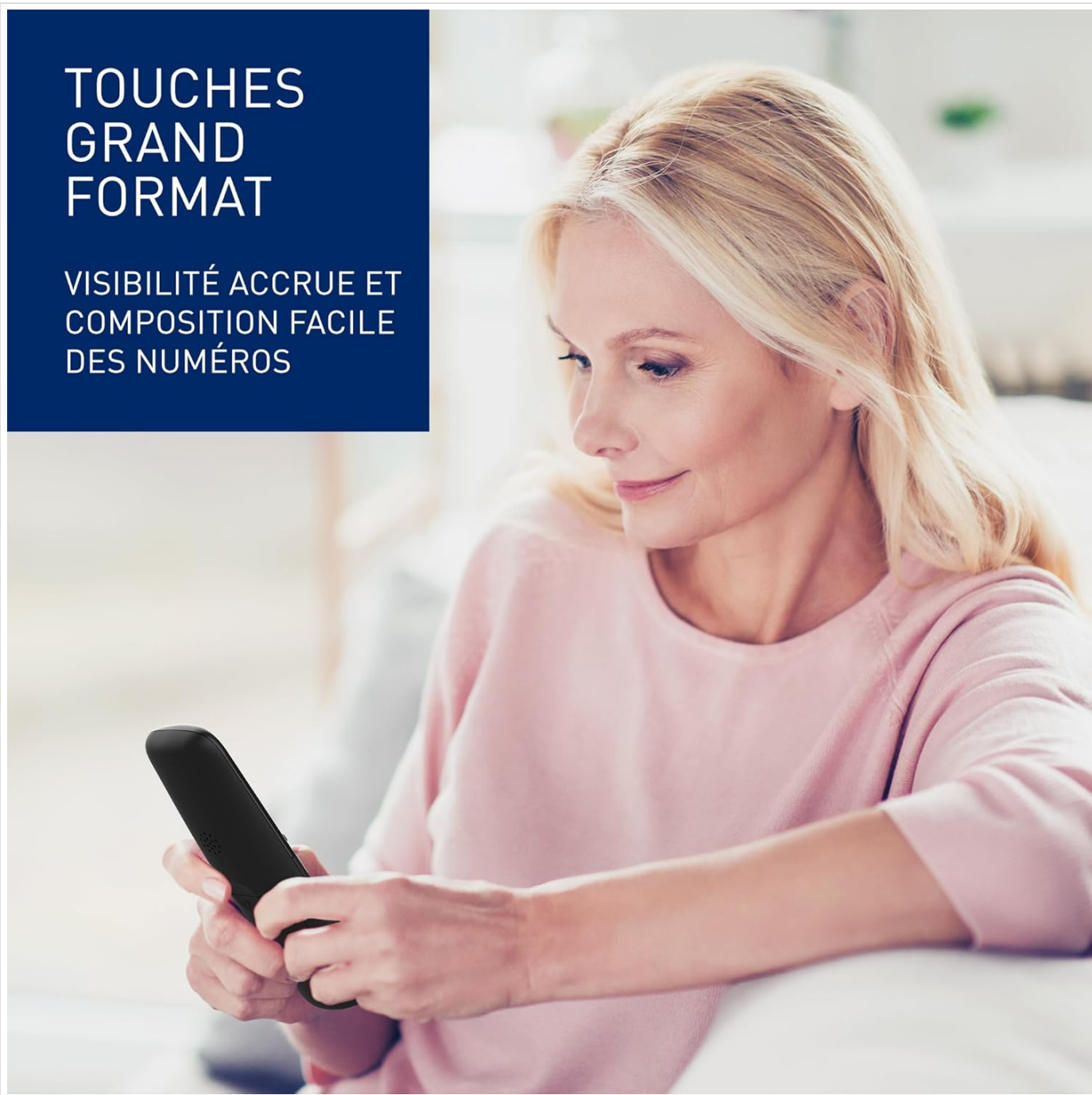
Image: A woman holding the Panasonic cordless phone, with a magnified inset showing the large, clearly visible numeric keys.

VISIBILITÉ ACCRUE ET COMPOSITION FACILE DES NUMÉROS