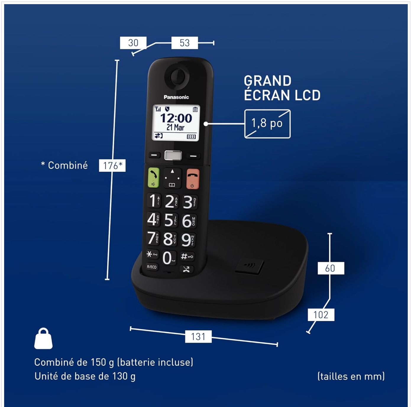
Image: A diagram illustrating the dimensions of the Panasonic KX-TGU110EXB handset and base unit in millimeters.