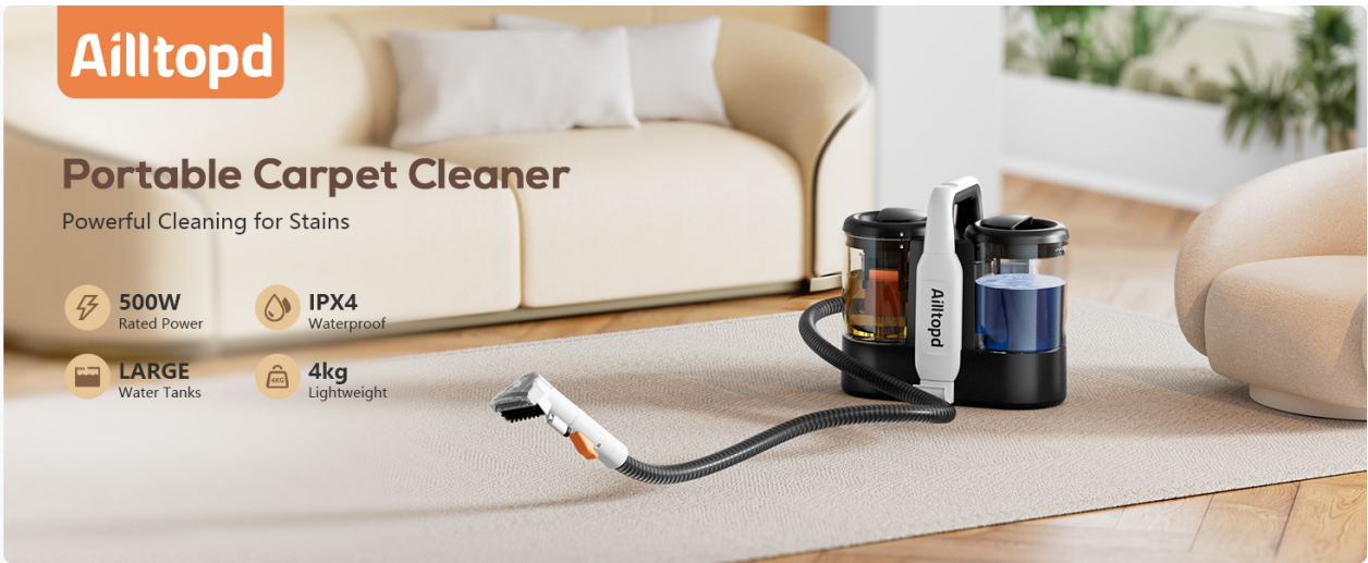
Image 4.2: Visual representation of the spray, brush, and suction functions.