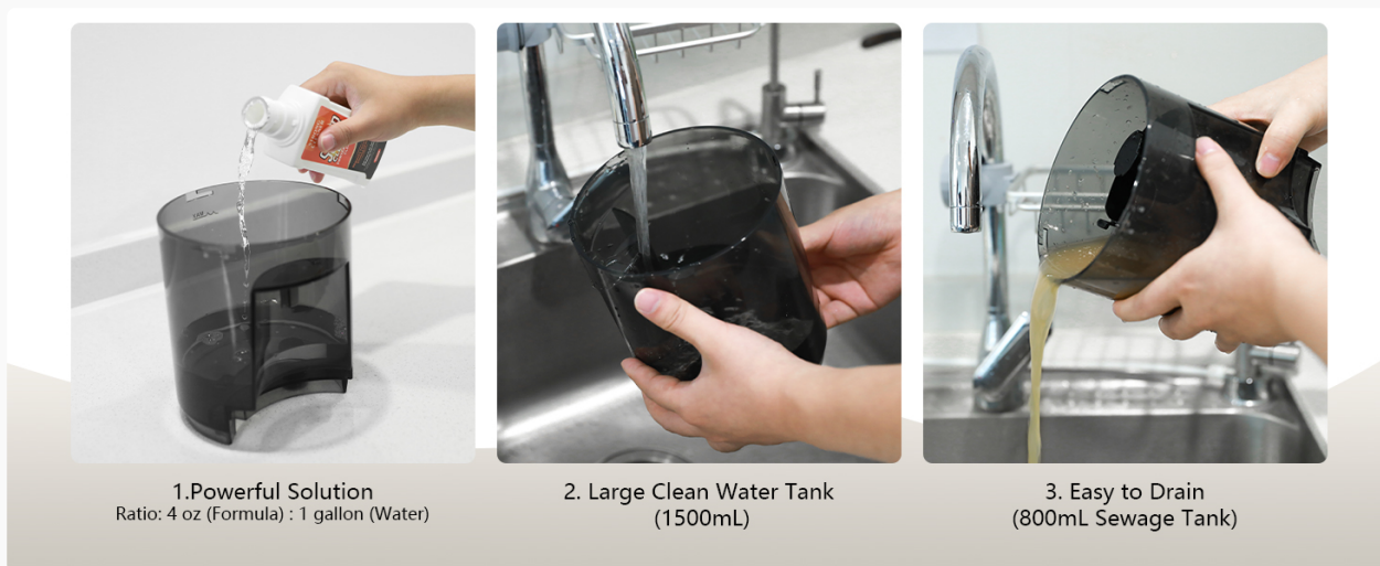
Image 3.1: Steps for preparing the cleaning solution and managing water tanks.