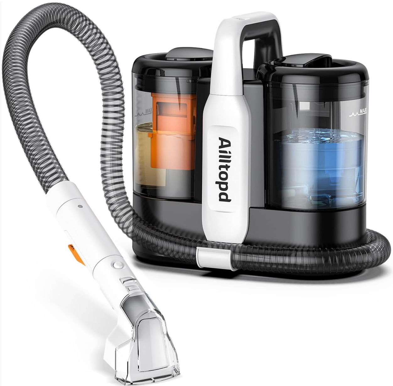
Image 1.1: Ailltopd Powerful Suction & Spot Remover (Model C5) with its hose and brush head.