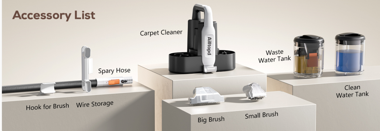
Image 2.1: All components included with the Ailltopd Powerful Suction & Spot Remover.