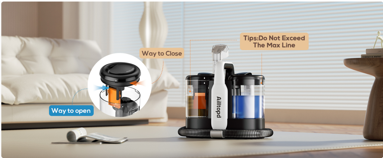
Image 3.2: Visual guide for opening and closing the water tank, highlighting the MAX fill line.