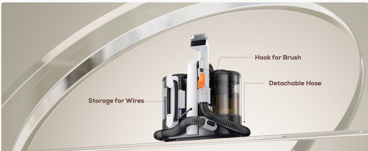
Image 5.2: Features for organized storage of the hose and power cord.