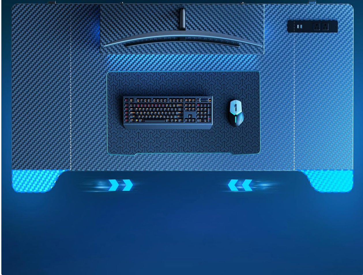
Figure 5: Ergonomic concave design for comfortable arm placement.