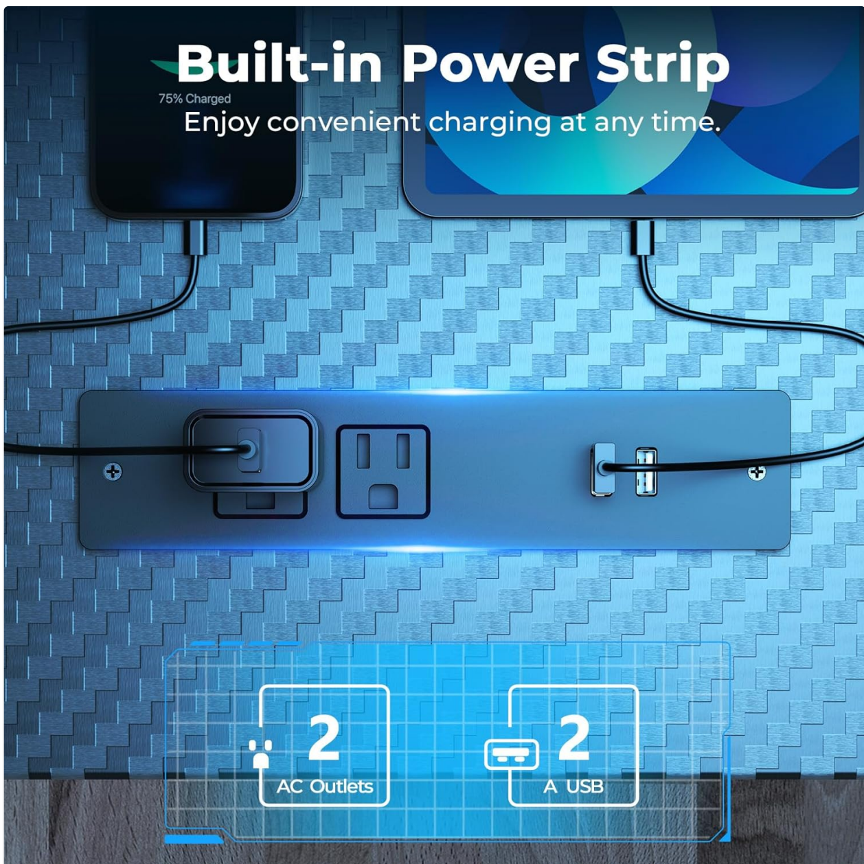
Figure 3: Convenient built-in power strip on the desktop.