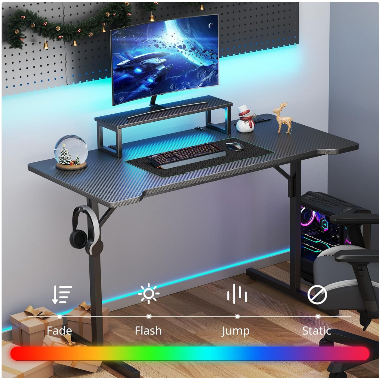
Figure 4: Customizable RGB LED lighting for enhanced ambiance.