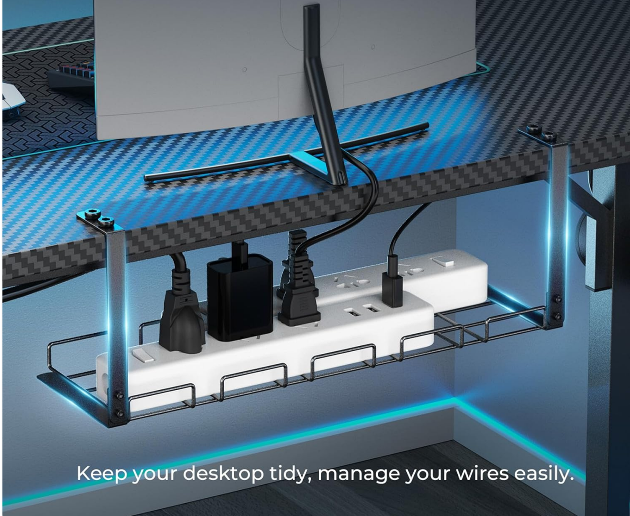
Figure 2: Integrated cable management tray for a tidy workspace.