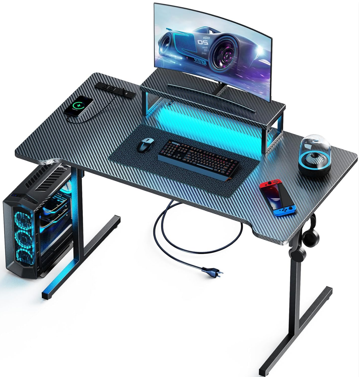
Figure 1: Overall view of the DOMICON 55 Inch Computer Gaming Desk.