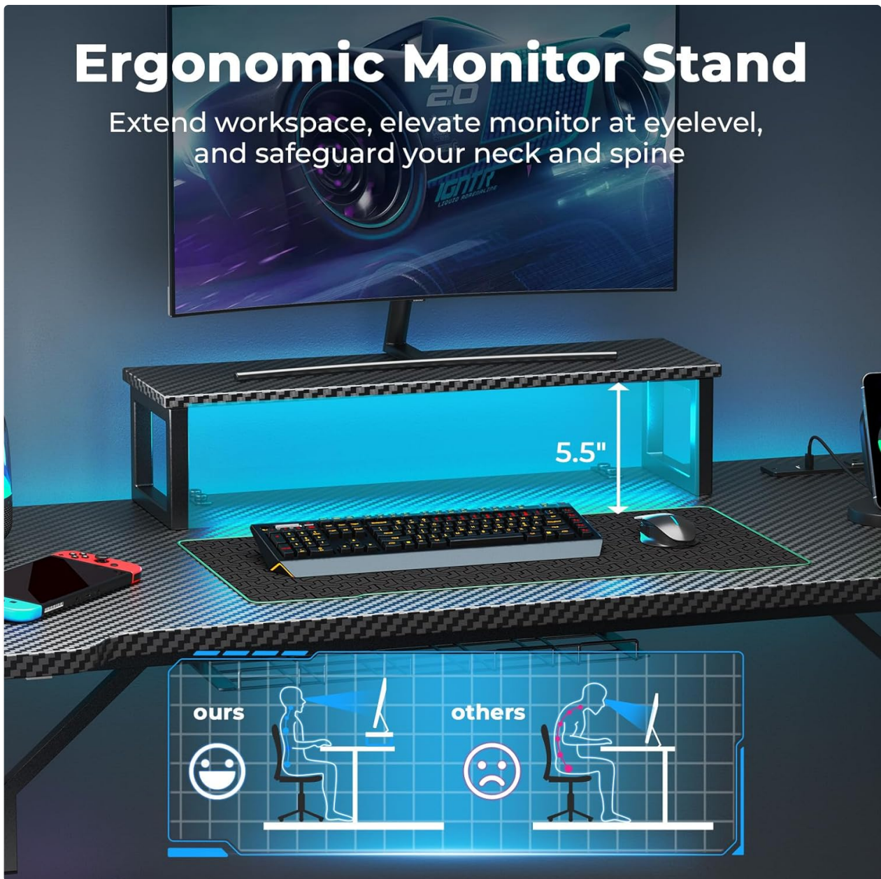
Figure 6: Adjustable monitor stand for improved posture.

Extend workspace, elevate monitor at eyelevel, and safeguard your neck and spine