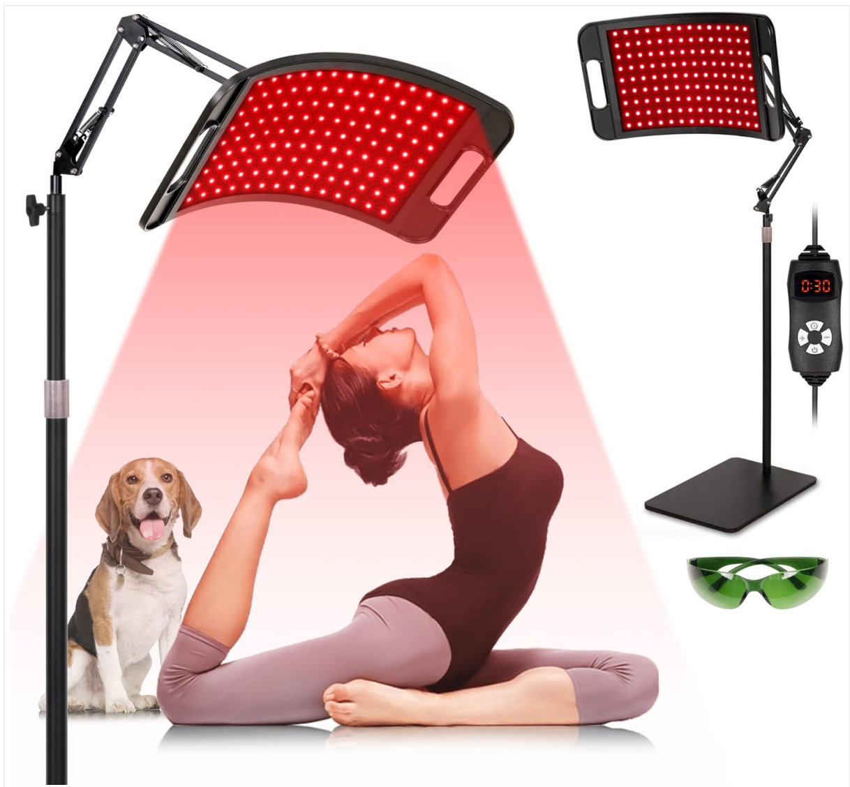
Figure 1: SAVILER Red Light Therapy Device overview.