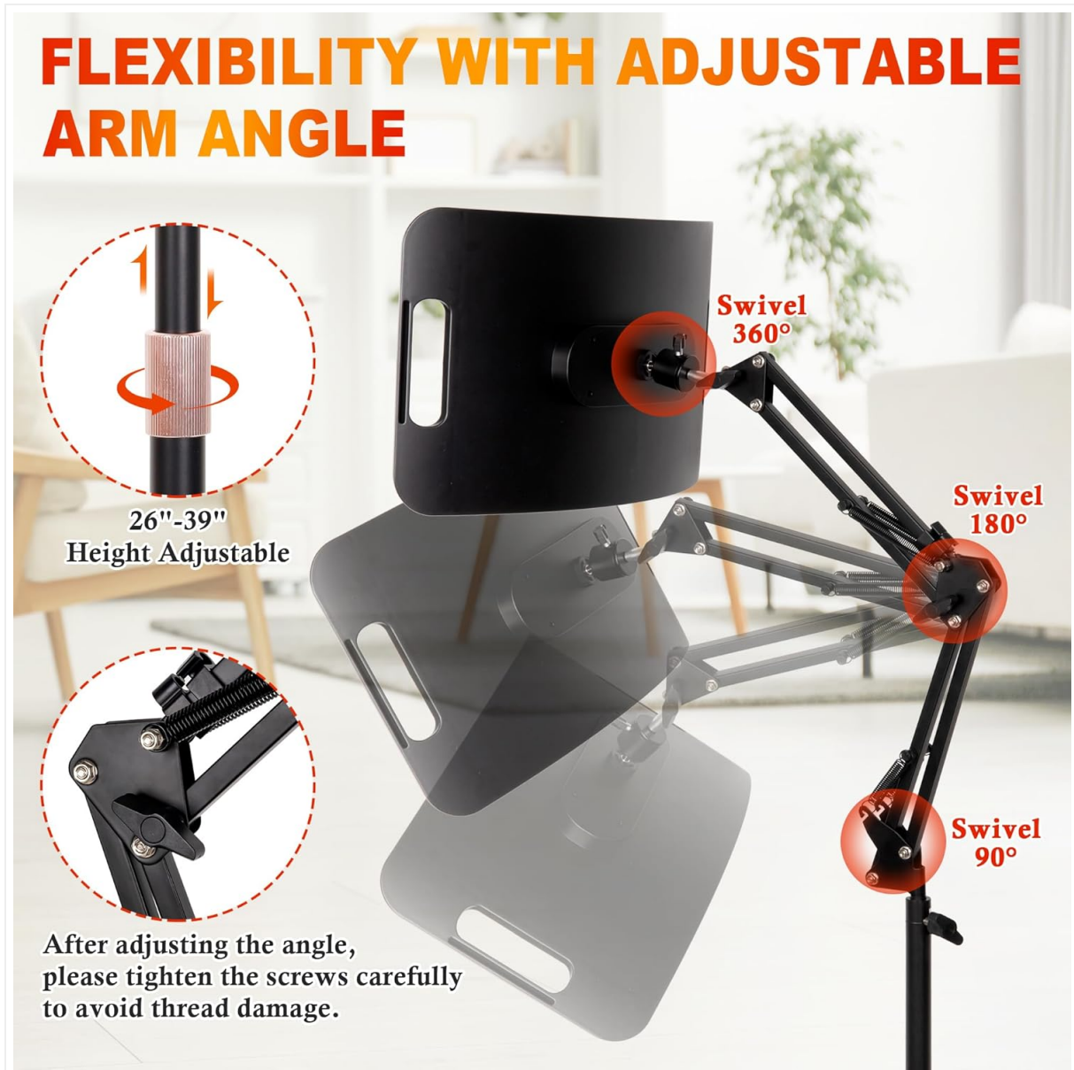
Figure 2: Adjustable arm and height features.