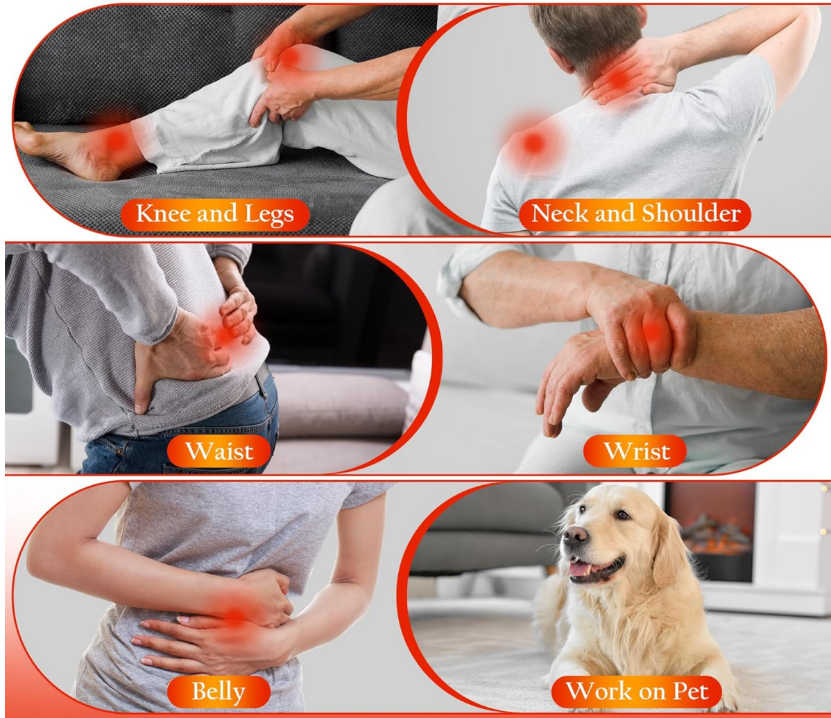
Figure 5: Full body application of red light therapy.