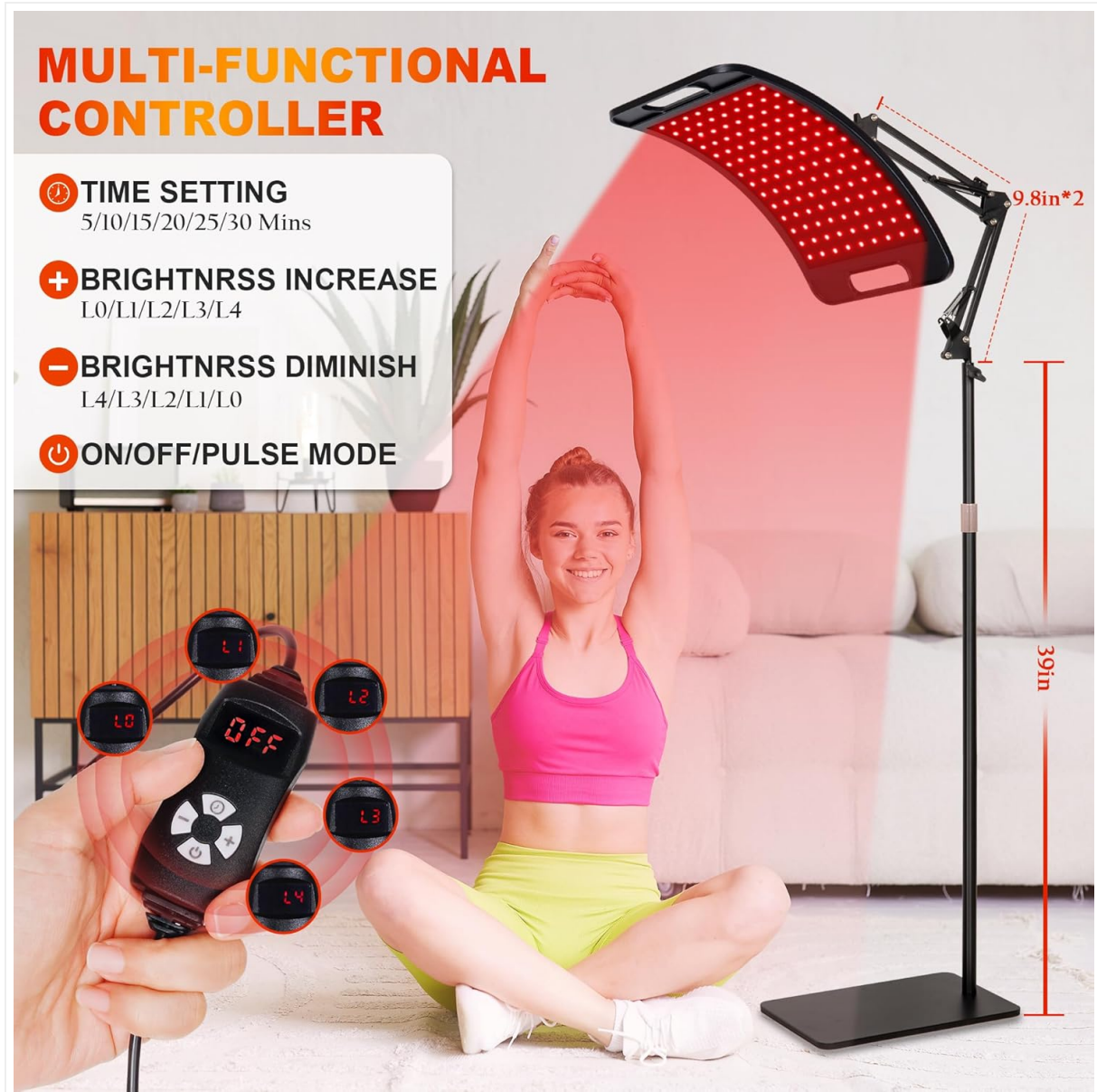
Figure 3: Multi-functional controller.