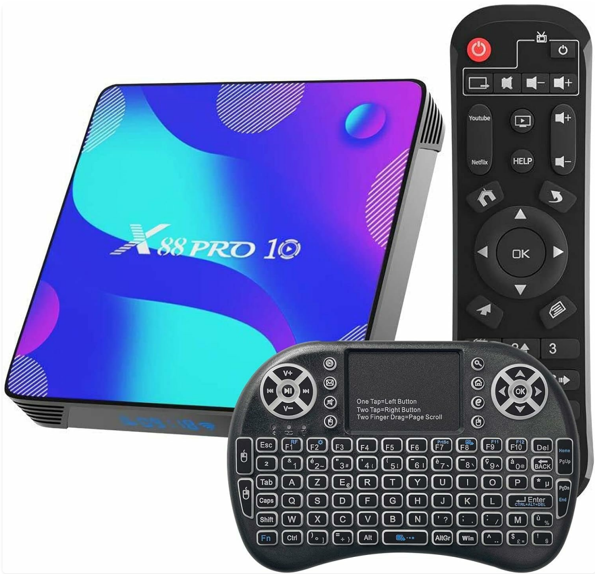
Image: The WEILY Android 11.0 TV Box displaying its user interface with various applications and the included remote control.