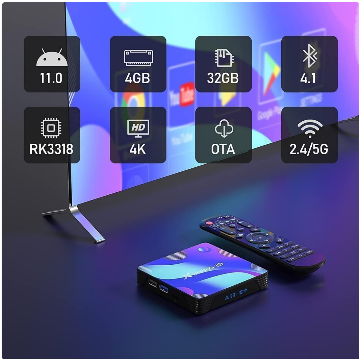
Image: Visual summary of the WEILY Android TV Box's core features and specifications.