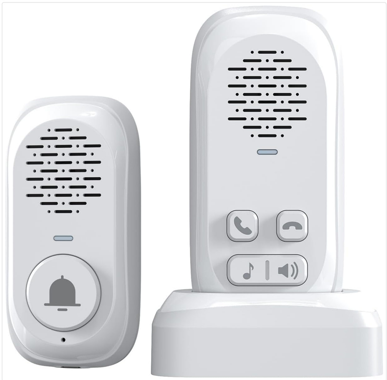
This image displays the PANDAAR Wireless Intercom Doorbell S1, featuring the compact outdoor unit on the left and the indoor unit with its charging base on the right. Both units are white and have speaker grilles and control buttons.