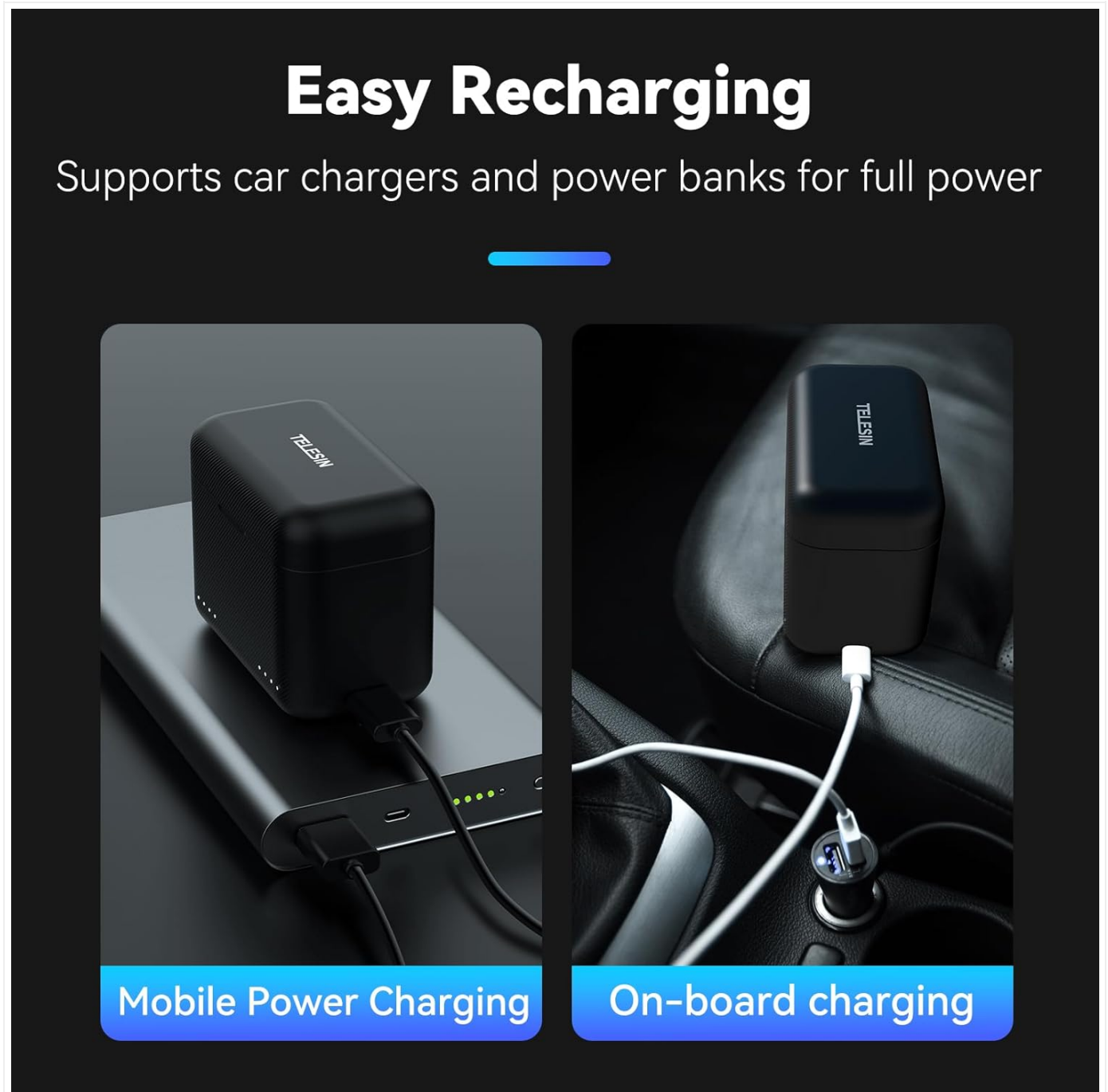
Image 4: The TELESIN X4 charger supports flexible recharging options, including mobile power banks and car chargers, for convenience on the go.