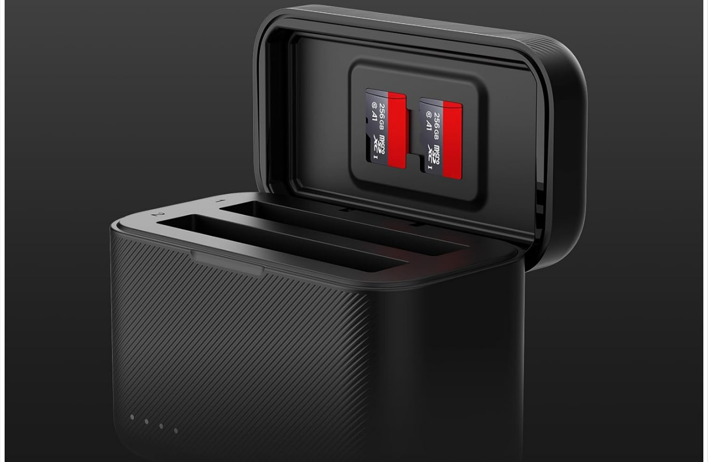
Image 2: The charger features a dual-slot design for batteries and partitioned storage for micro SD cards, ensuring organized and secure keeping.

Features two built-in TF card slots for organized storage