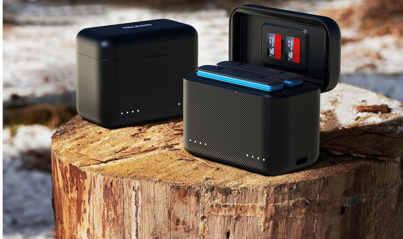
Image 1: The TELESIN X4 Dual Battery Charger and Storage Case, a compact solution for charging and storing Insta360 X4 batteries and micro SD cards.

Dual Battery Charging | Partitioned Storage | Power Level Display