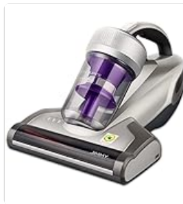
Figure 5: Shows the detachable and washable dust cup for easy cleaning.