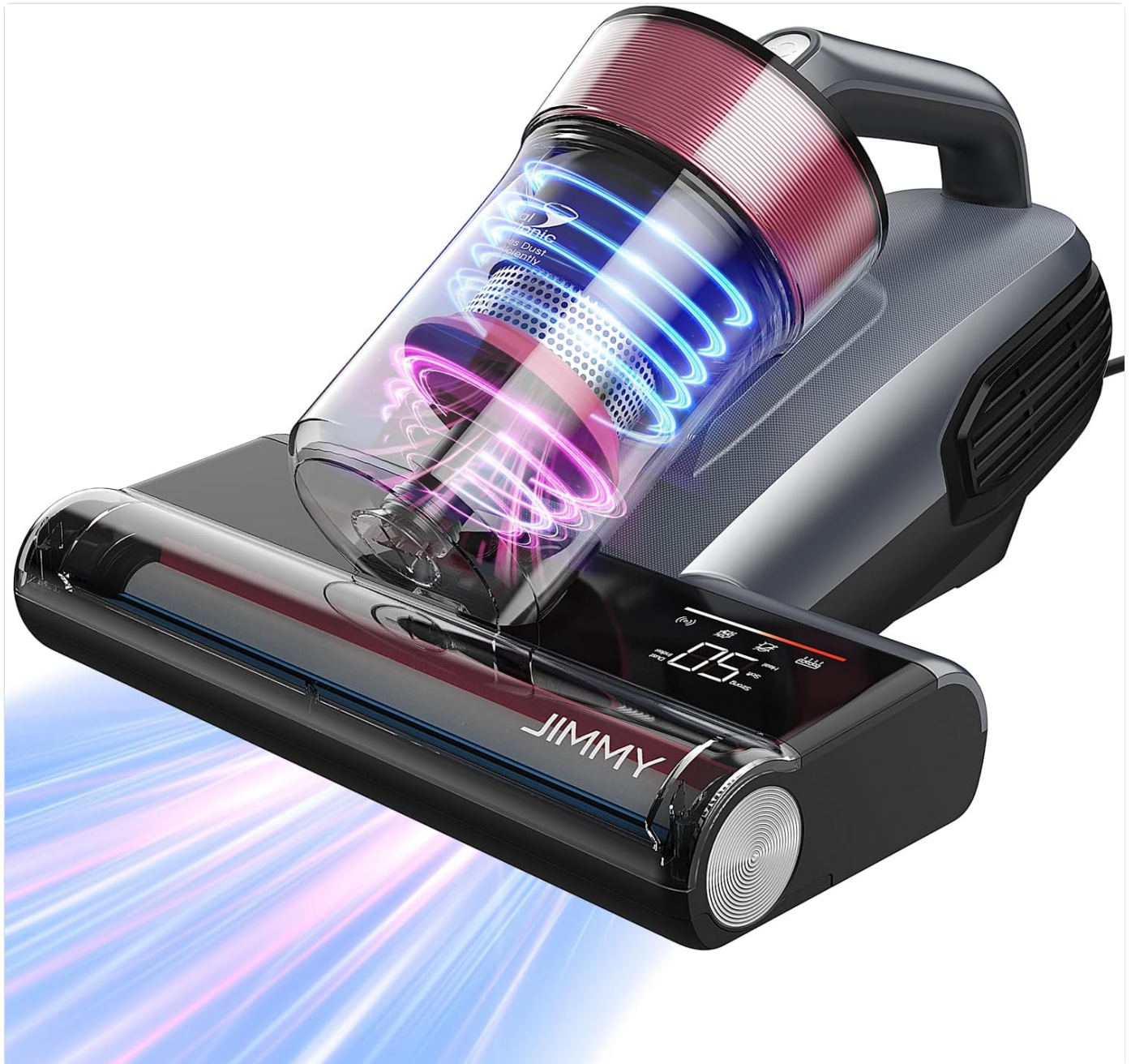
Figure 1: Main view of the Jimmy BX8 Mattress Vacuum Cleaner, showcasing its sleek design and transparent dust cup.

The Jimmy BX8 is engineered for comprehensive fabric cleaning, combining powerful suction with advanced sanitization features.