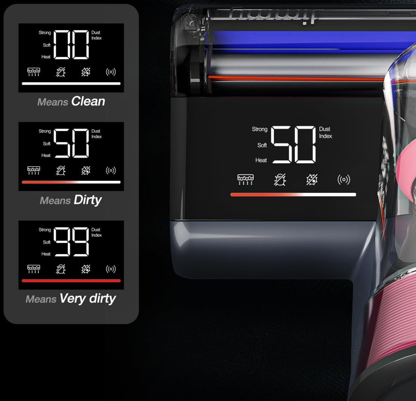
Figure 3: Close-up of the LED screen displaying cleaning modes and the smart dust sensor's real-time dust index.