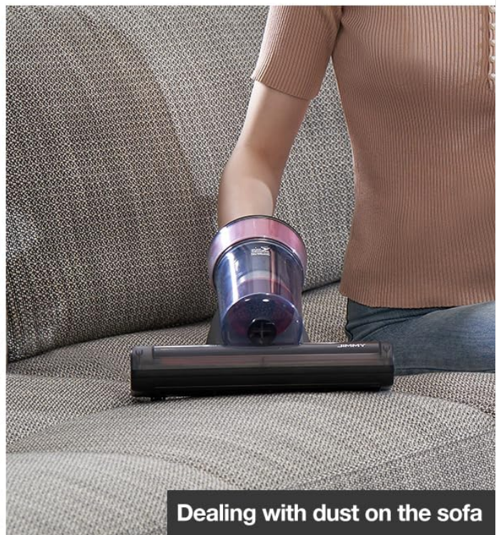
Figure 4: Demonstrates the versatility of the Jimmy BX8 for cleaning mattresses, pet hair, and sofas.