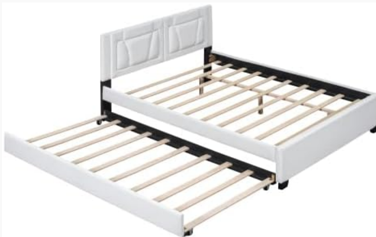
Figure 3.2: Angled view of the bed frame, highlighting the wooden slats for mattress support and the integrated trundle bed mechanism.