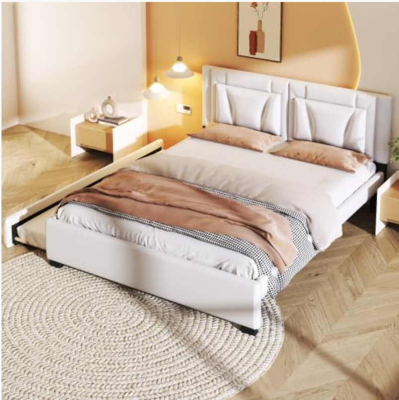
Figure 5.1: The queen bed frame with the twin trundle bed partially extended, demonstrating its space-saving design.

The twin-size trundle bed is equipped with wheels for easy maneuverability. It can be pulled out from either side of the main bed frame, providing flexibility in room arrangement. Simply grasp the trundle frame and gently pull it out from under the main bed. To store, push it back into place until it is fully nested under the main frame.