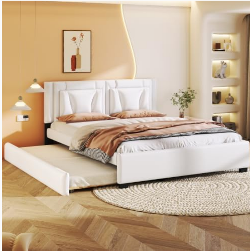
Figure 5.3: An alternative view of the queen bed frame with the trundle fully extended, showcasing its integration.