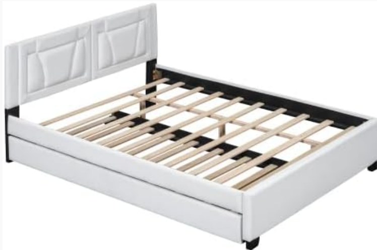
Figure 4.2: Overhead view of the assembled bed frame, showing the arrangement of the wooden slats and the trundle bed underneath.