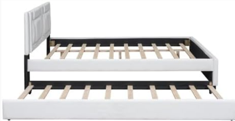
Figure 3.1: Side view of the bed frame with its internal slat support system and the pull-out trundle bed frame.

parts for the queen bed and trundle may arrive on different dates.