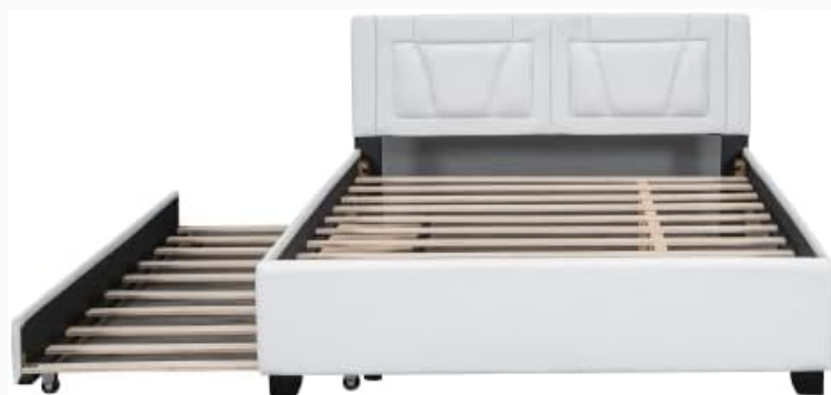
Figure 3.3: Front view of the bed frame, illustrating the main bed's slat foundation and the trundle bed's accessible design.