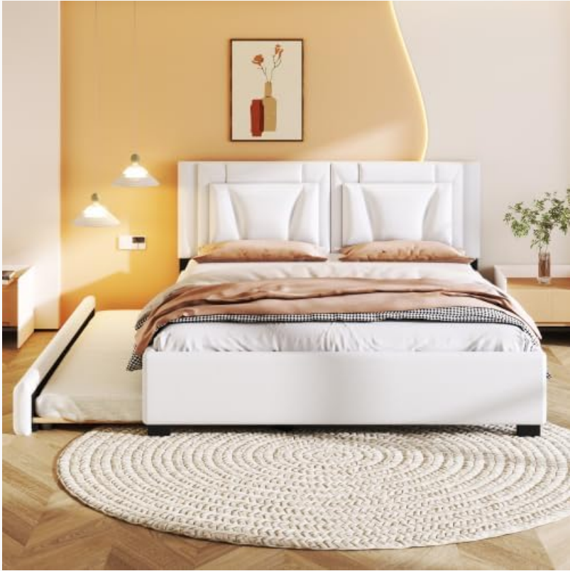
Figure 5.2: The queen bed frame with the twin trundle bed fully extended, ready for use as an additional sleeping area.