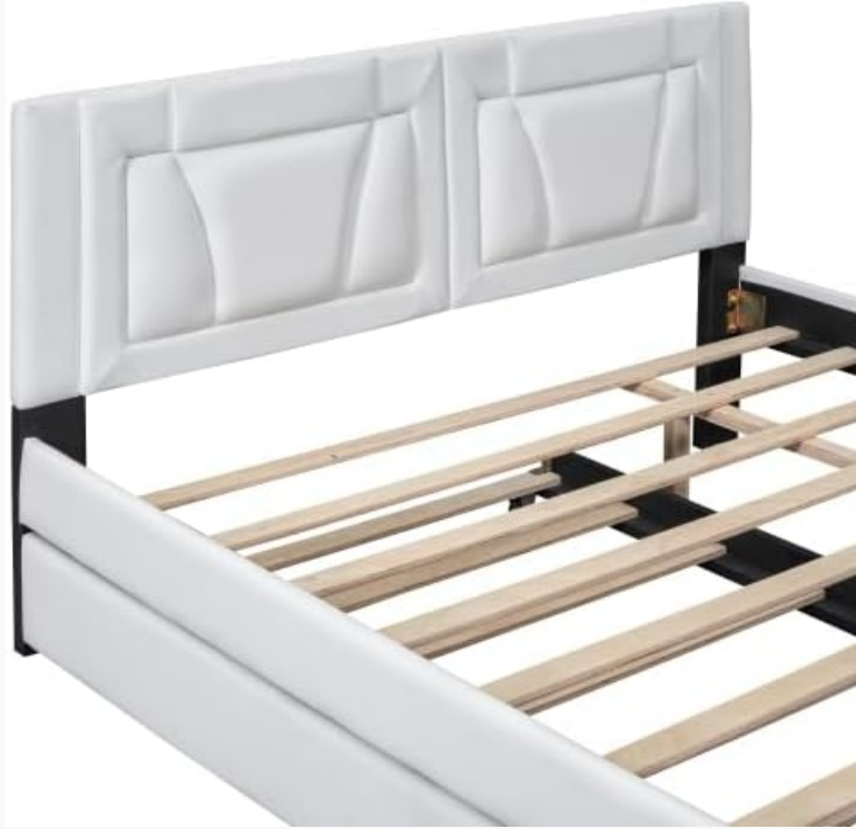
Figure 4.1: Detail of the upholstered headboard and its connection to the bed frame, showcasing the soft padding.