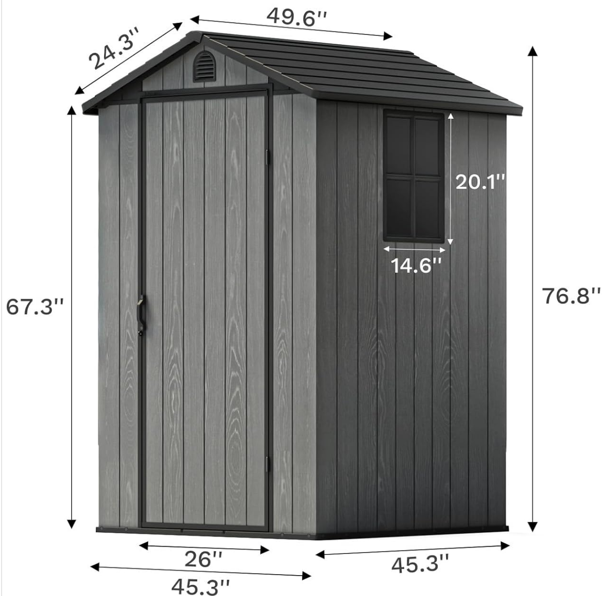
Figure 2: Shed dimensions (45.3"D x 45.3"W x 76.8"H).