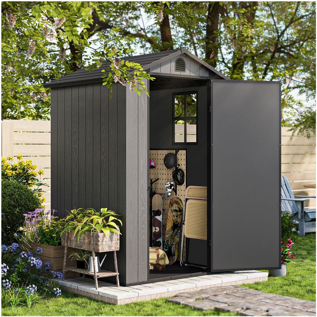
Figure 1: Patiowell 4x4 Plastic Outdoor Storage Shed exterior.

connections are tight for a stable foundation.