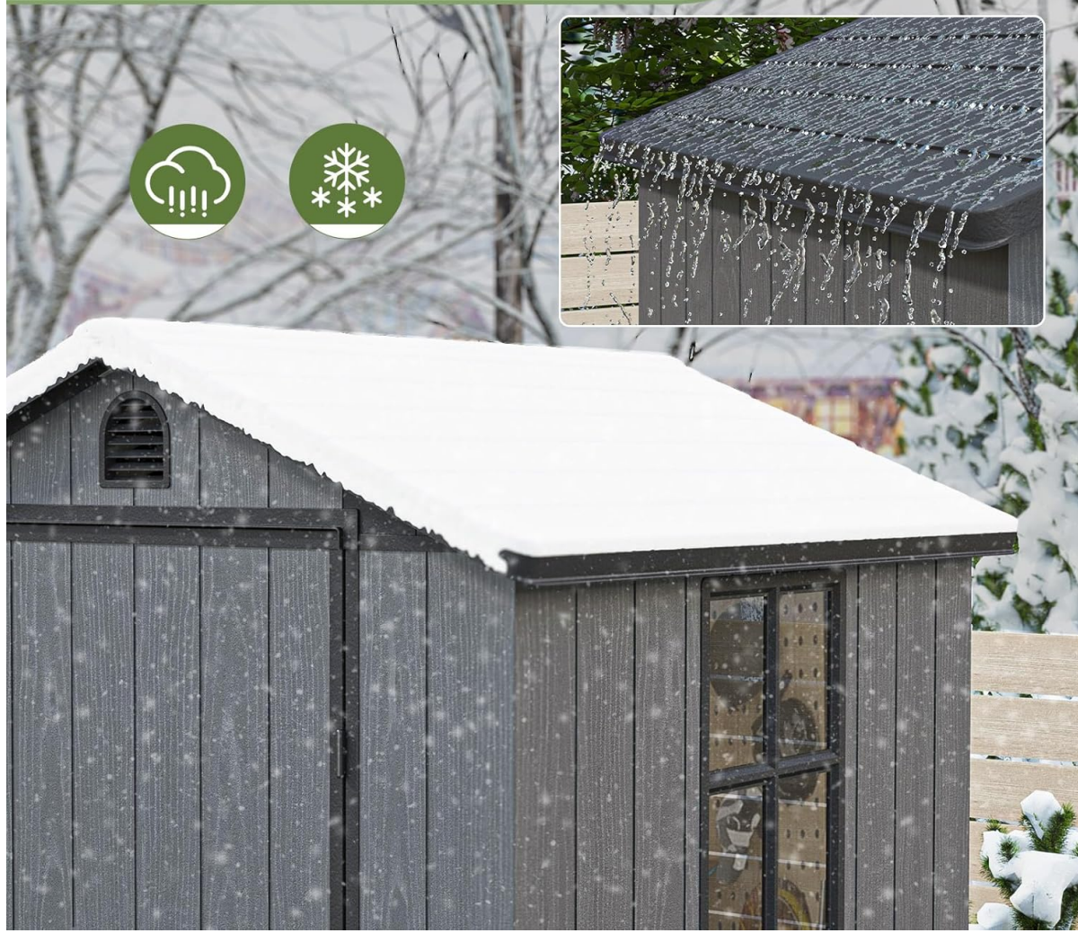
Figure 4: Groove and slop design for all-weather protection.