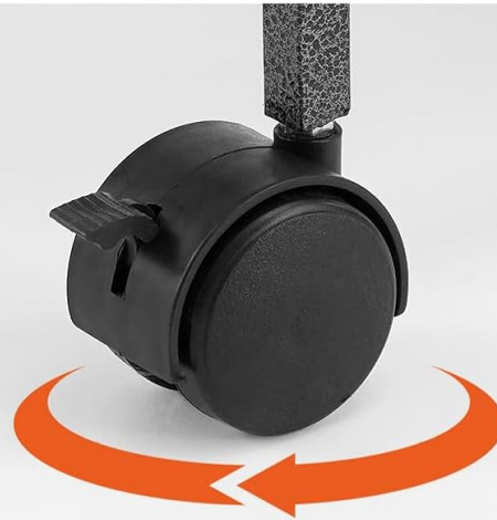
Figure 4: Pull-out tray and lockable caster wheels for easy cleaning and mobility.