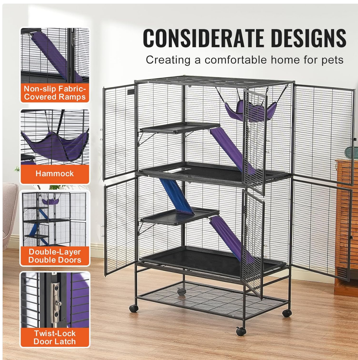
Figure 2: Cage with doors open, illustrating internal structure and accessories.