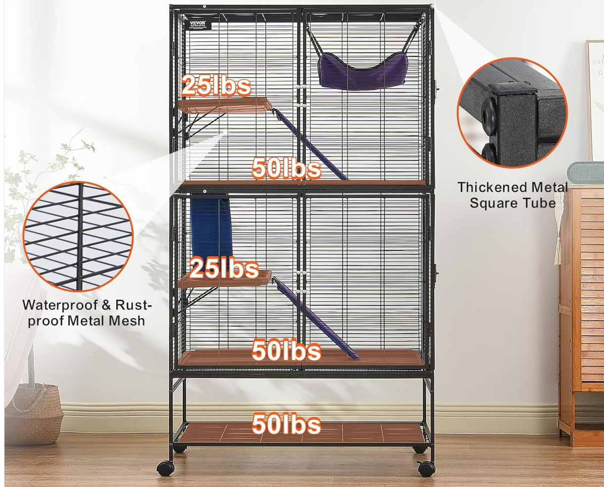
Figure 6: Solid metal construction details and load-bearing capacity.