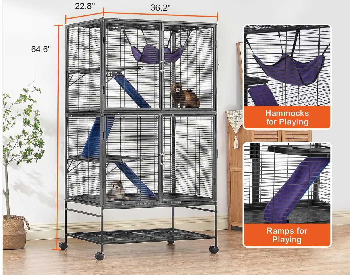
Figure 3: Overall view of the assembled cage with dimensions.

Comfortable living space for small animals