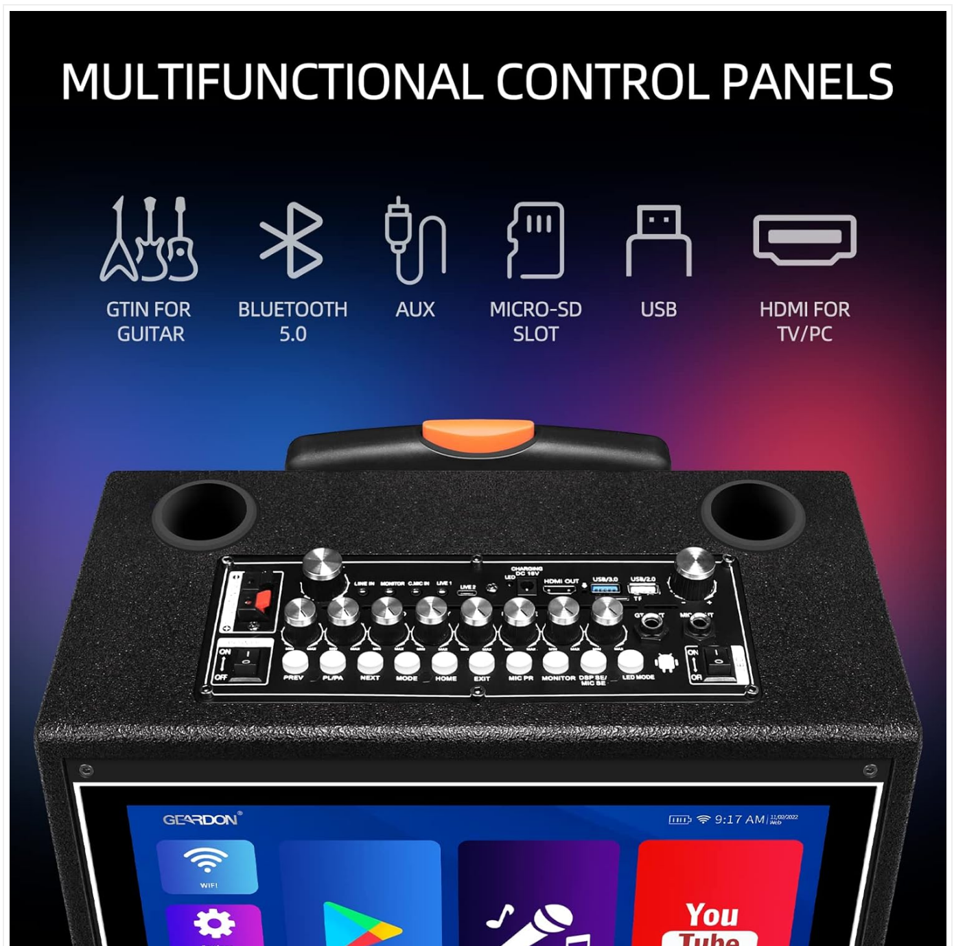
Image: The control panel located on the top of the karaoke machine, displaying various ports and knobs for adjusting sound and selecting