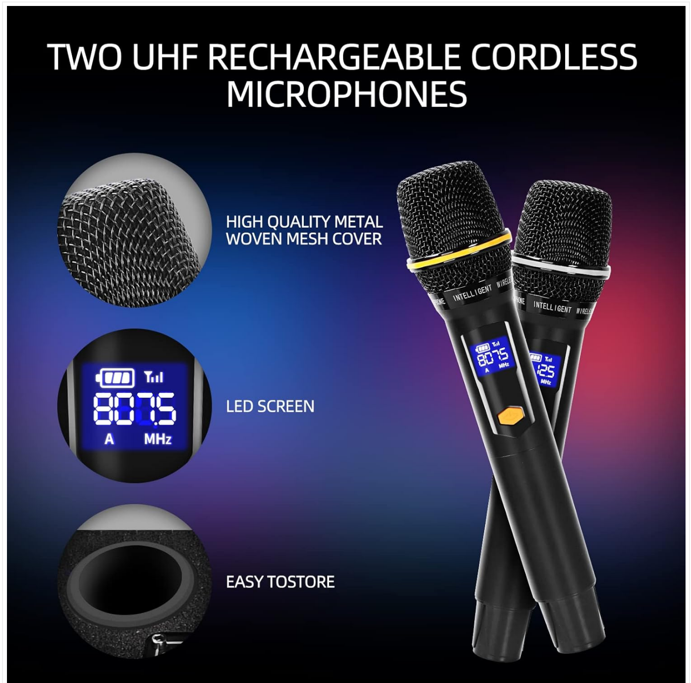
Image: A close-up of the two UHF rechargeable cordless microphones, highlighting their high-quality metal woven mesh cover, integrated LED screen for status display, and design for easy storage.

The two included UHF rechargeable microphones are designed for clear vocal pickup. For optimal sound, speak directly into the top of the microphone. Ensure microphones are charged for uninterrupted use. Each microphone features an LED screen displaying frequency and battery status.