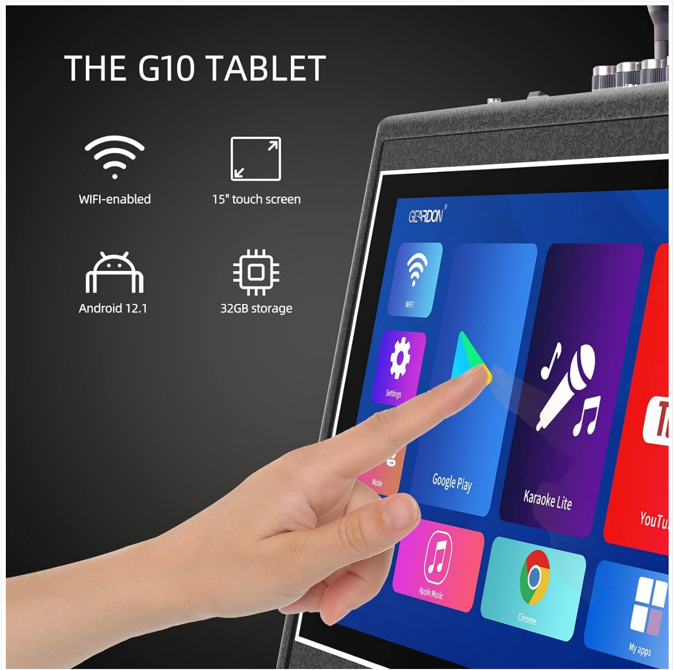
Image: A detailed view of the G10 tablet interface, highlighting its key features: Wi-Fi connectivity, 15-inch touch screen, Android 12.1 operating system, and 32GB of internal storage.