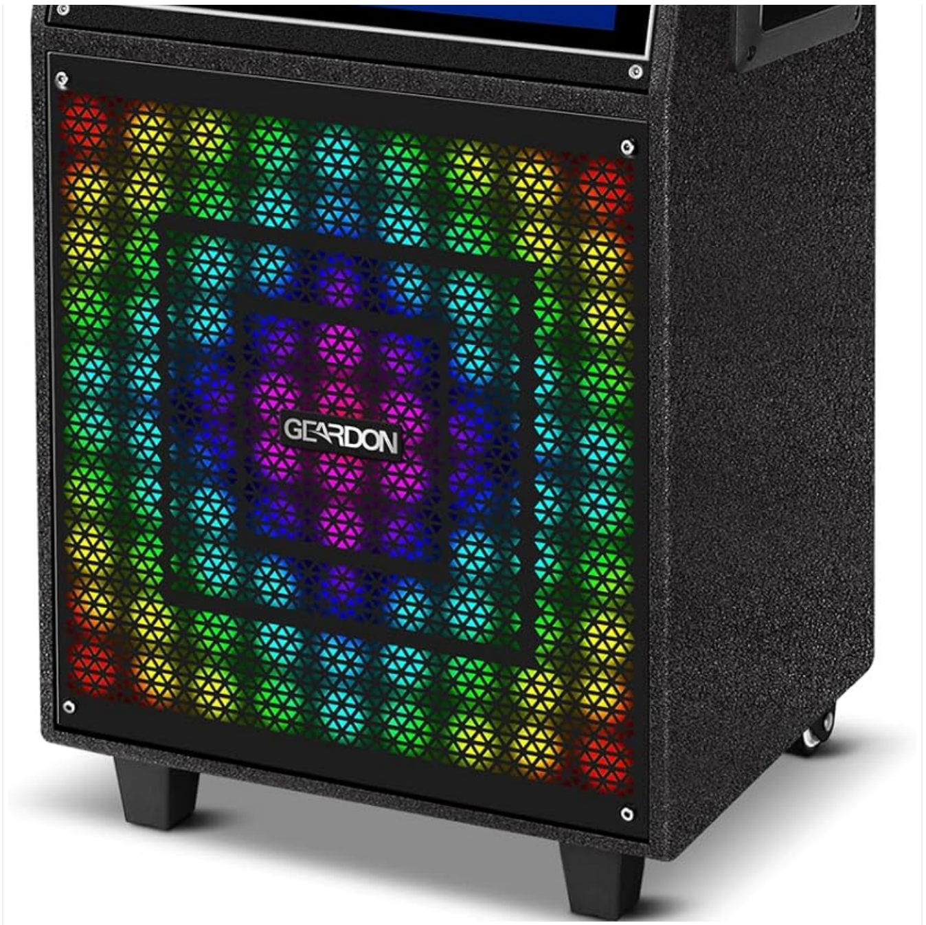
Image: The GEARDON Karaoke Machine, featuring a 15-inch touchscreen tablet, dual microphone holders, and a vibrant LED light display on the front speaker grille. The machine is black with a retractable handle and wheels for portability.