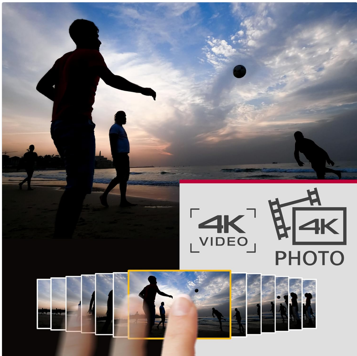
Figure 5: Demonstrates the ability to capture 4K video and extract high-resolution 4K Photo stills from the footage.