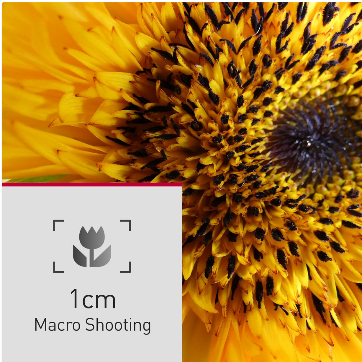
Figure 6: An example of 1cm macro shooting, showcasing the camera's ability to capture fine details.