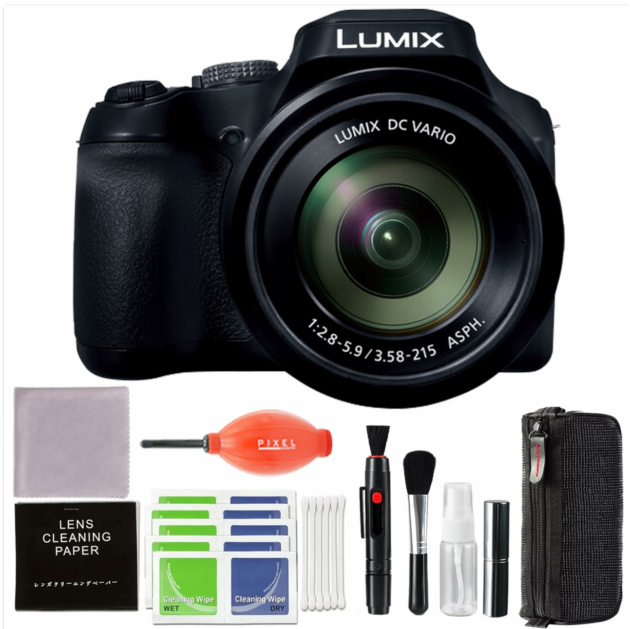
Figure 1: Front view of the Panasonic Lumix FZ80D Digital Camera. This image shows the camera's lens, flash, and grip.