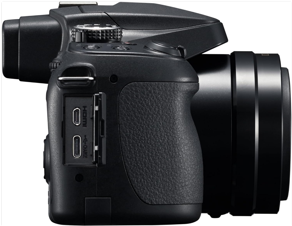
Figure 2: Side view of the camera, highlighting the USB and HDMI ports for connectivity and charging.