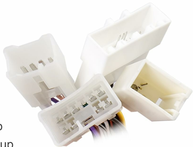
Figure 1: Compatible Toyota Models and Years.