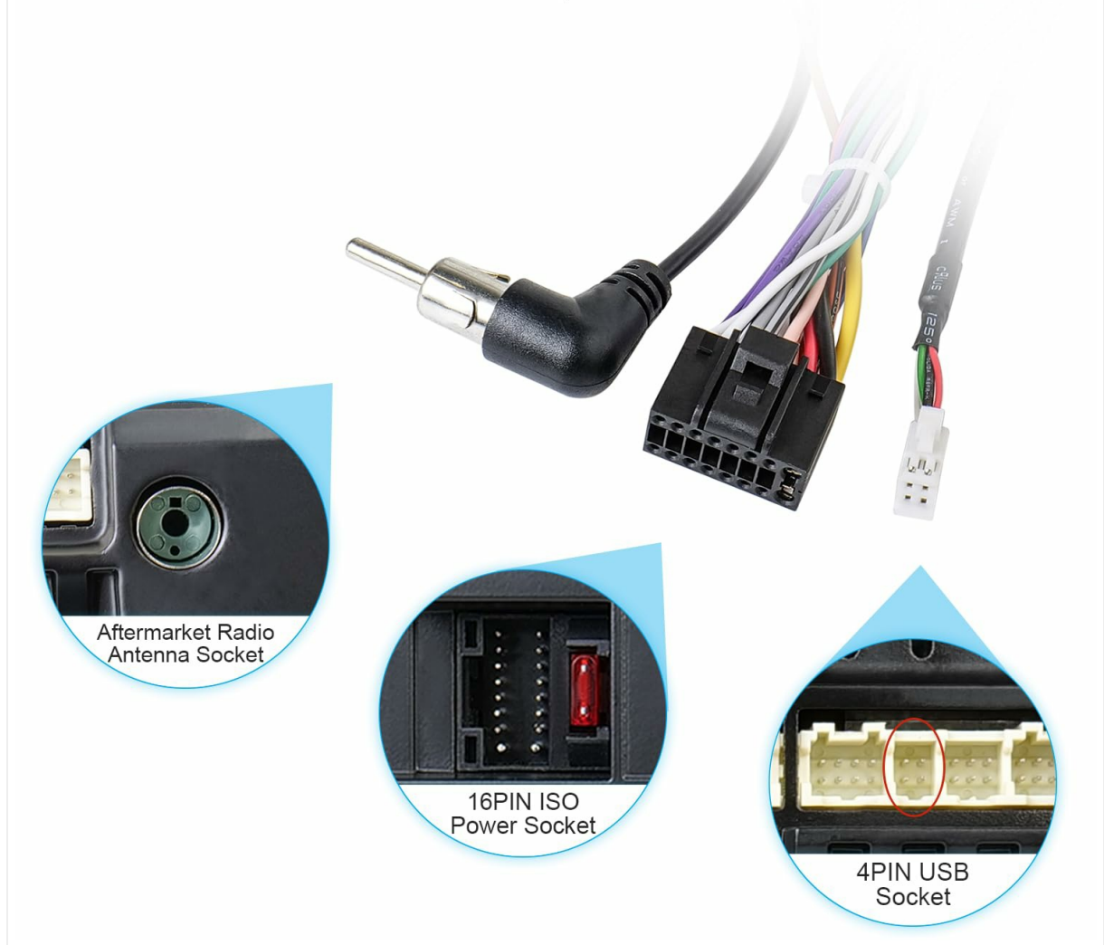
Figure 4: 16PIN Radio Wiring Harness Adapter connections.