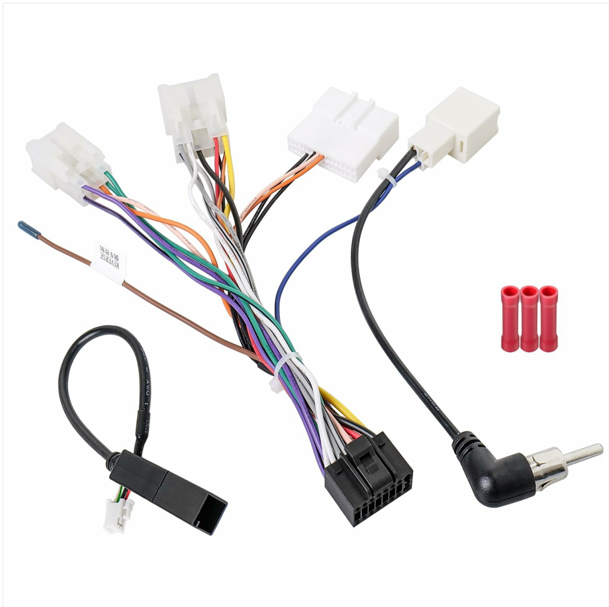
Figure 2: Complete package contents of the wiring harness kit.