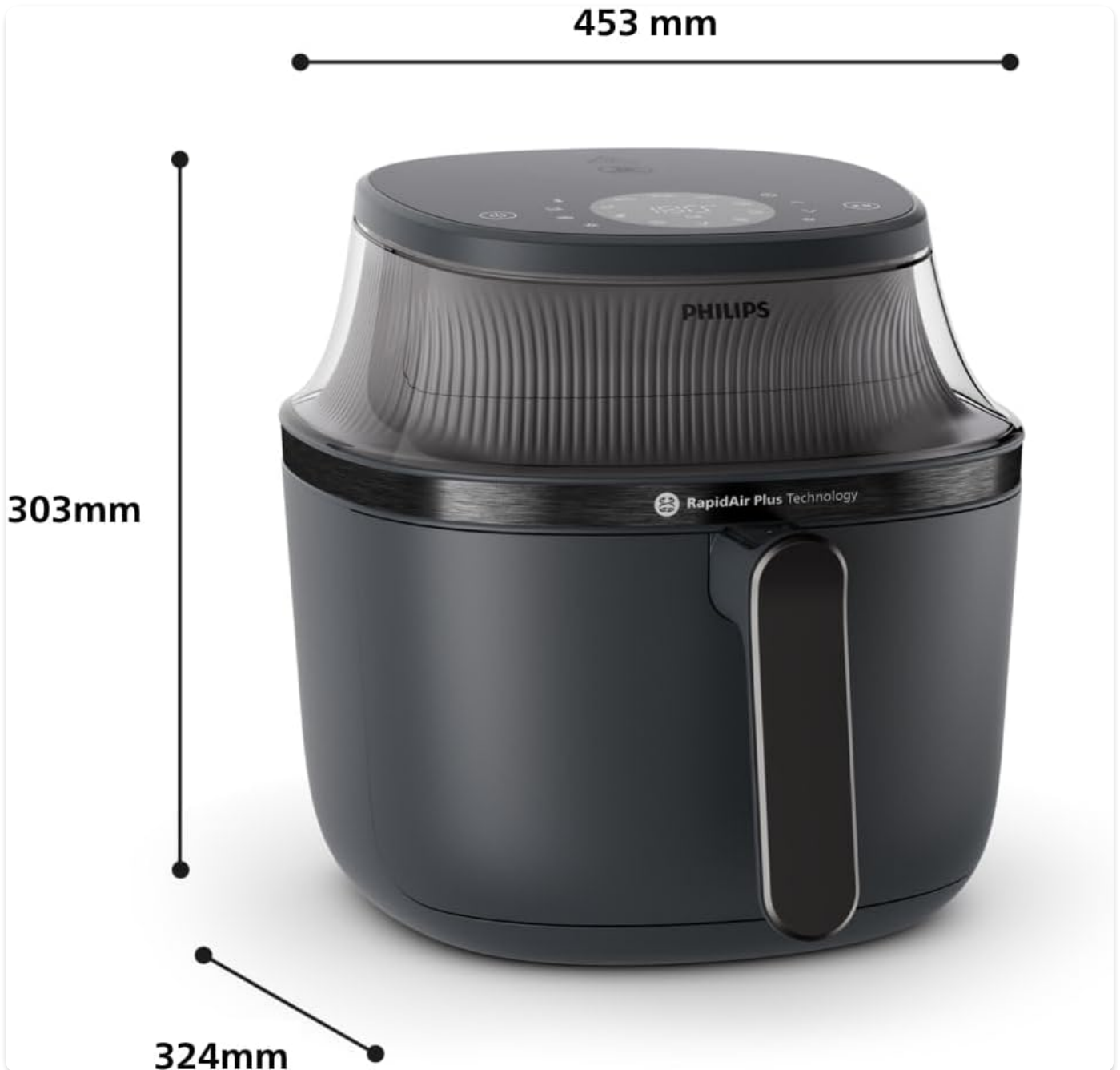
Key dimensions of the Philips Airfryer Series 3000.