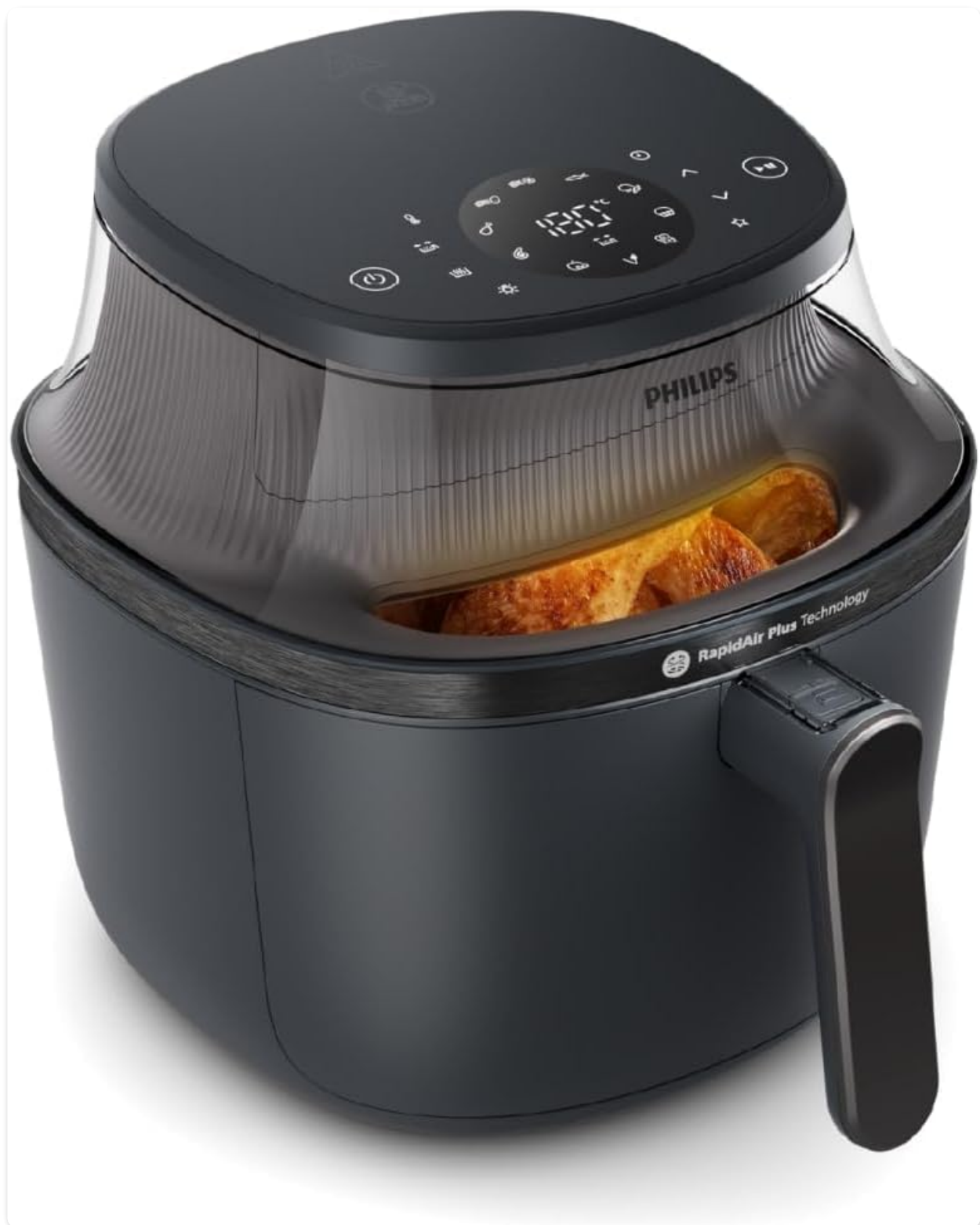
The Philips Airfryer Series 3000, showcasing its sleek design and cooking window.