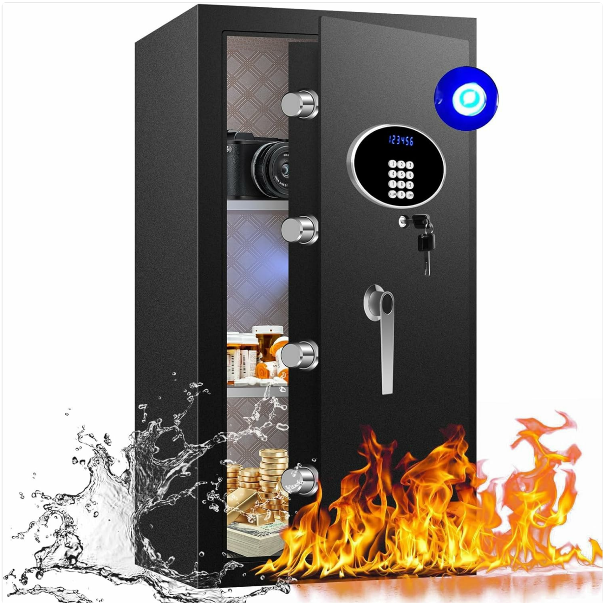
Image: The ToruKeep DLA80 safe, highlighting its fireproof and waterproof capabilities with visual effects of water splashing and flames. The image also shows a diagram of the safe's multi-layer construction for protection.