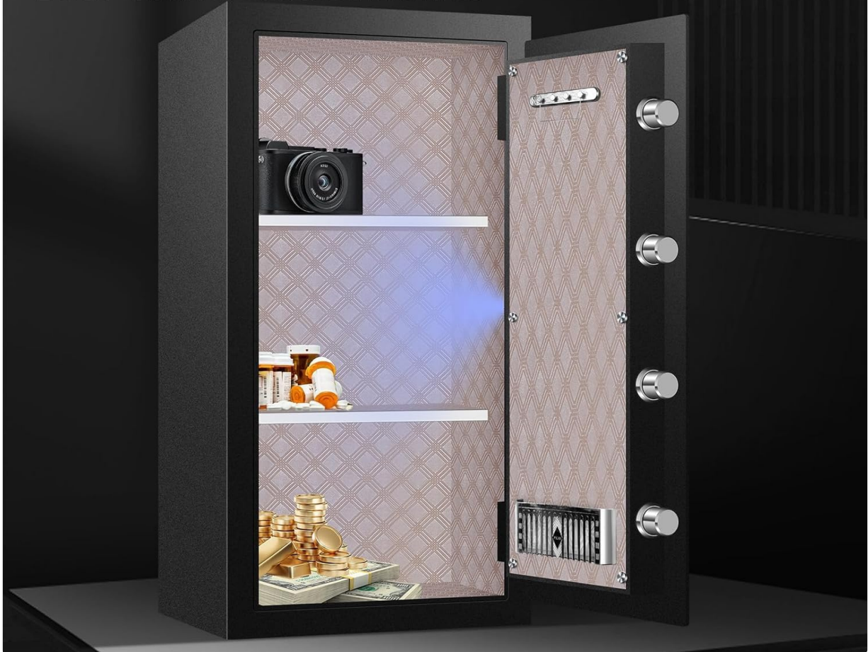
Image: The interior of the ToruKeep DLA80 safe with the internal light activated, illuminating items such as a camera, medication, and coins on the shelves.

EASILY ACCESS YOUR ITEMS, EVEN IN LOW-LIGHT CONDITIONS.