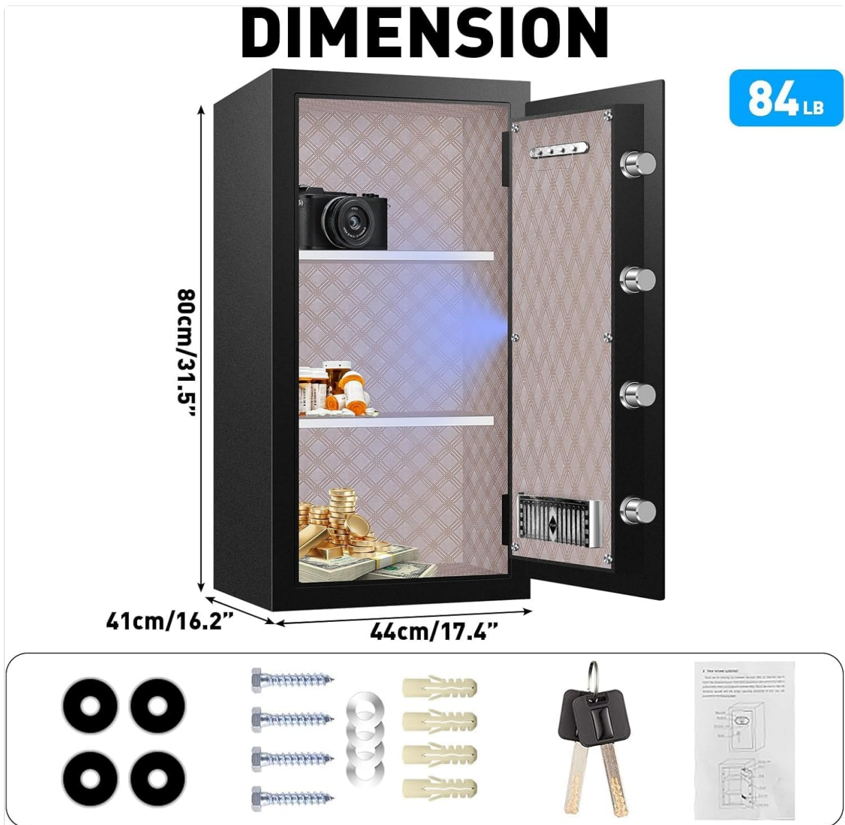
Image: The ToruKeep DLA80 safe with its dimensions (80cm/31.5" height, 41cm/16.2" depth, 44cm/17.4" width) and a display of included accessories: four expansion screws, four washers, and two emergency keys.