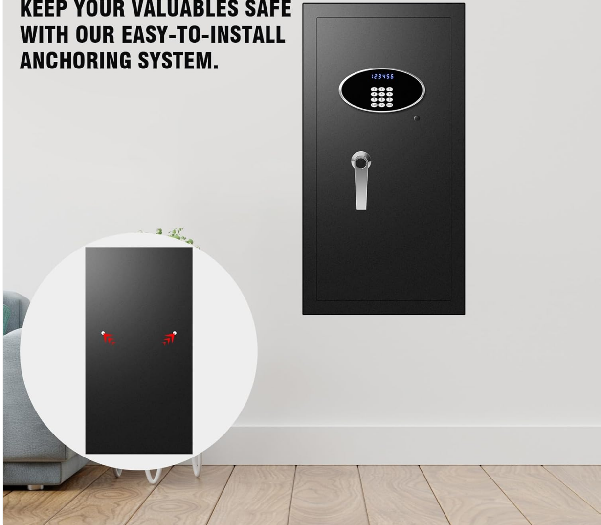
Image: The ToruKeep DLA80 safe securely mounted to a wall, illustrating the anchoring process with a close-up of the mounting points.

KEEP YOUR VALUABLES SAFE WITH OUR EASY-TO-INSTALL ANCHORING SYSTEM.