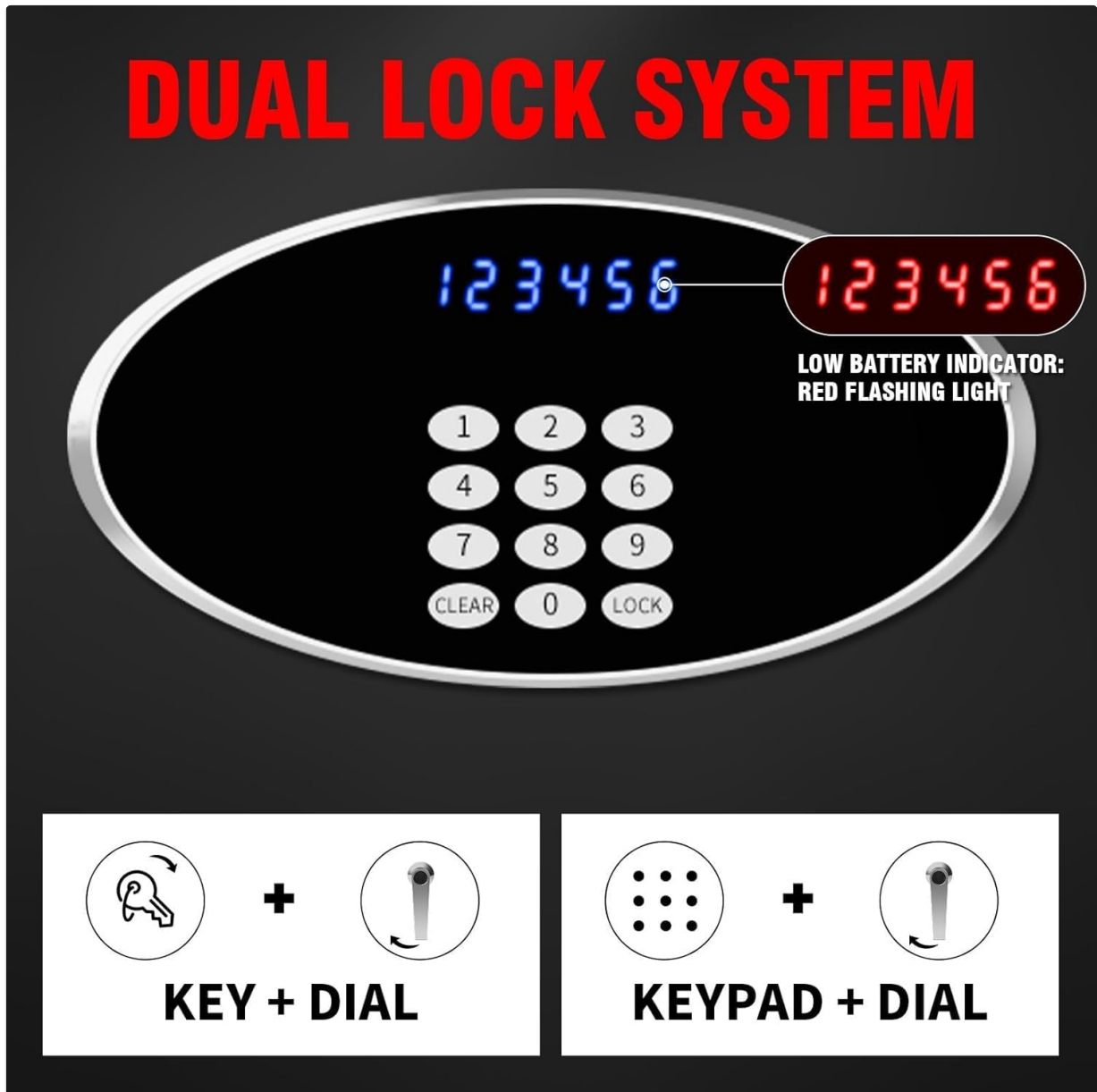
Image: A close-up of the ToruKeep DLA80 safe's digital keypad, illustrating the "DUAL LOCK SYSTEM" with options for "KEY + DIAL" and "KEYPAD + DIAL" for opening. A low battery indicator (red flashing light) is also shown.