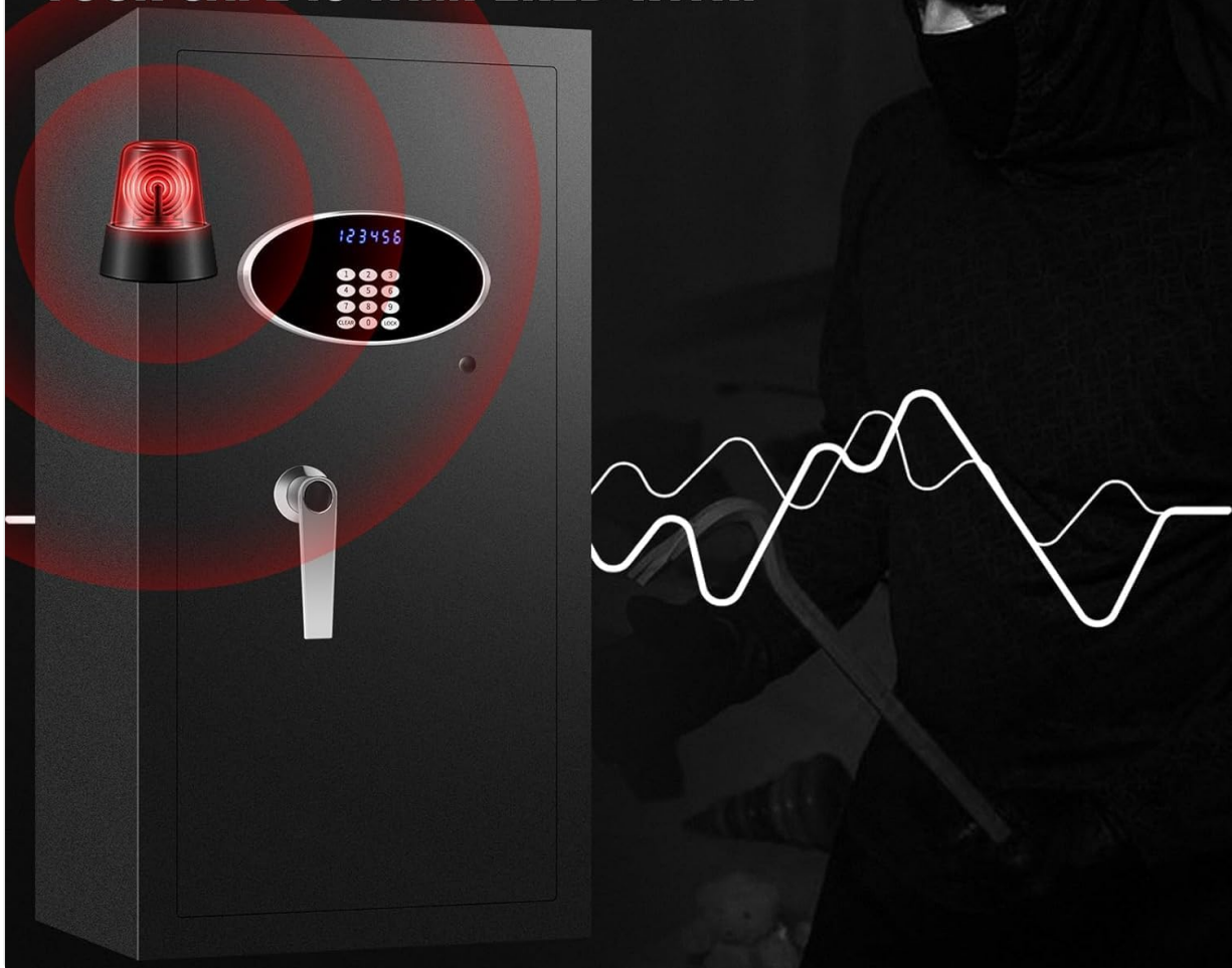
Image: The ToruKeep DLA80 safe with a red flashing alarm light and sound wave graphics, indicating the activation of the vibration alarm due to tampering.

STAY ALERT WITH IMMEDIATE NOTIFICATIONS IF YOUR SAFE IS TAMPERED WITH.