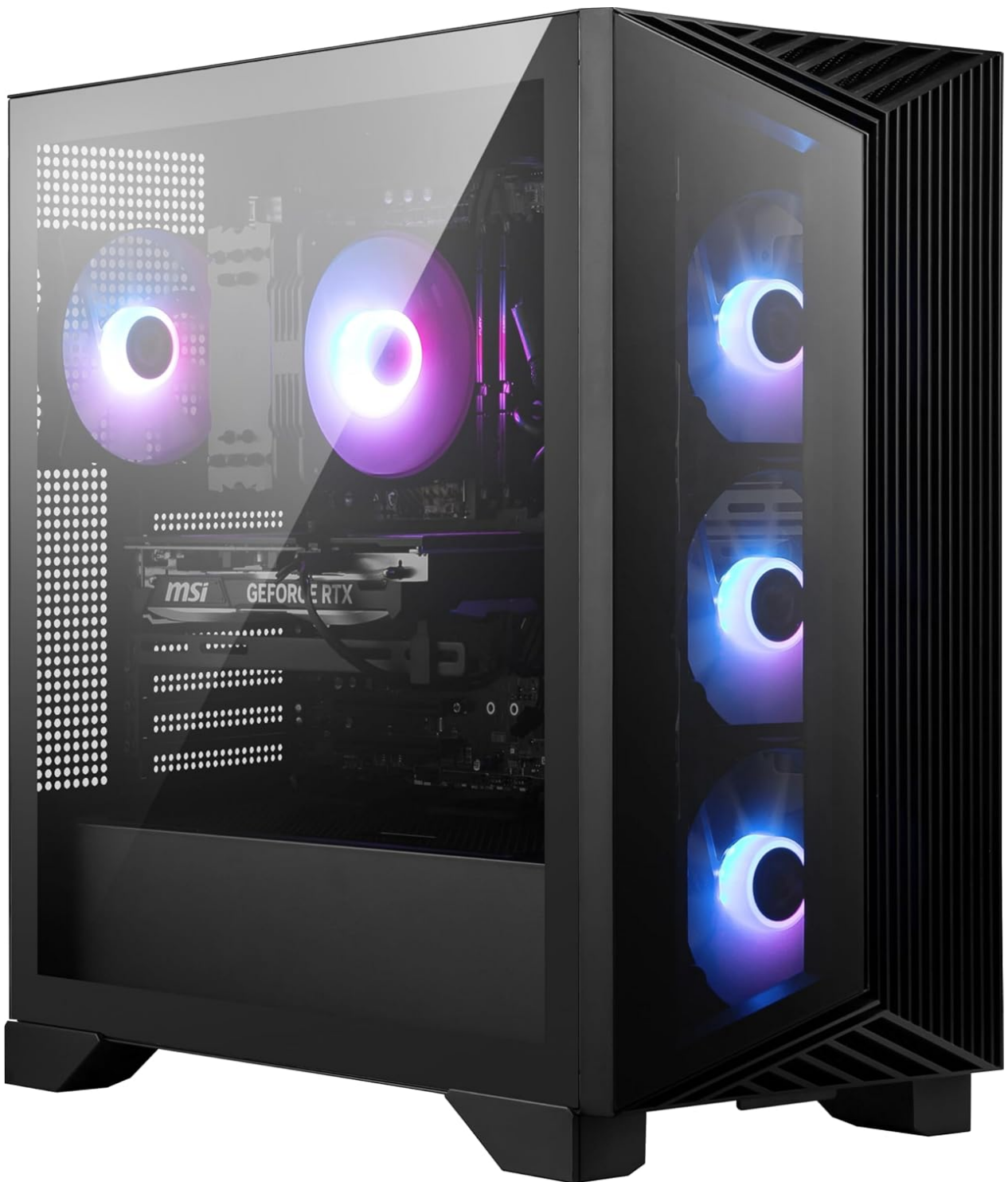
The MSI Aegis Z2 Gaming Desktop, showcasing its transparent side panel and internal RGB lighting.