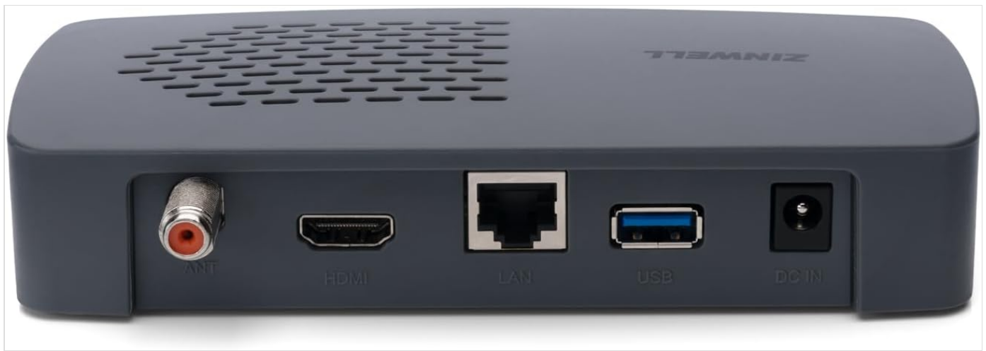
Image: Rear view of the Zinwell ZAT-600B NextGen TV Box, highlighting the various connection ports including ANT (antenna), HDMI, LAN, USB, and DC IN.