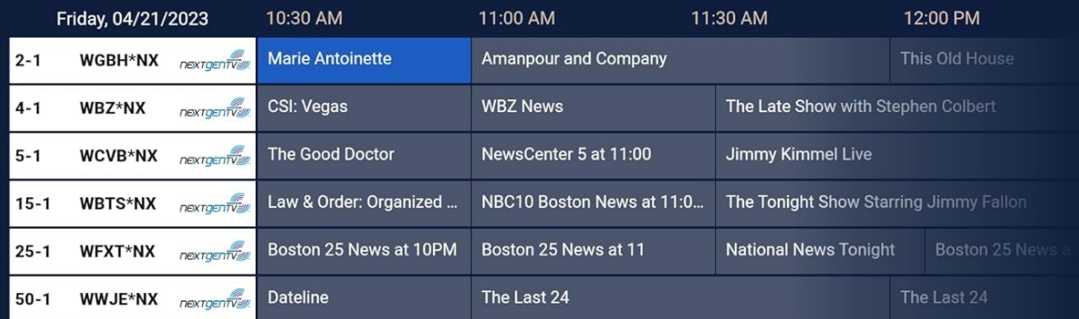
Image: A screenshot of the Electronic Program Guide (EPG) displayed on a television screen, showing channel listings, program titles, and broadcast times.

Marie Antoinette plans a big inauguration ball that makes her the center of attention, and she hopes to convince Louis to choose the pro-Austrian candidate that she defends as prime minister; Louis' wounded pride makes him angry.