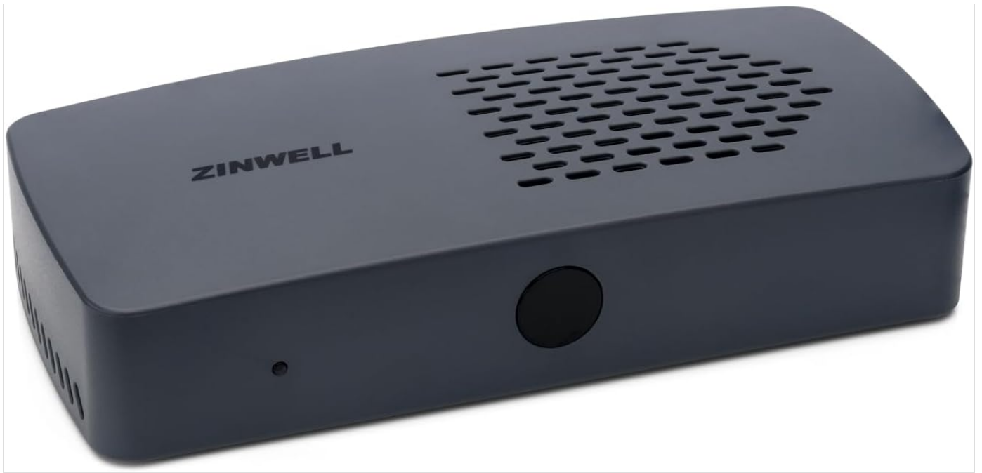
Image: Front view of the Zinwell ZAT-600B NextGen TV Box. This image displays the compact, gray rectangular device with the "ZINWELL" logo on top and a small indicator light on the front.