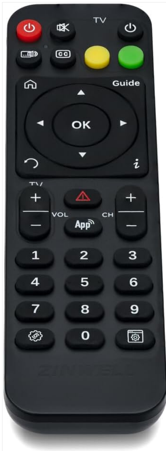
Image: The universal learning remote control included with the ZAT-600B. The remote is black with various buttons for power, channel, volume, navigation, and app access.