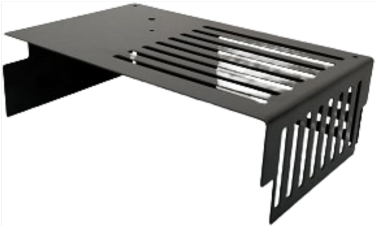
Figure 1: Front view of the LCB Cover 0000092839. This black plastic component features a slotted design for ventilation.