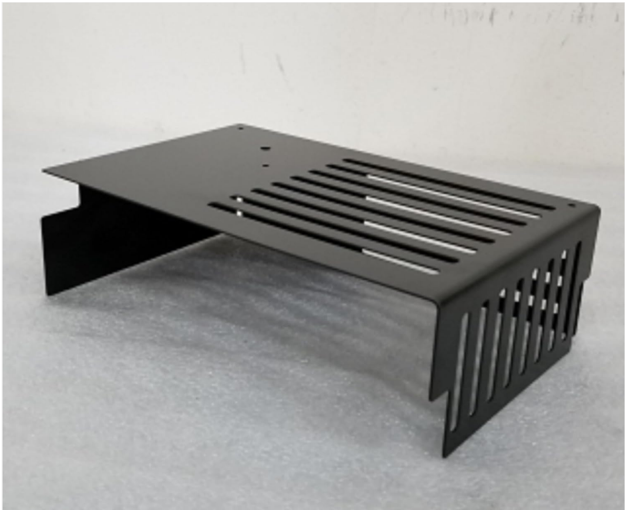
Figure 2: Angled view of the LCB Cover 0000092839, showing its L-shaped structure and ventilation slots.