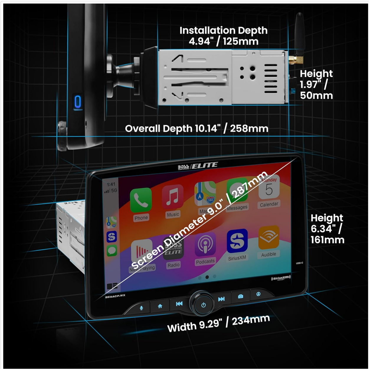
Image: Detailed diagram illustrating the width, height, screen diameter, and installation depth of the BE9ACP.WX unit.