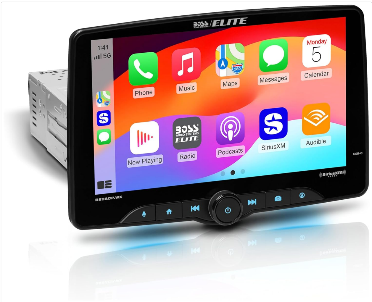
Image: The main unit showcasing its 9-inch touchscreen with the Apple CarPlay interface active, displaying various app icons.