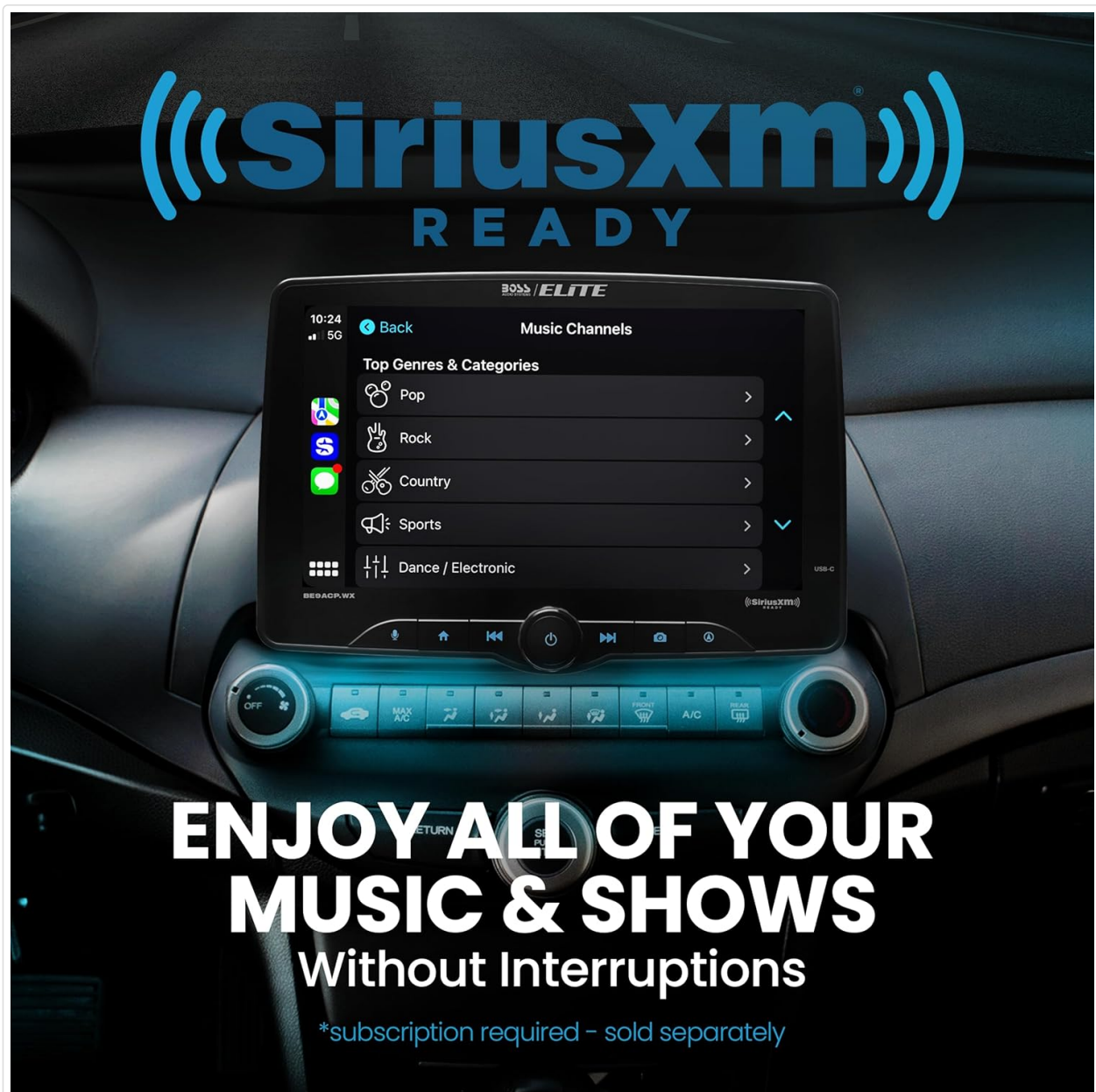
Image: Graphic displaying the SiriusXM interface on the unit's screen, showing various music genres and channels available.