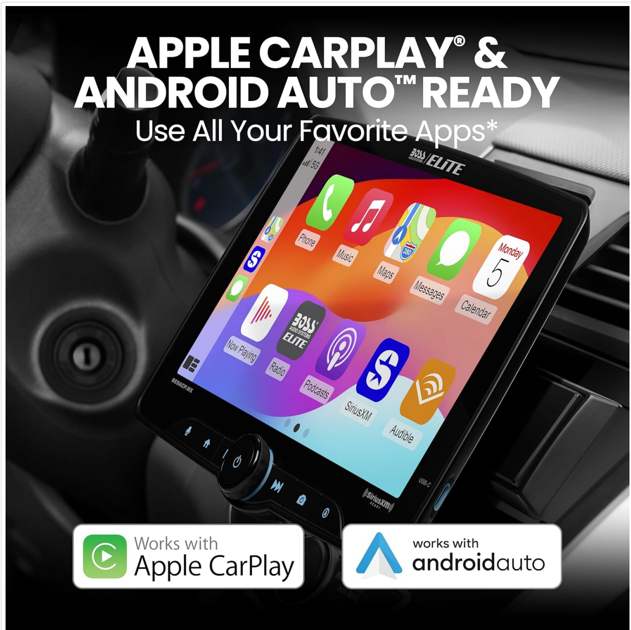
Image: Promotional graphic highlighting the unit's compatibility with Apple CarPlay and Android Auto, showing app icons and logos.