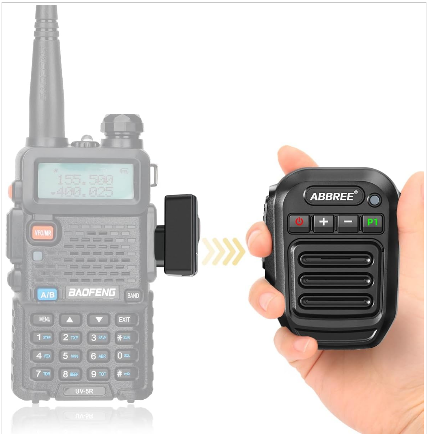
Figure 1: ABBREE Wireless Handheld Speaker Mic connected to a Baofeng UV-5R walkie-talkie.