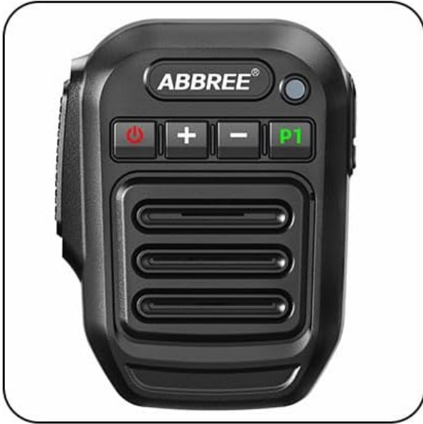
Wireless Handheld Microphone