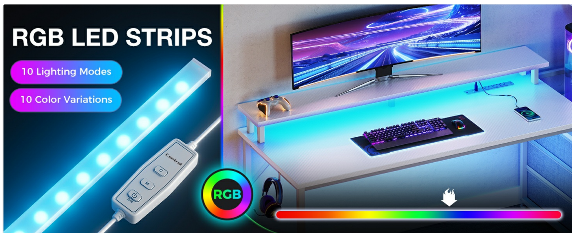
Image: Close-up of the LED light controller with buttons labeled C, M, and Power/Speed/Brightness.