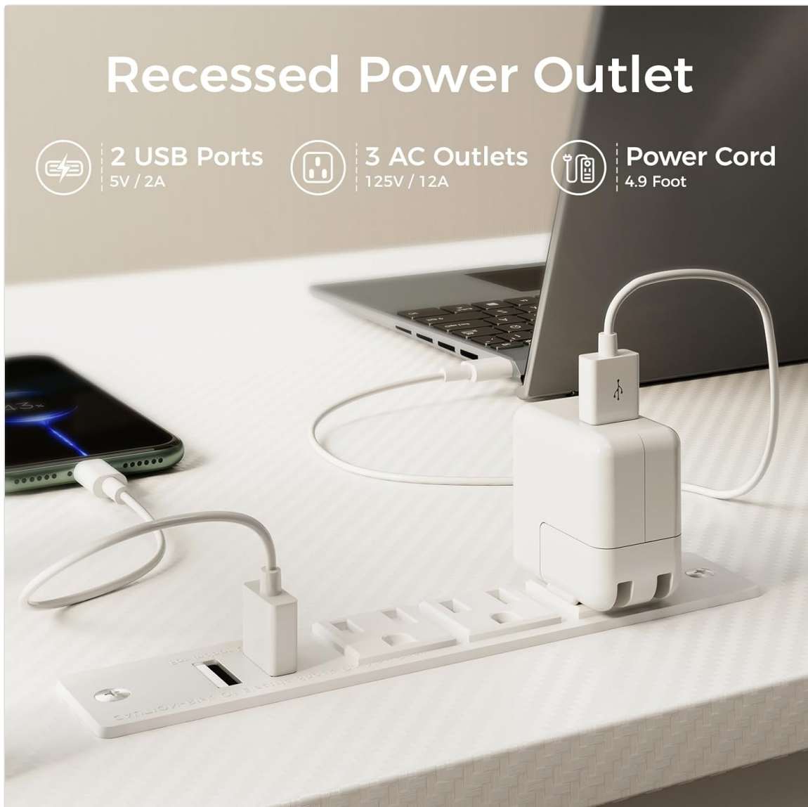
Image: Close-up of the recessed power outlet featuring three AC outlets and two USB ports.

The desk is equipped with 3 standard AC power outlets (125V/12A) and 2 USB charging ports (5V/2A). Simply plug the desk's main power cord into a wall outlet to activate these features. Use these to conveniently power and charge your electronic devices.