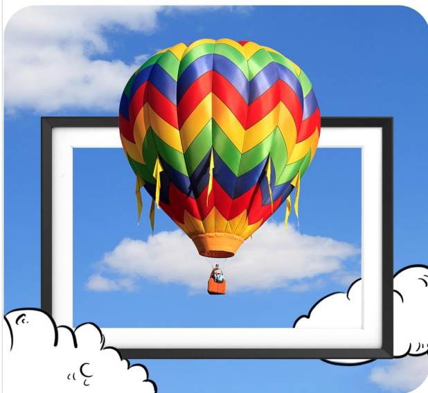
Figure 4: Incredible Color Display with 10.1 inch IPS Touchscreen.

10.1 inch IPS touchscreen, 1280x800 resolution