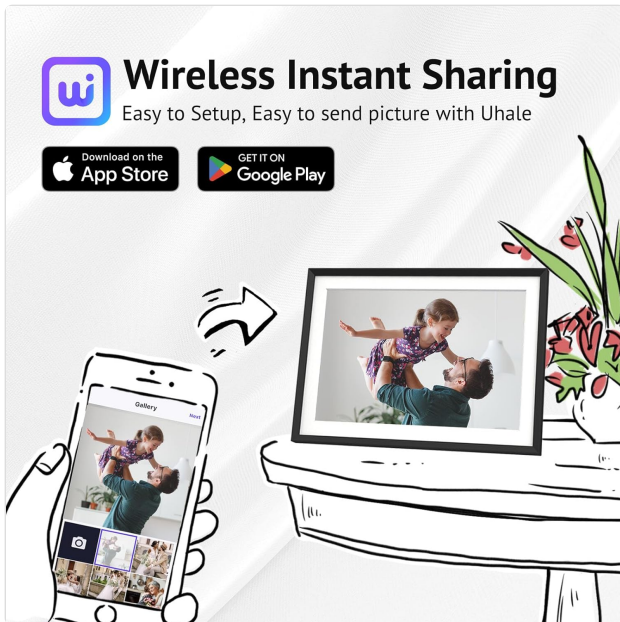
Figure 2: Wireless Instant Sharing via Uhale App.

This image illustrates the digital picture frame displaying a vibrant image of a dog swimming, alongside a smartphone showing the Uhale app's gallery view. This highlights the frame's display quality and the app's photo management capabilities.