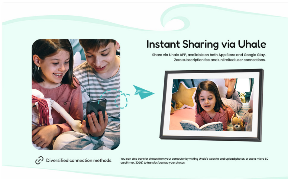
Figure 6: Instant Sharing of photos and videos from a smartphone to the frame via the Uhale app.

This image visually explains how to instantly share content. A smartphone user is shown selecting photos, which are then wirelessly transmitted to the digital picture frame, illustrating the ease of use.