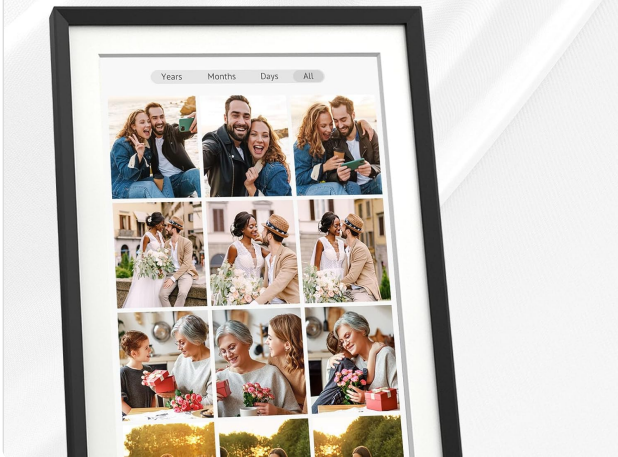
Figure 3: 32GB Built-in Memory and Micro SD Card Support.

Supports micro SD card, Unlimited User Connections