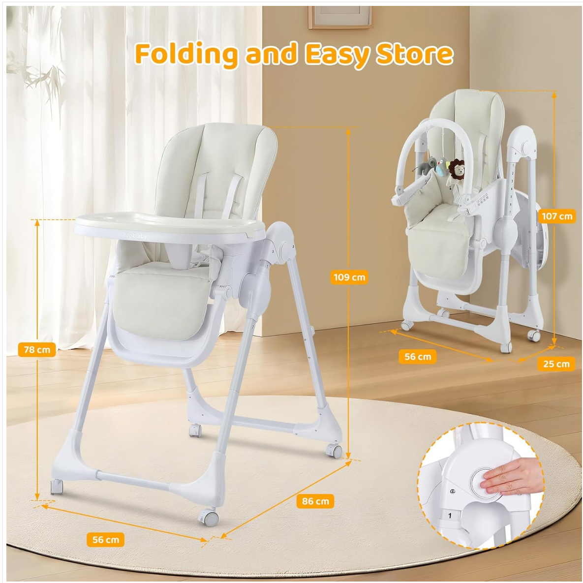
Figure 3.5: Folding and Easy Storage.