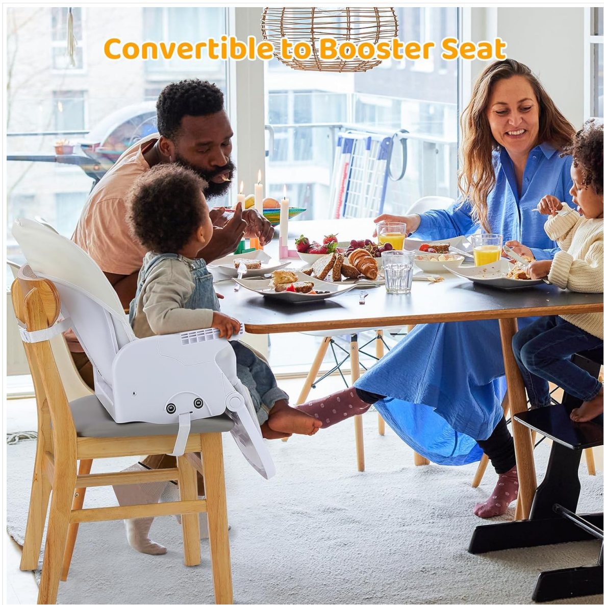
Figure 3.6: Convertible to Booster Seat.