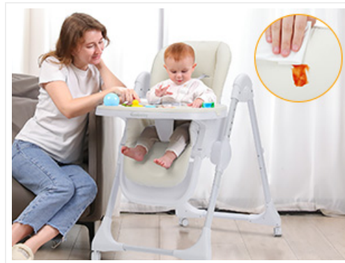
Figure 6.1: Easy Cleaning of the Tray.