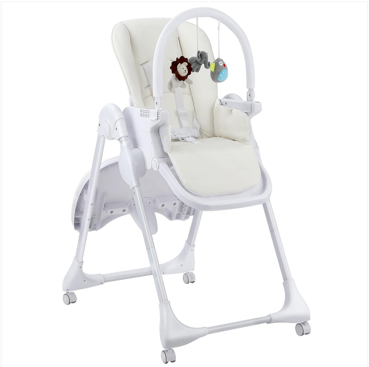
Figure 1.1: The Ezebaby 4-in-1 Baby High Chair, showcasing its design and included play bar.