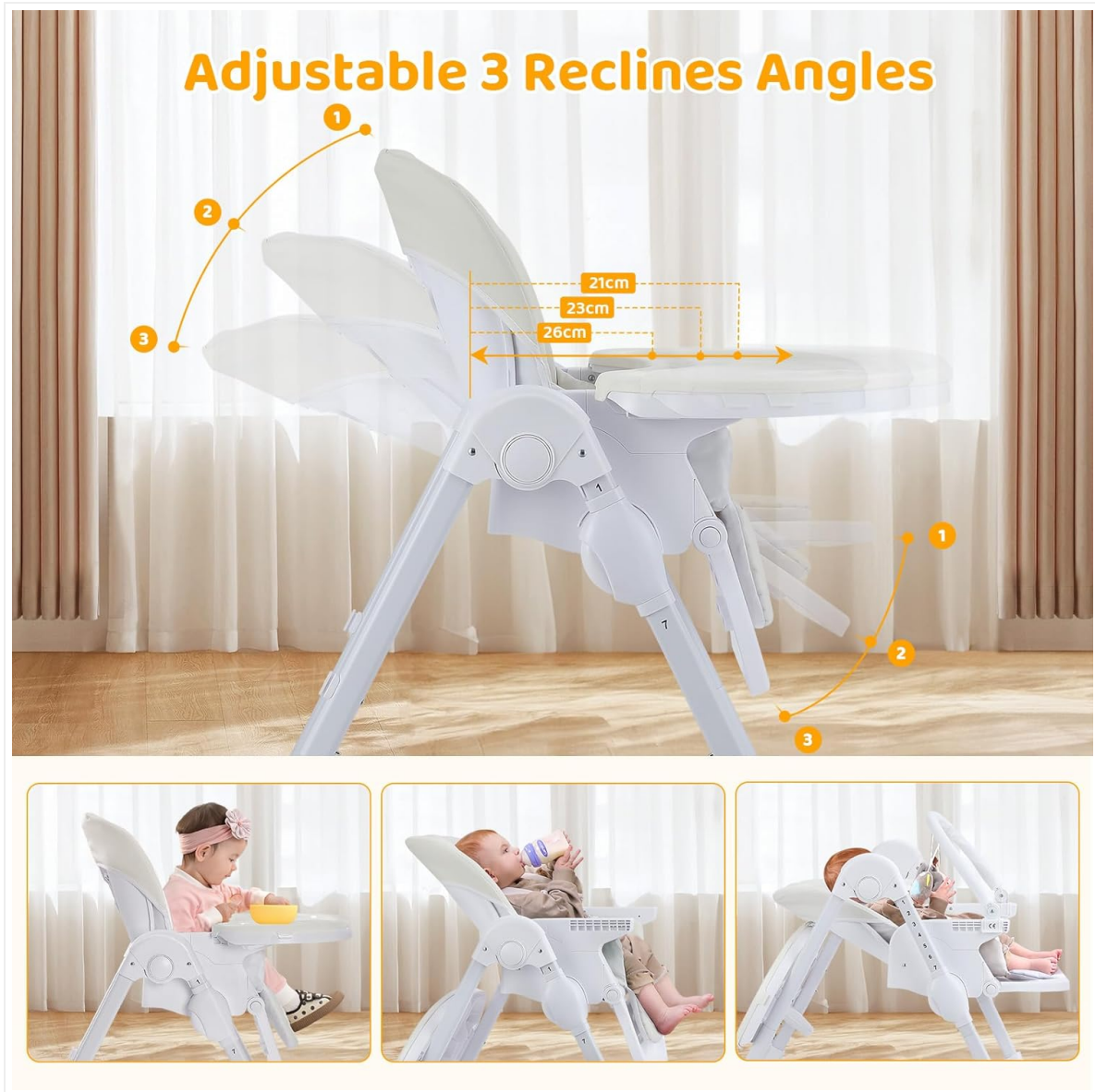
Figure 3.1: Adjustable 3 Recline Angles.