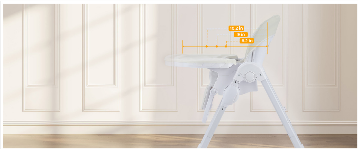
Figure 3.3: Double-Layer Tray Adjustment.