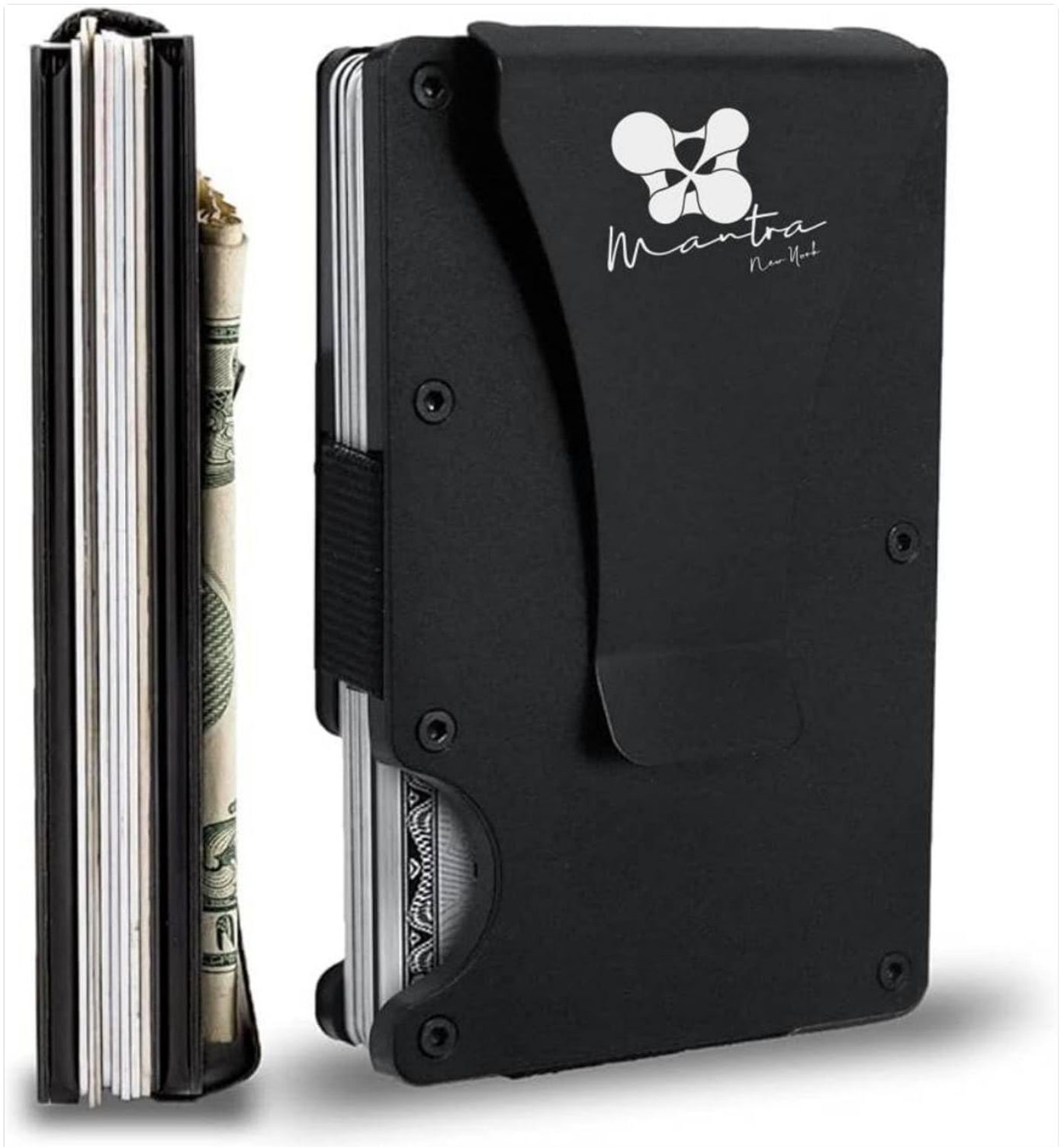
Image 1.1: Front view of the Mantra Slim Metal Minimalist Wallet, showcasing its sleek design and integrated money clip.