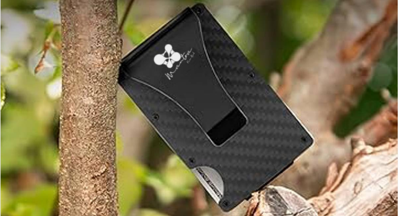
Image 5.1: The Mantra wallet shown in an outdoor setting, emphasizing its durable and scratch-resistant qualities.

Durable, Scratch-resistant, Long-lasting