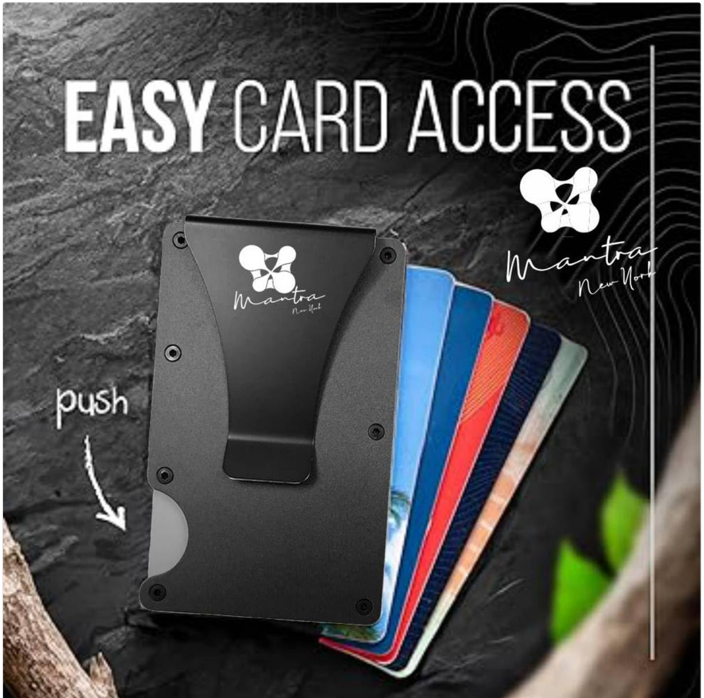
Image 4.1: Illustration of the easy card access mechanism, showing how to push cards out for retrieval.

3. To access cards, push the cards out from the opposite side using your thumb or finger.