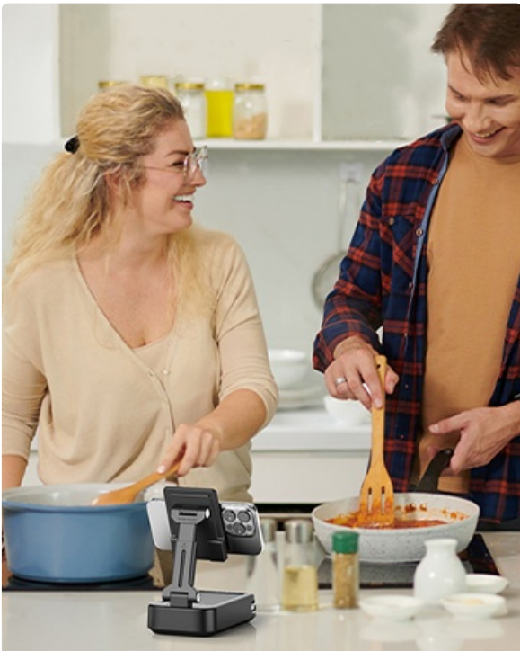
Image: The Joymate L40 phone stand demonstrating its foldable design, adjustable height, and angle capabilities for comfortable viewing.