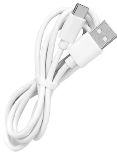
Type-c data cable (Wall charger not included) x1