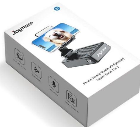
Packing Box x1

Image: The Joymate L40 device with its key dimensions (length, width, height) clearly labeled.