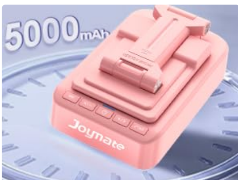
Image: A close-up of the Joymate L40 device highlighting the 5000mAh battery capacity and its indicator lights.