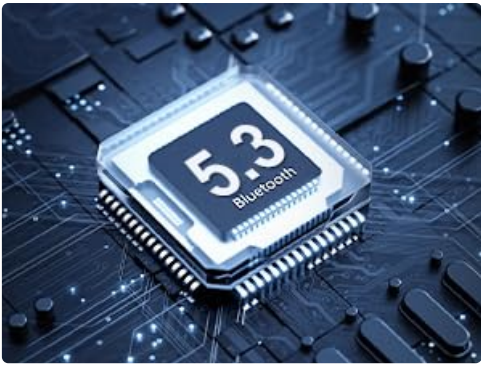
Image: A visual representation of the Bluetooth 5.3 chip, emphasizing stable and strong wireless connectivity.

Your browser does not support the video tag.