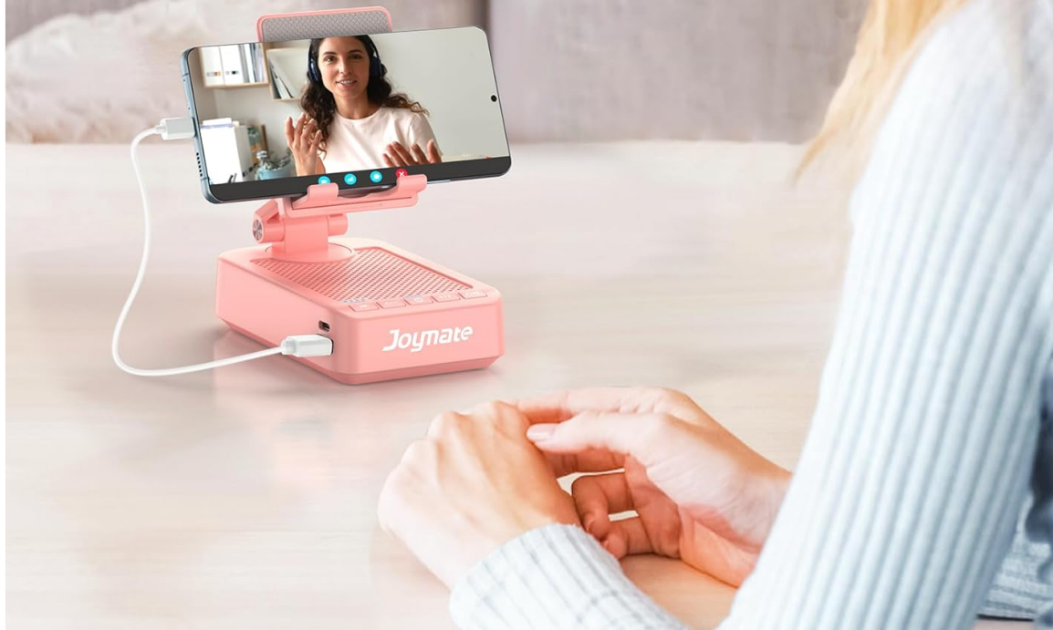
Image: A pink Joymate L40 Phone Stand with Bluetooth Speaker and Charging Function, showcasing its compact design.