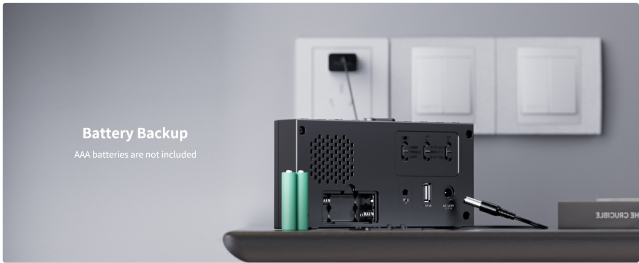
Image: The battery backup feature ensures your settings are saved during power interruptions.