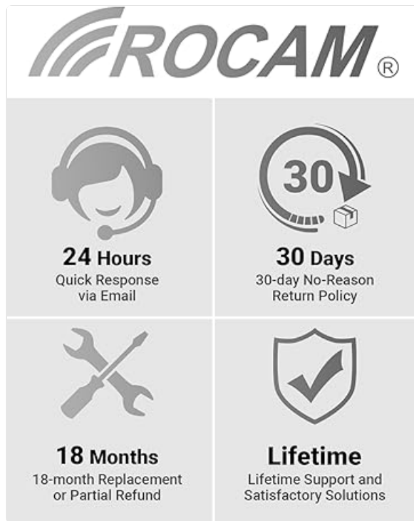
Image: ROCAM's commitment to customer satisfaction and product support.