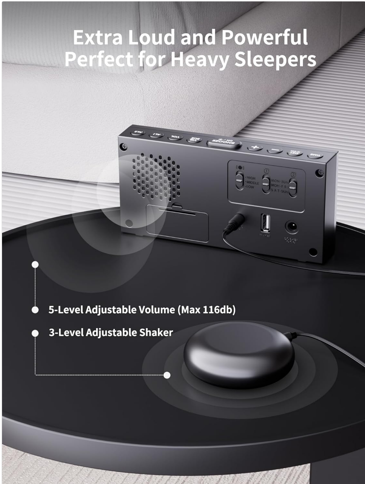
Image: Customize the alarm's loudness and bed shaker intensity to suit your needs.

The alarm clock features 5 adjustable volume levels (up to 116dB) and 3 vibration levels for the bed shaker.