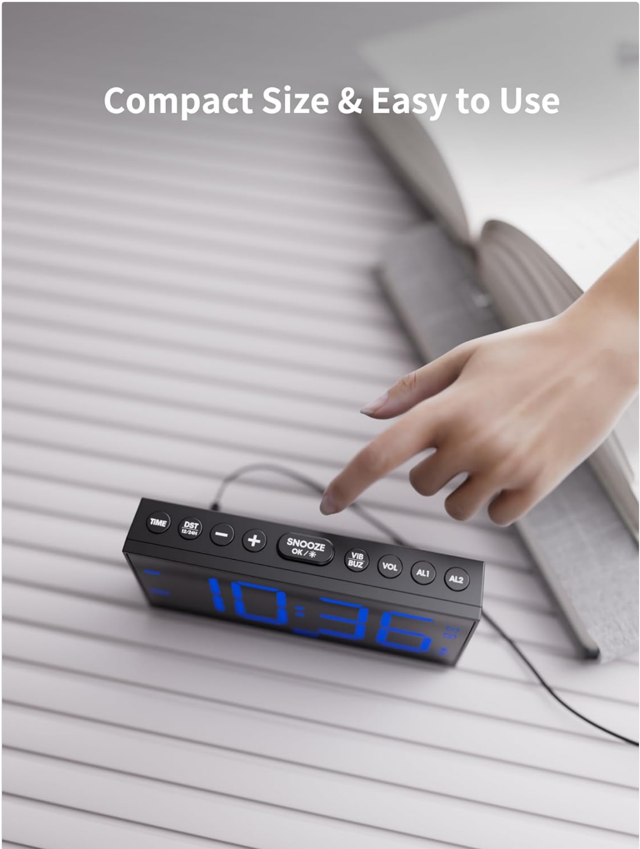
Image: The easily accessible snooze button provides an extra 9 minutes of rest.