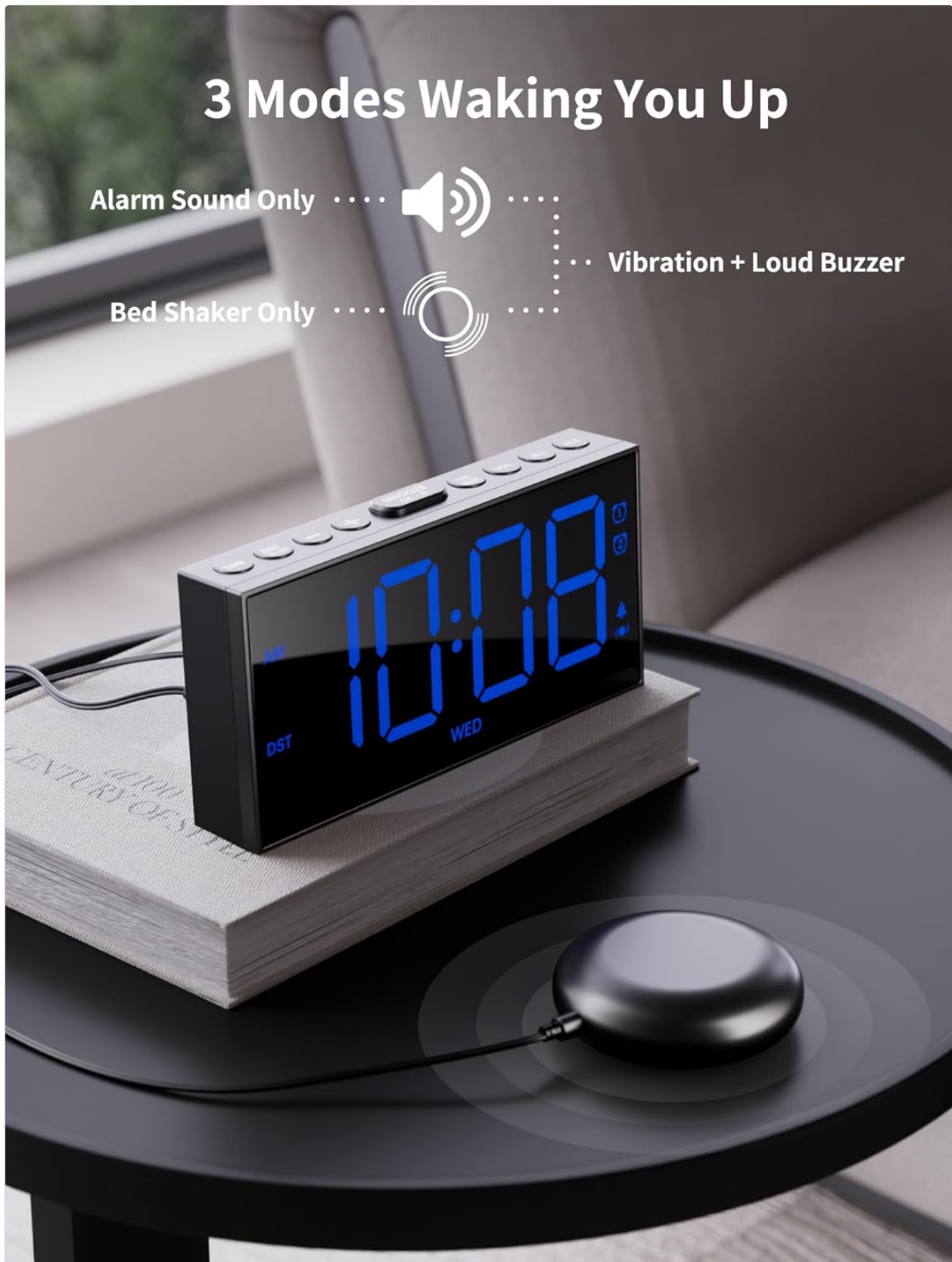
Image: Select your preferred wake-up method from three available modes.