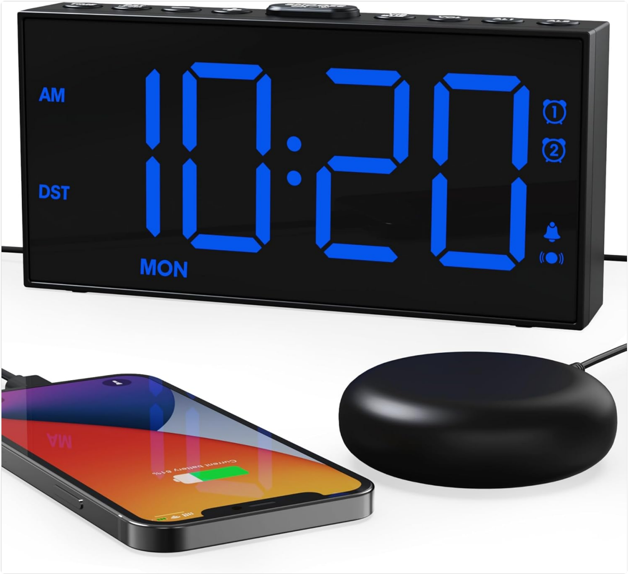
Image: Conveniently charge your mobile devices directly from the alarm clock.

The alarm clock includes two USB ports for charging your phone or tablet.