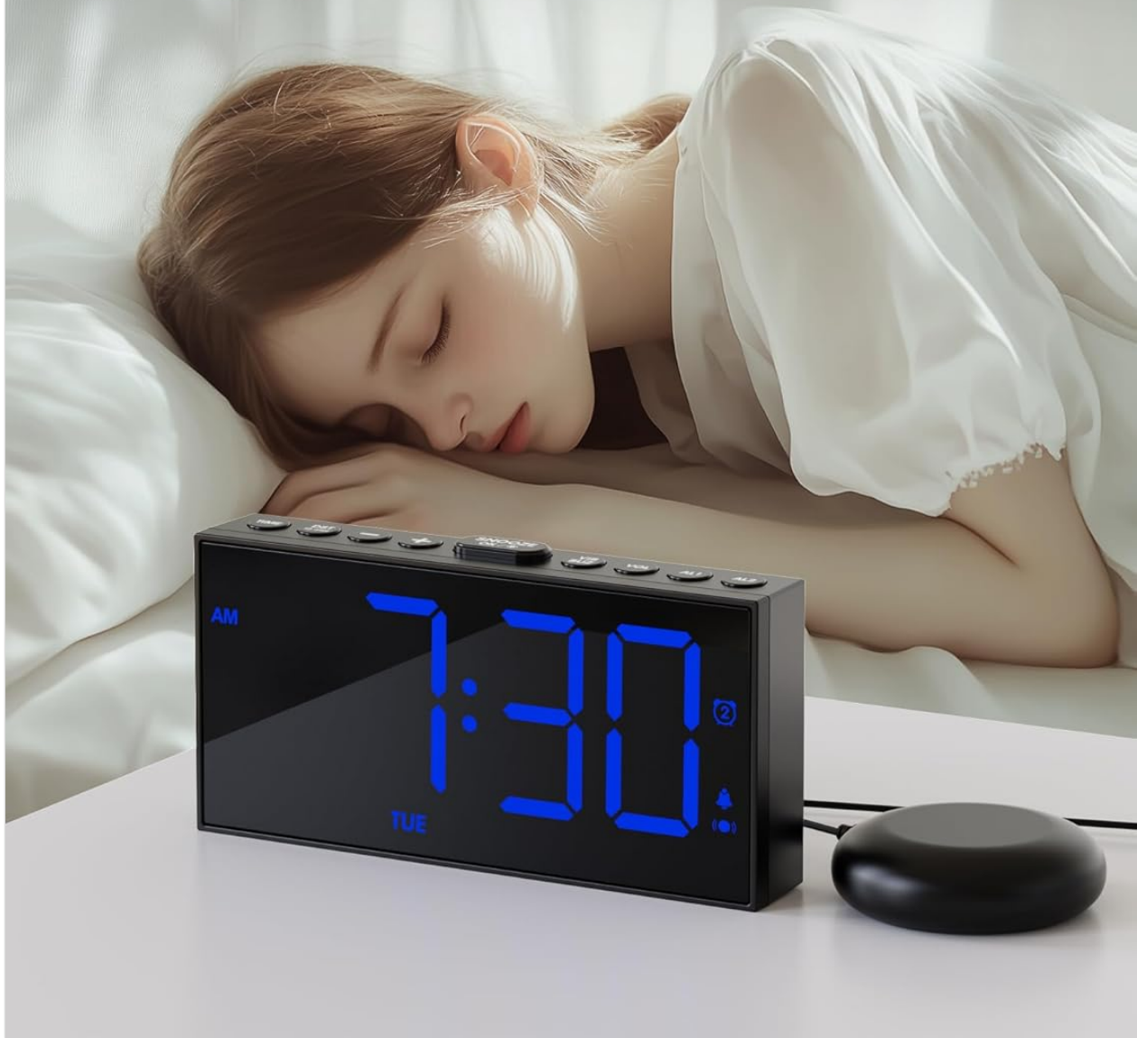
Image: Set two separate alarms with options for everyday, weekday, or weekend wake-up.