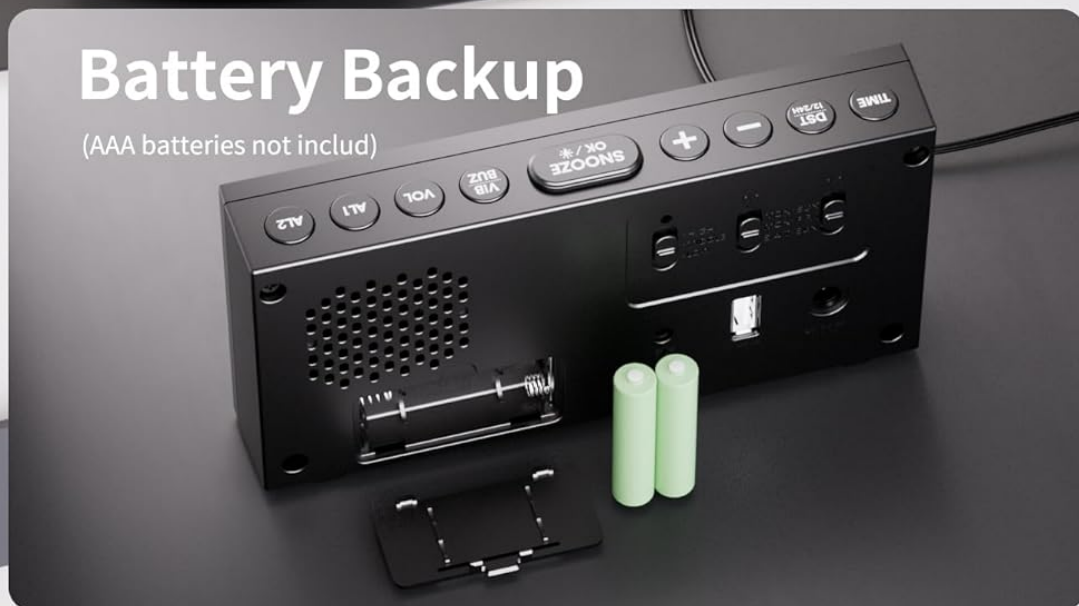
Image: The alarm clock requires AC power for operation. It also features a USB port for charging external devices.