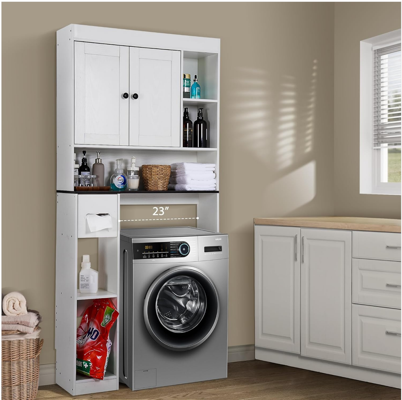
Image 4.3: The cabinet's versatile design allows it to be used effectively in laundry rooms, providing storage over appliances.