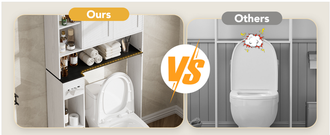
Image 3.2: This cabinet is designed to fit over most standard toilets, providing ample clearance.