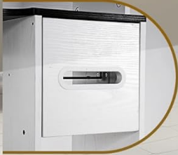
Image 4.1: Key features of the cabinet, highlighting the barn doors, adjustable shelves, magnetic door closure, and convenient tissue hook.

The tissue hook design increases the use of space and convenience.