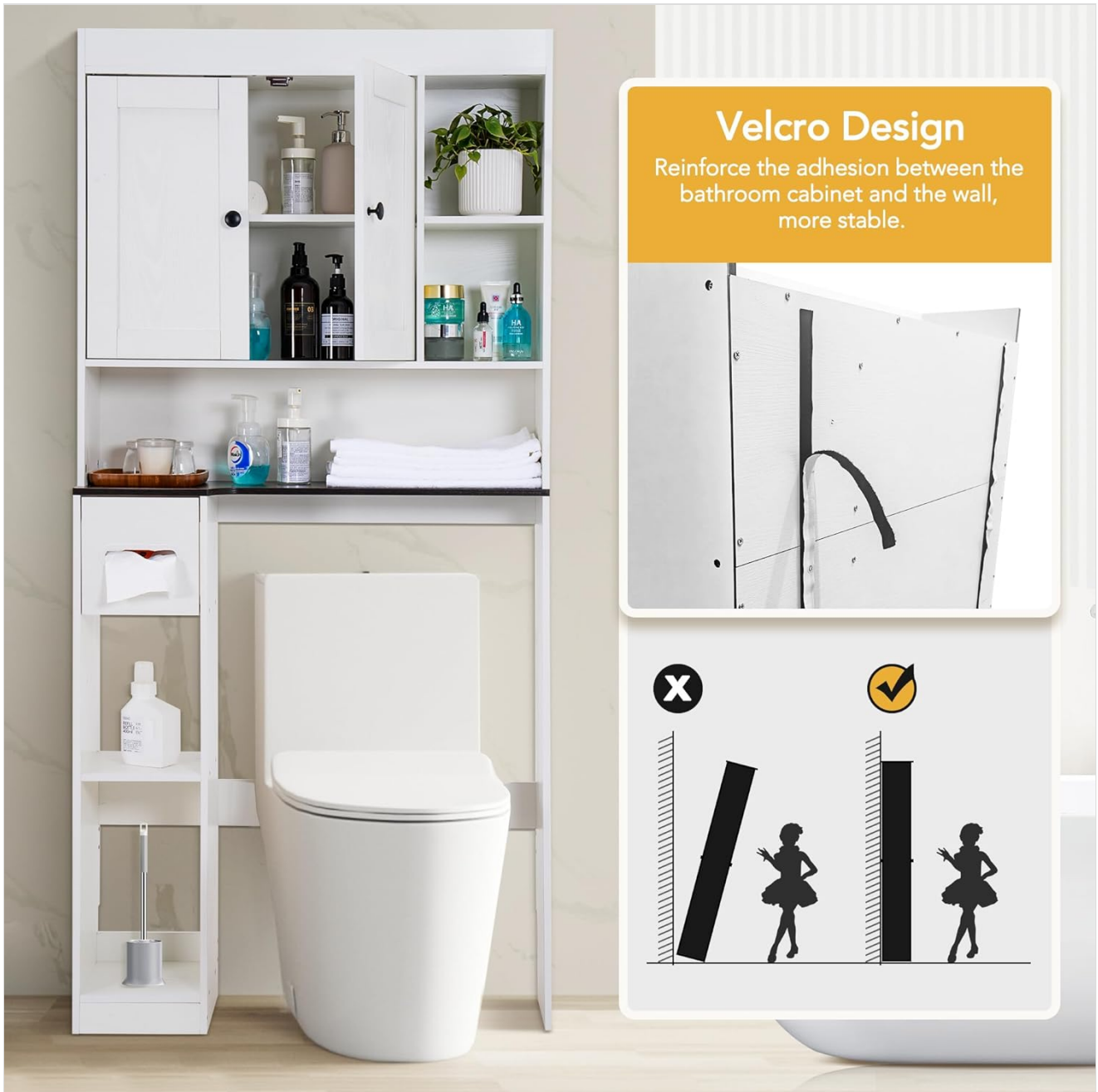
Image 2.1: Illustration of the Velcro design, reinforcing adhesion between the cabinet and the wall for enhanced stability and safety.