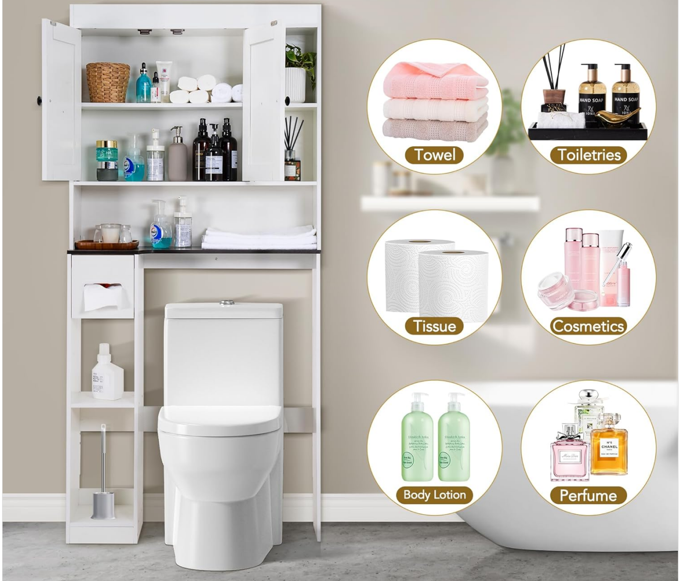
Image 4.2: The 6-tier design provides ample storage for a wide range of bathroom essentials, helping to keep your space organized.

Keeping the Bathroom Clean and Organized