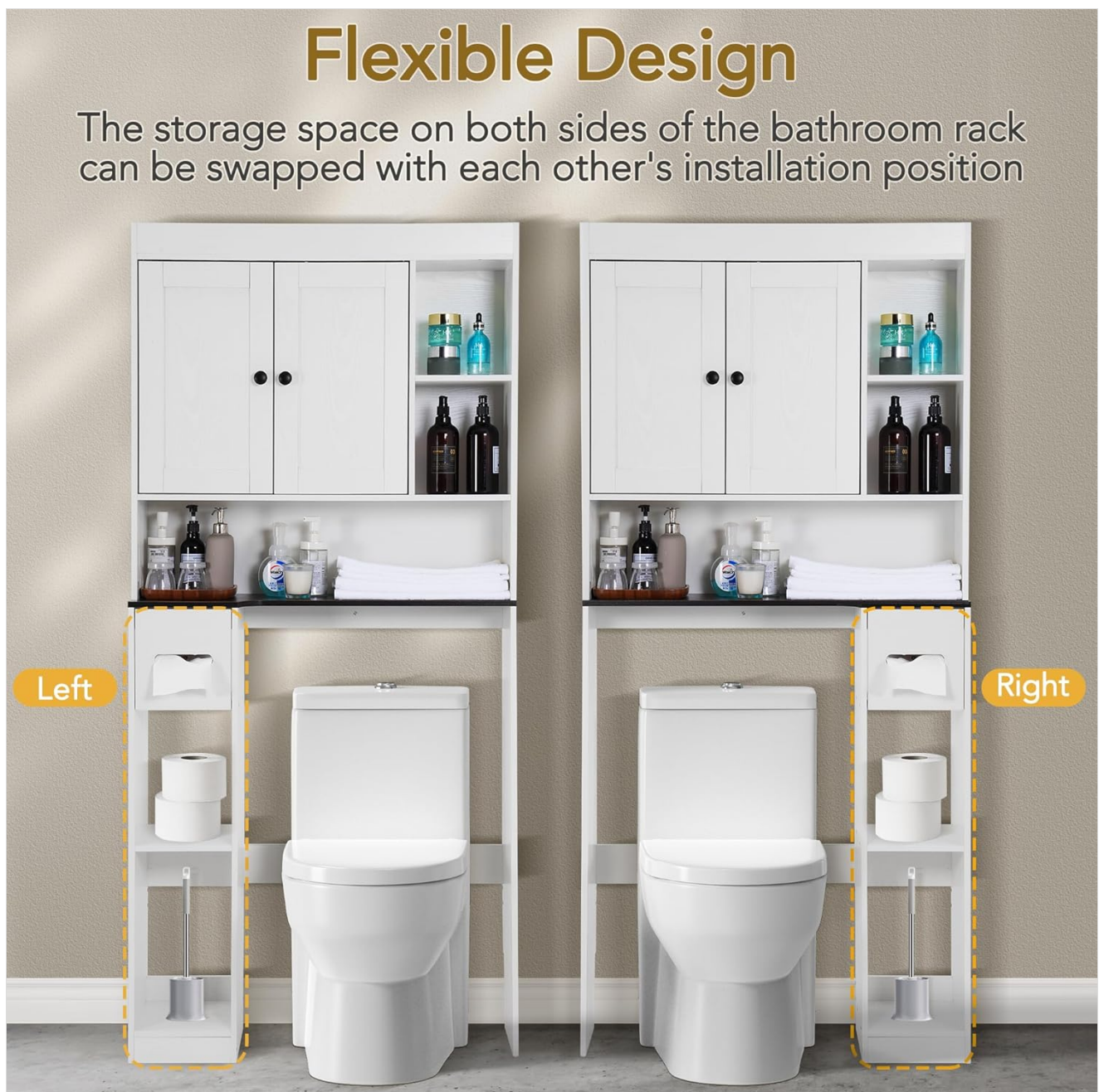
Image 3.1: The flexible design allows the side storage unit to be swapped between left and right installation positions to best fit your space.