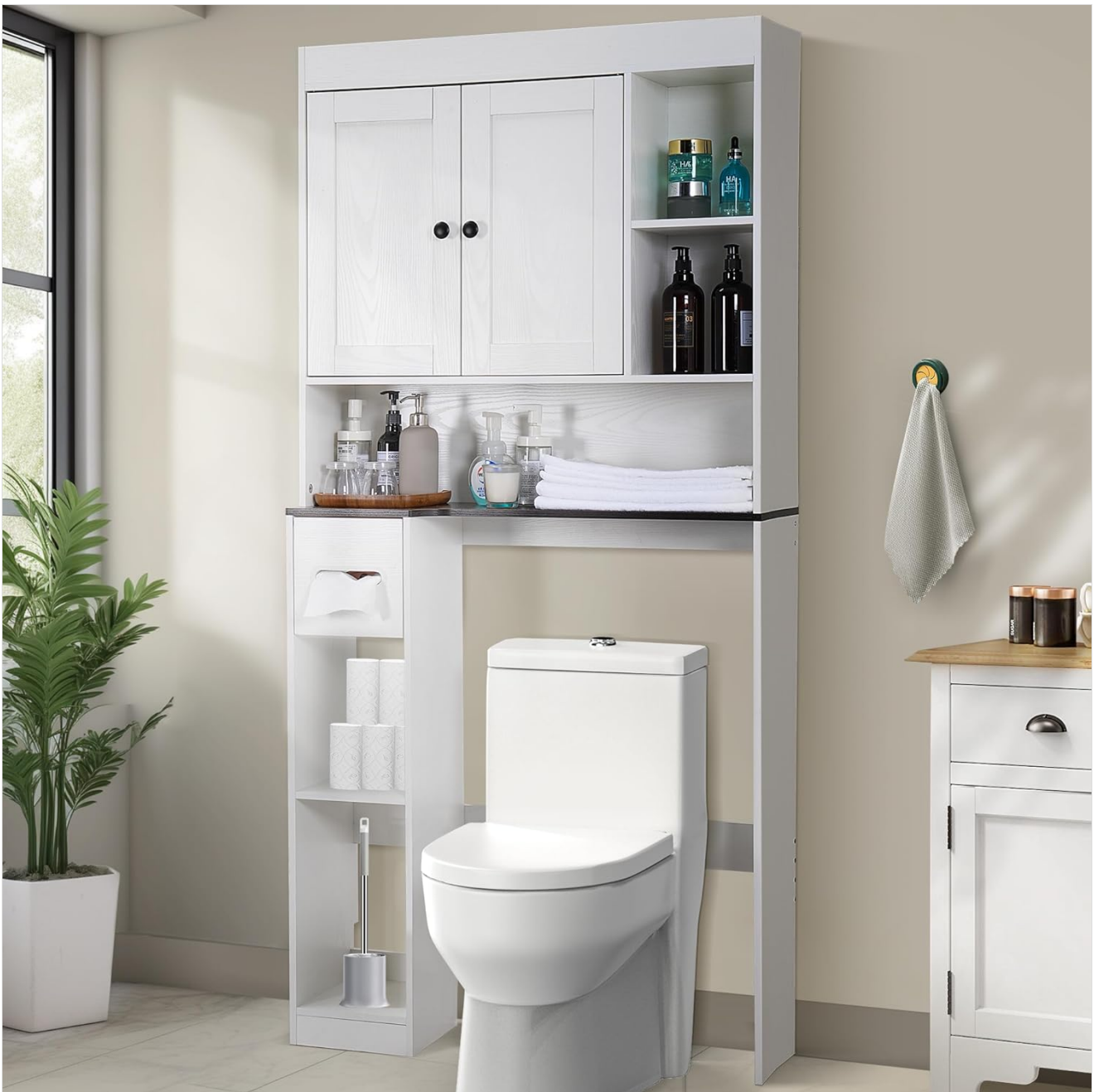
Image 1.1: The Decofy Over The Toilet Storage Cabinet in a typical bathroom setting, showcasing its design and functionality.