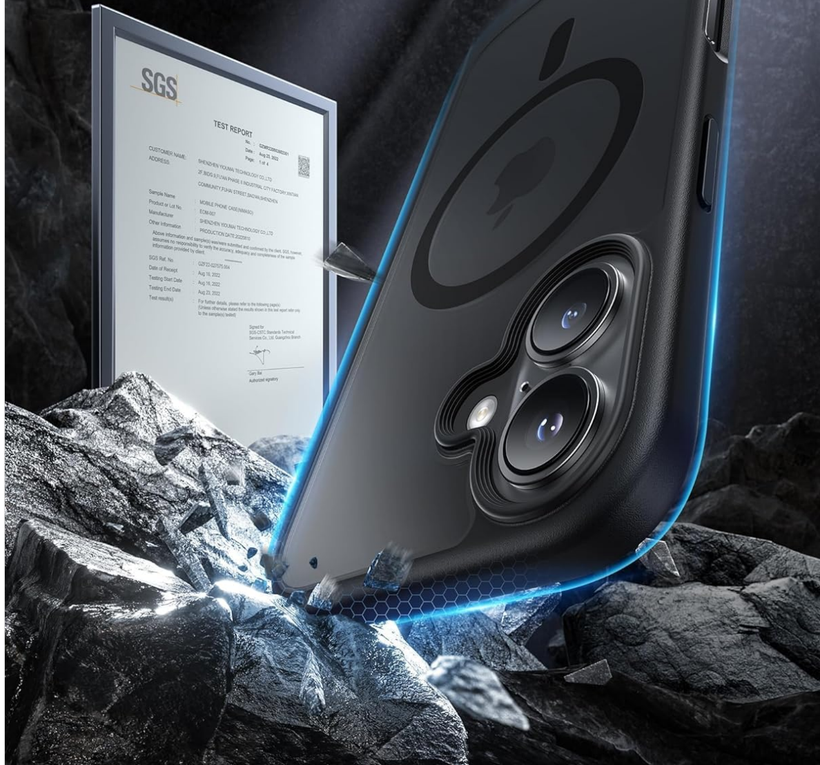
Image: A visual representation of the case's shock-resistant structure, protecting the iPhone 16 from drops onto rough surfaces.

The device remains unharmed even when dropped from a height of 1.2 meters onto asphalt or gravel.