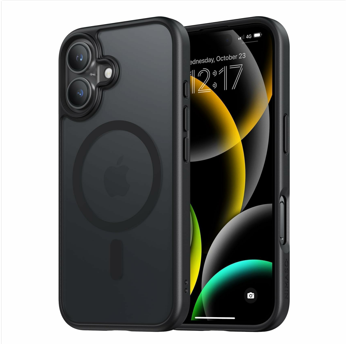
Image: The NIMASO iPhone 16 case showcasing its MagSafe compatibility and sleek design.