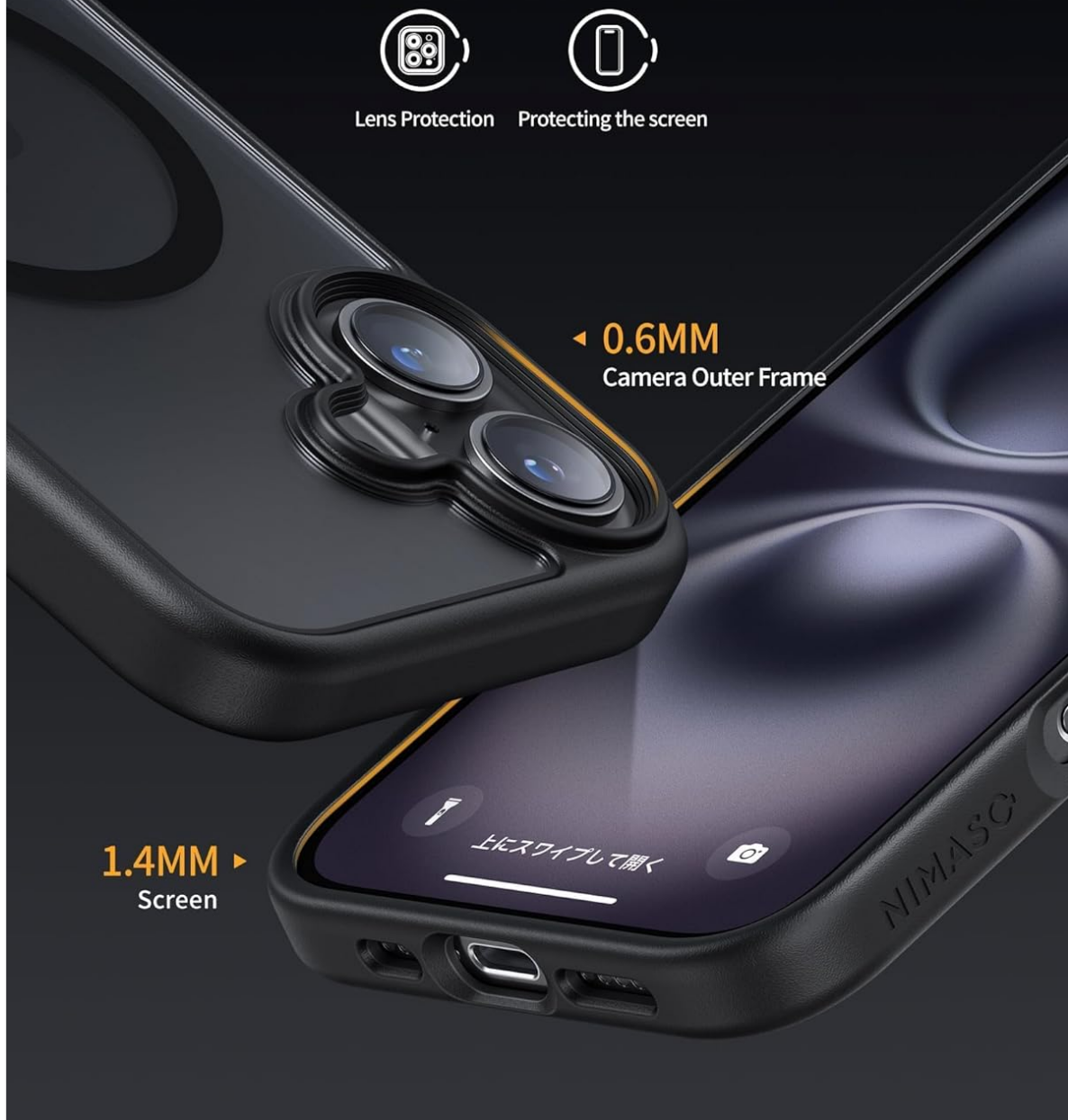
Image: Detailed view of the raised bezels providing protection for the camera lenses and phone screen.