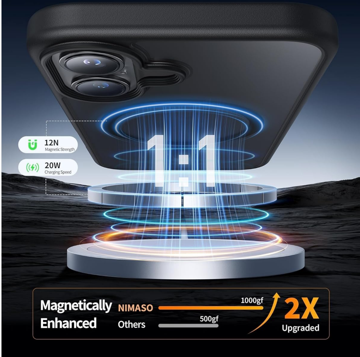
Image: Illustration of the strong magnetic attraction of the case, highlighting its 1000g holding force for MagSafe accessories.

Magnetic force enhanced by double, up to 1000g, maintaining stability in various situations.