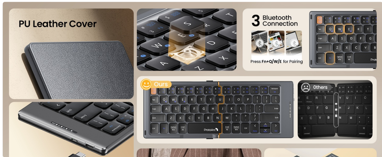
Visual guide to the shortcut keys and their functionalities.

Note: This portable keyboard is not designed to function as a general office full-size keyboard. Its compact layout may require some adaptation for typing habits.