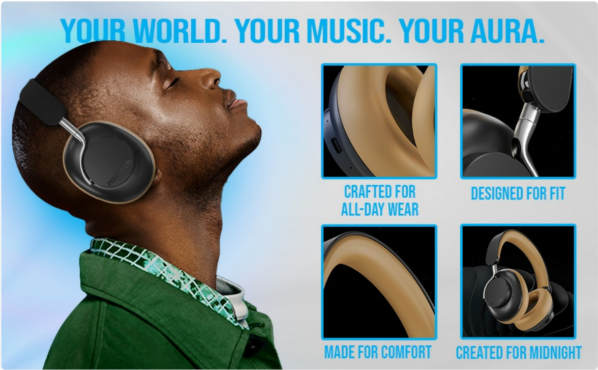
Image: Detailed view of the headphone's comfort and design elements.