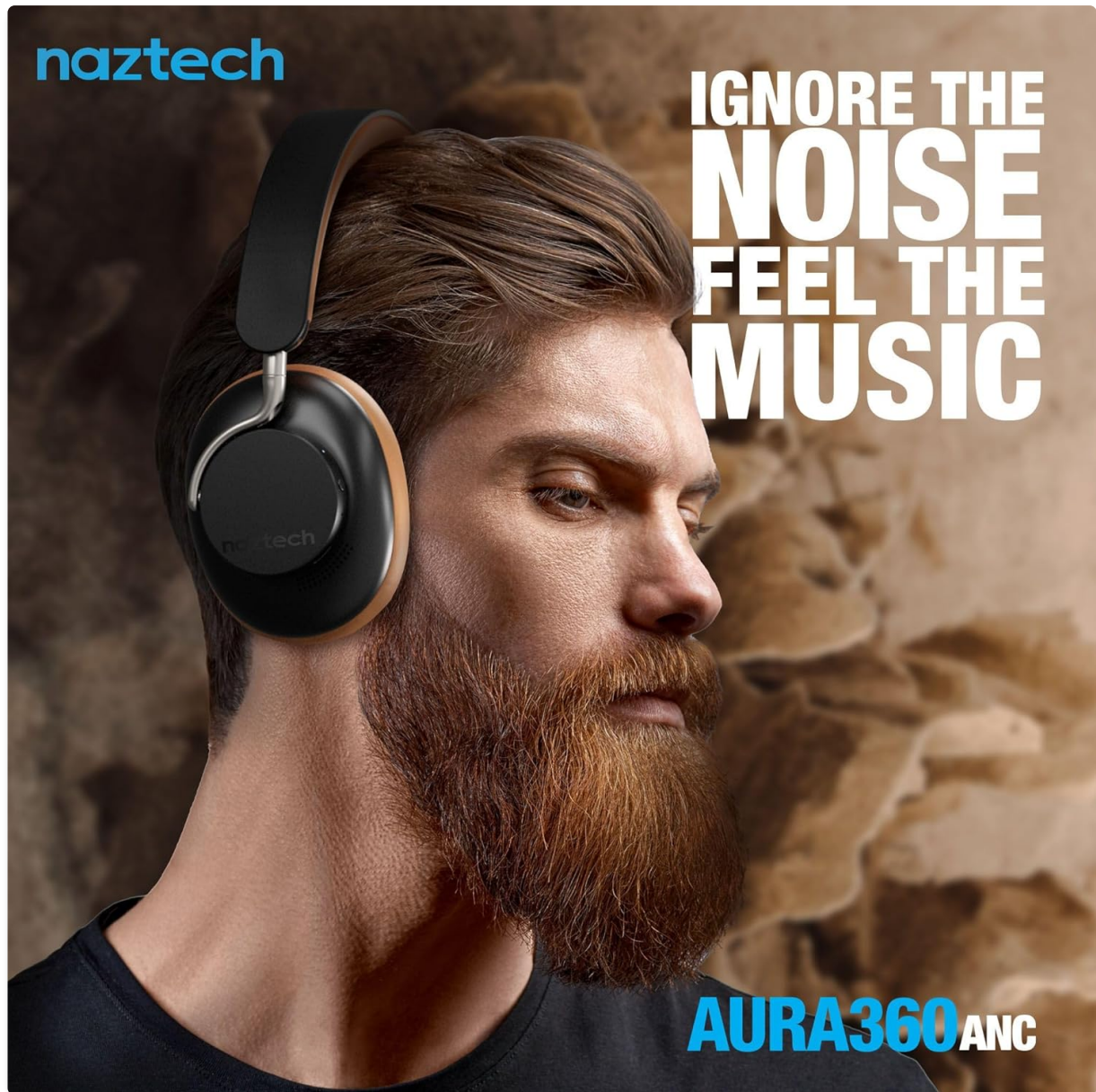
Image: Naztech Aura 360 ANC headphones with their retail packaging.