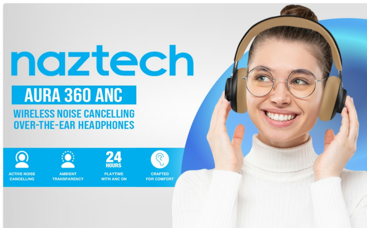
Image: Naztech Aura 360 ANC headphones in use, highlighting the immersive audio experience.

Thank you for choosing the Naztech Aura 360 ANC Wireless Over-Ear Headphones. These headphones are designed to provide a superior audio experience with advanced features for comfort and convenience. This manual will guide you through the setup, operation, and maintenance of your new headphones.