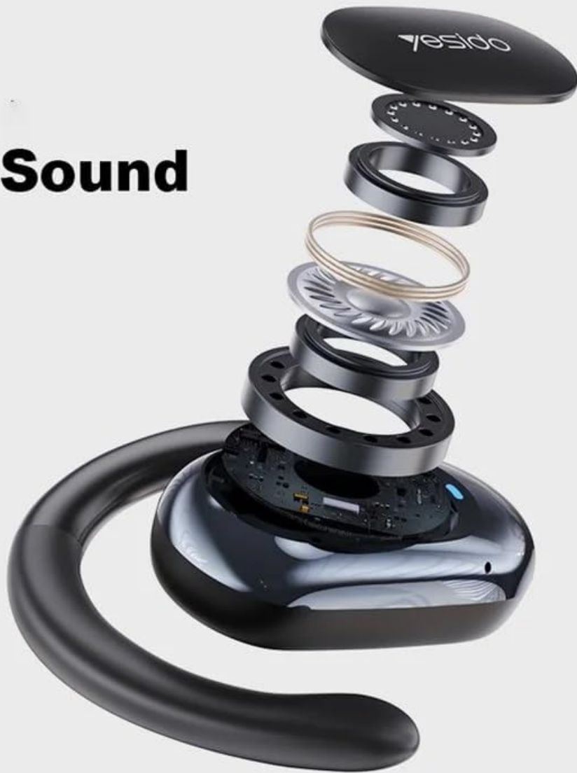
Image: An exploded diagram of the YESIDO YSP13 earphone, showcasing its internal structure and components responsible for HiFi sound reproduction.