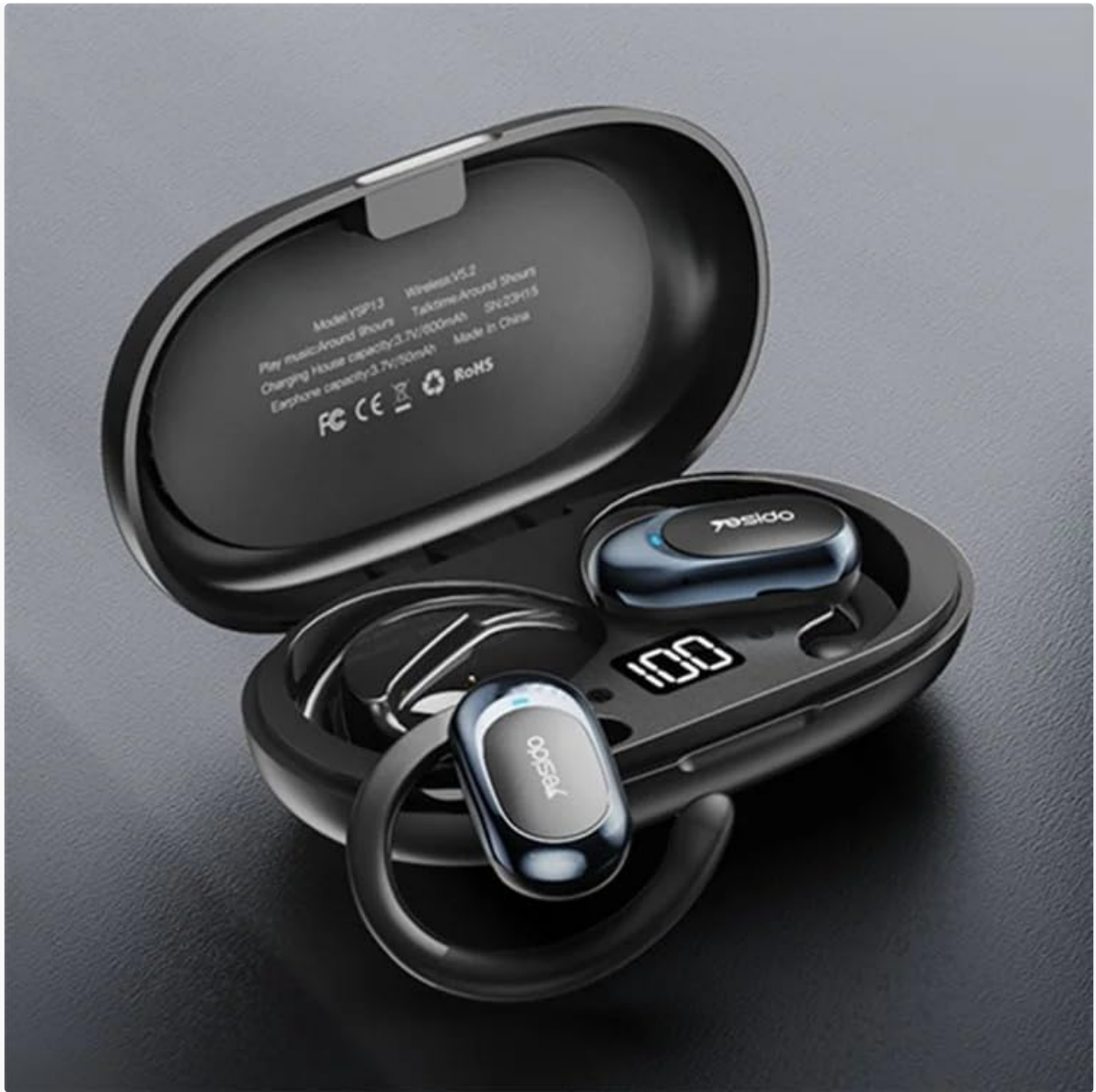
Image: The YESIDO YSP13 earphones resting in their charging case, which features a digital battery level indicator.