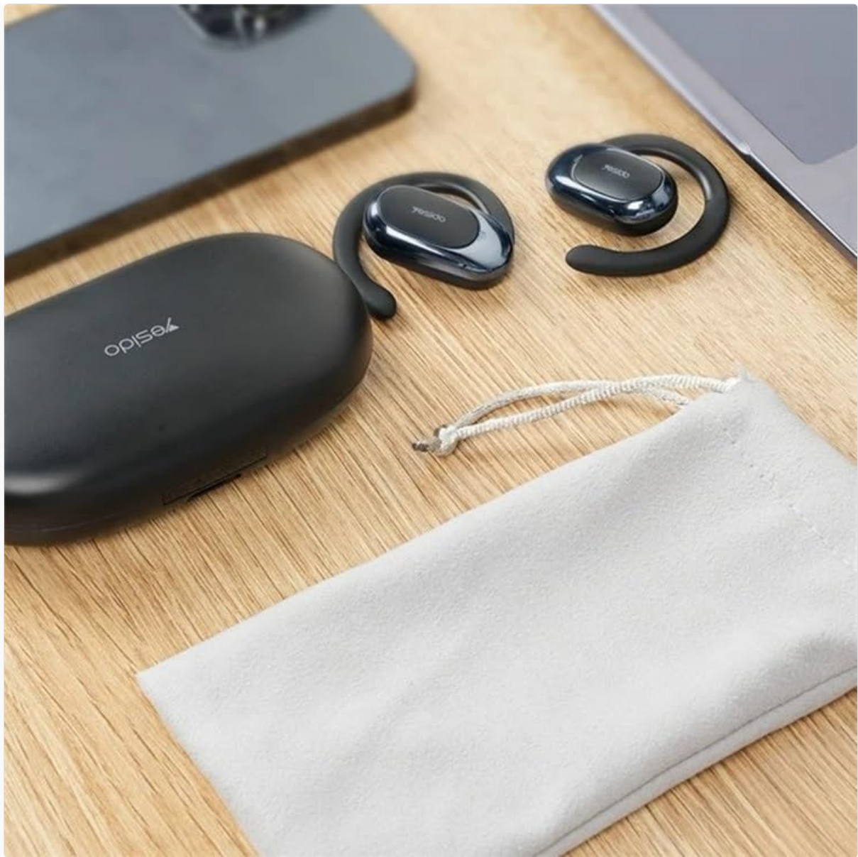
Image: Contents of the YESIDO YSP13 package, including the earphones, charging case, charging cable, and a small storage pouch.