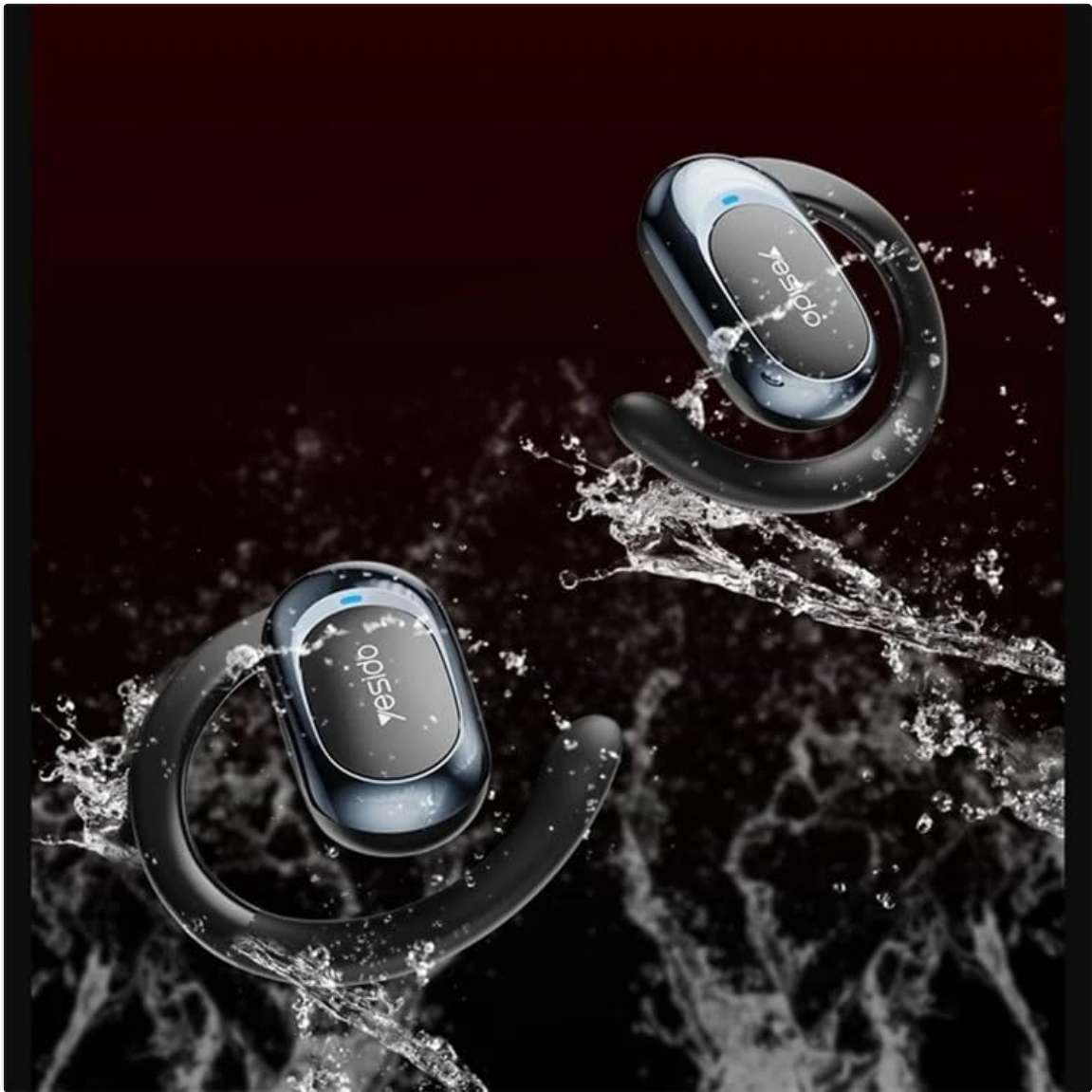
Image: The YESIDO YSP13 earphones shown with water splashes, illustrating their resistance to sweat and light rain.