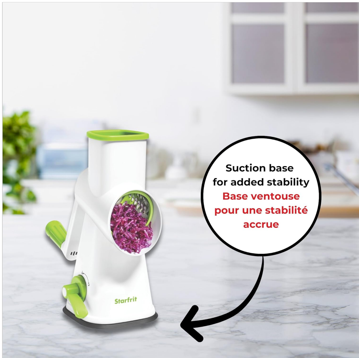
Image: A detailed view of the grater's suction base, illustrating how it provides enhanced stability on the countertop.