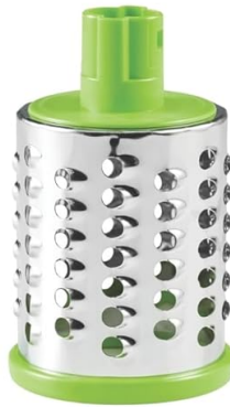
Coarse Grating Drum