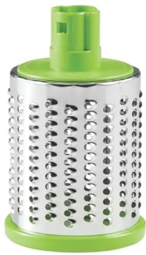
Fine Grating Drum