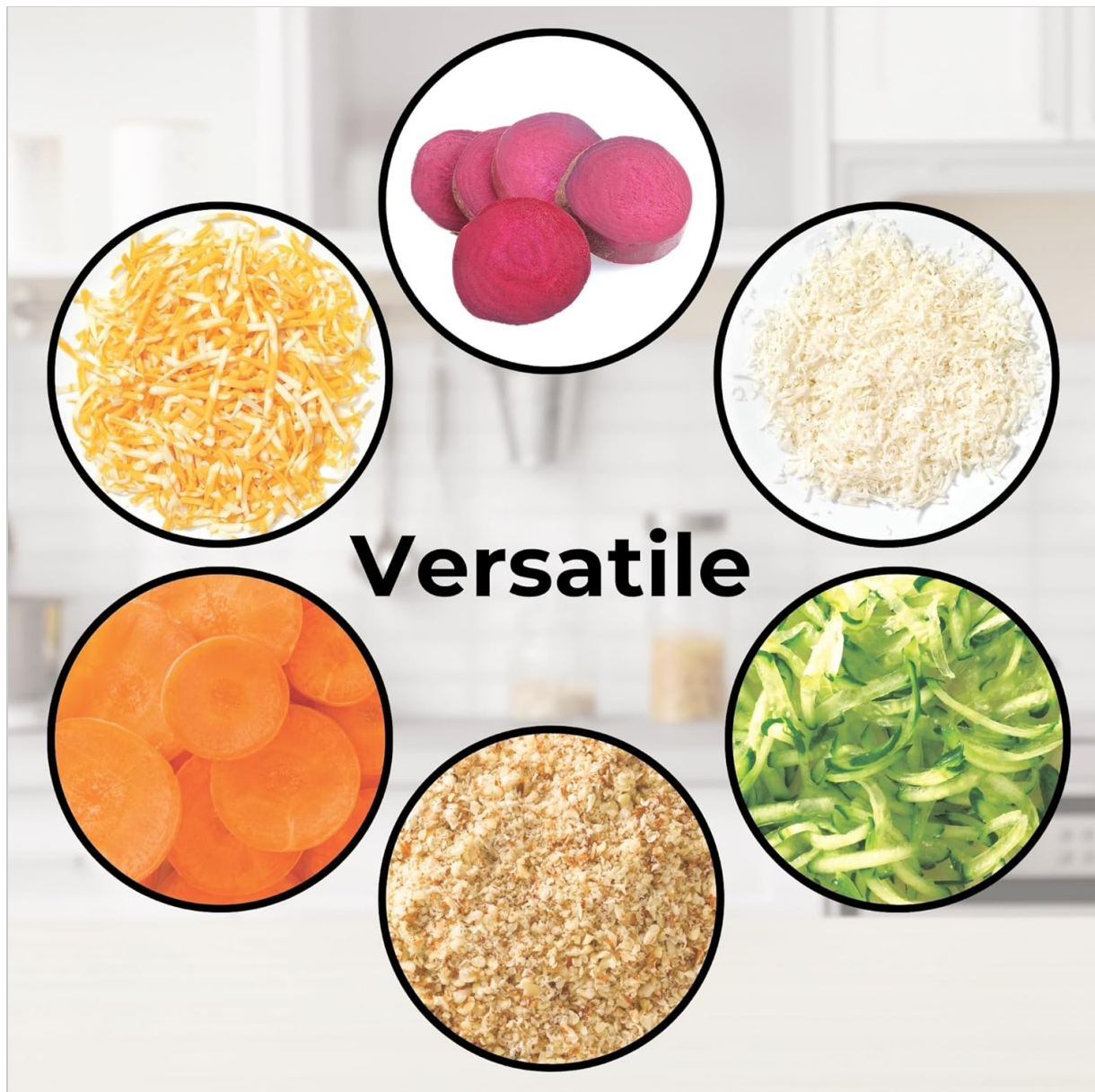
Image: The Starfrit Rotary Drum Grater is highly versatile, capable of processing a wide array of ingredients including cheese, carrots, zucchini, nuts, and beets into various forms.