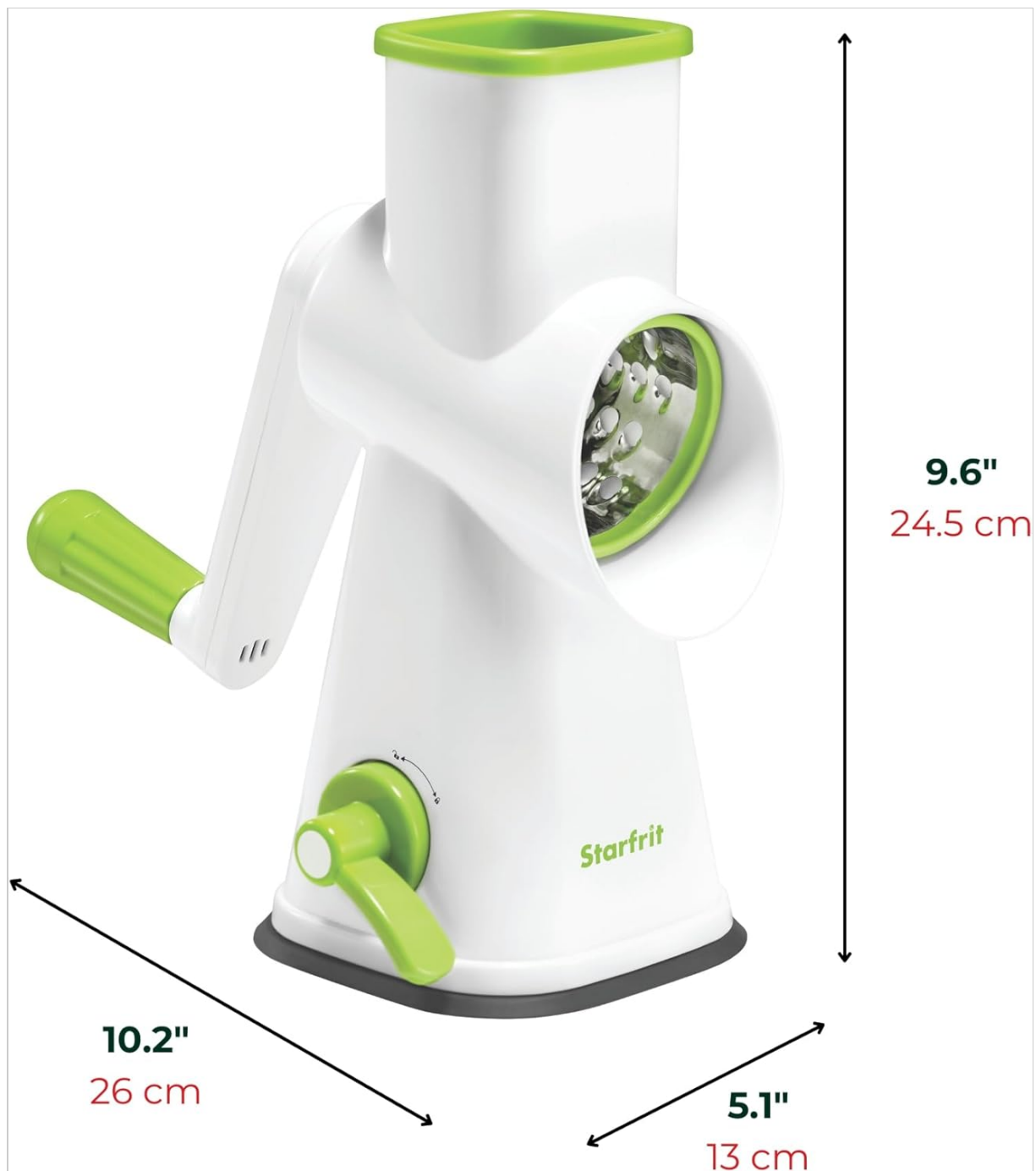
Image: Detailed product dimensions of the Starfrit Rotary Drum Grater for easy reference.