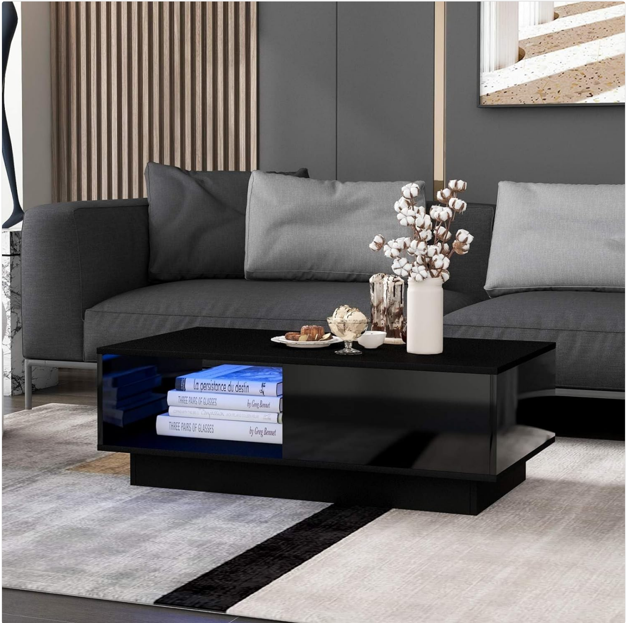
Figure 7.1: PUGSDRLY Modern Coffee Table in a living room. This image showcases the assembled coffee table with its sleek design, integrated LED lighting, and functional storage, complementing a modern interior.