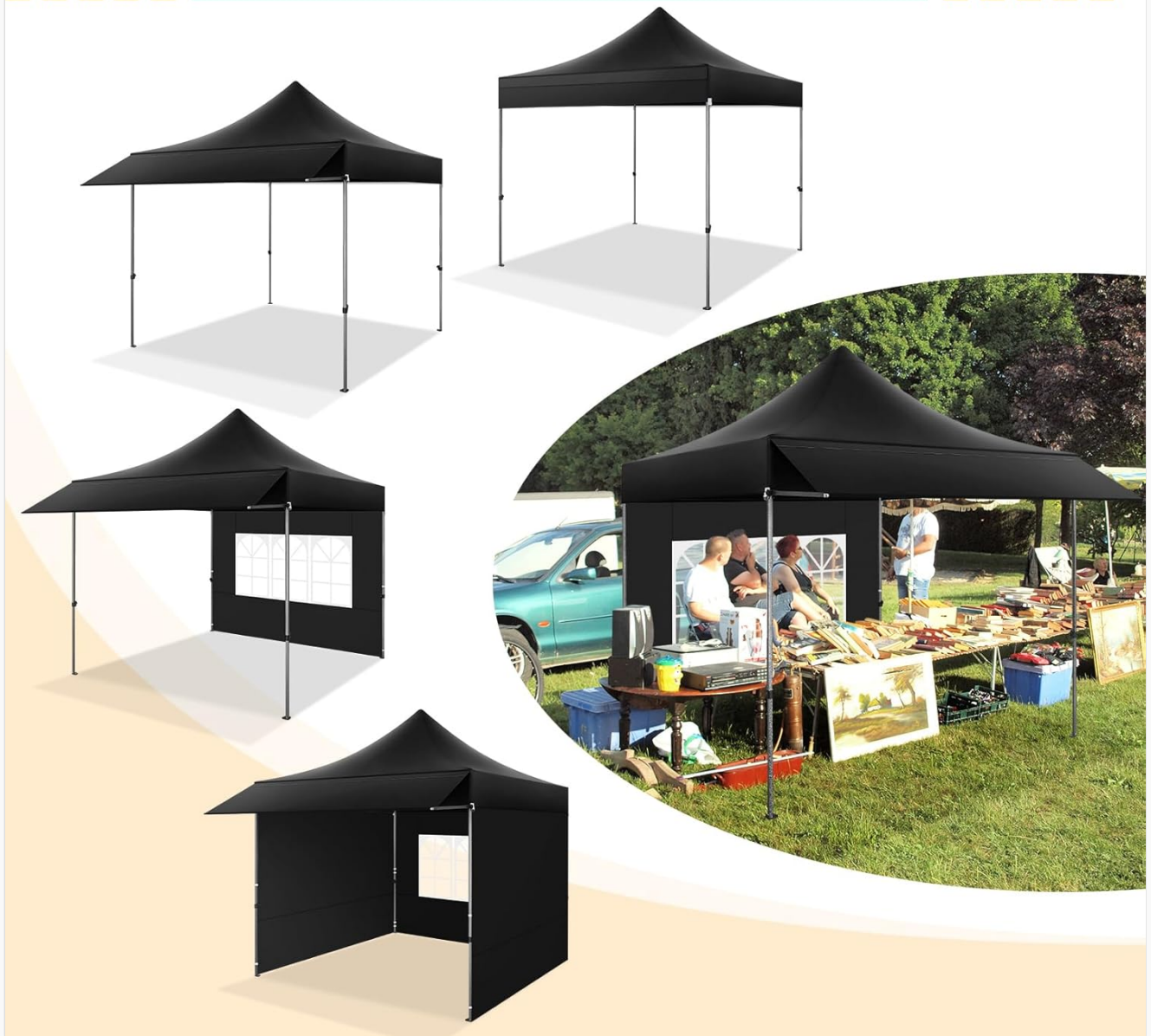
Figure 5.2: Canopy Configuration Options