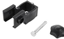
2X Awning Connectors