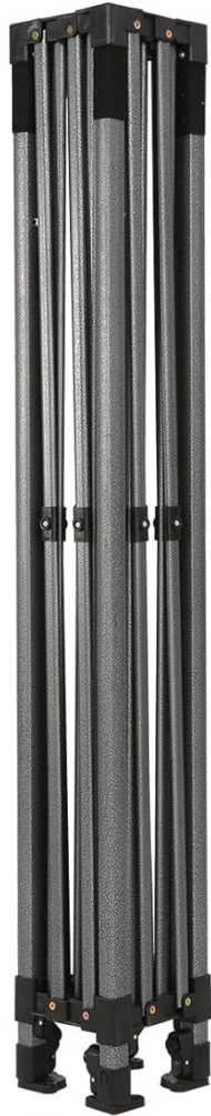
1X Heavy Duty Frame