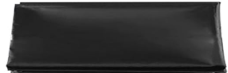
1X Canopy Top