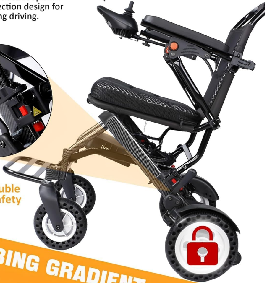
Figure 4.2: The wheelchair's automatic braking system is effective on inclines, complemented by dual handbrakes for enhanced safety.