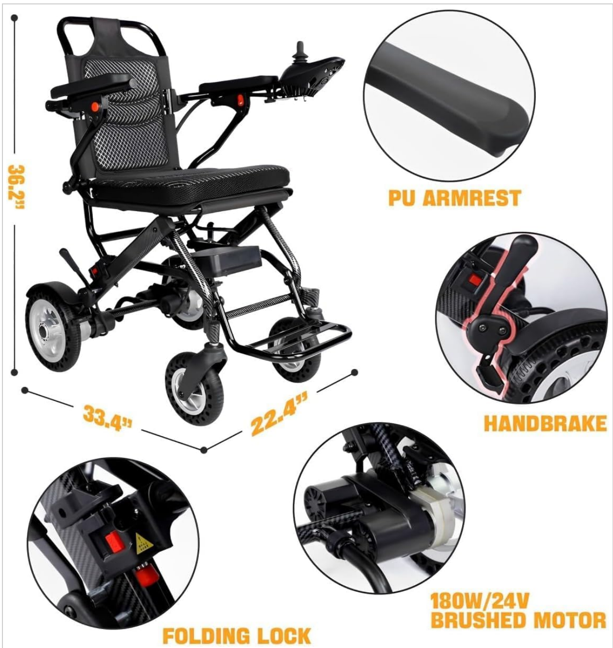
Figure 9.1: Visual representation of the wheelchair's dimensions and key components like the PU armrest, handbrake, folding lock, and the 180W/24V brushed motor.