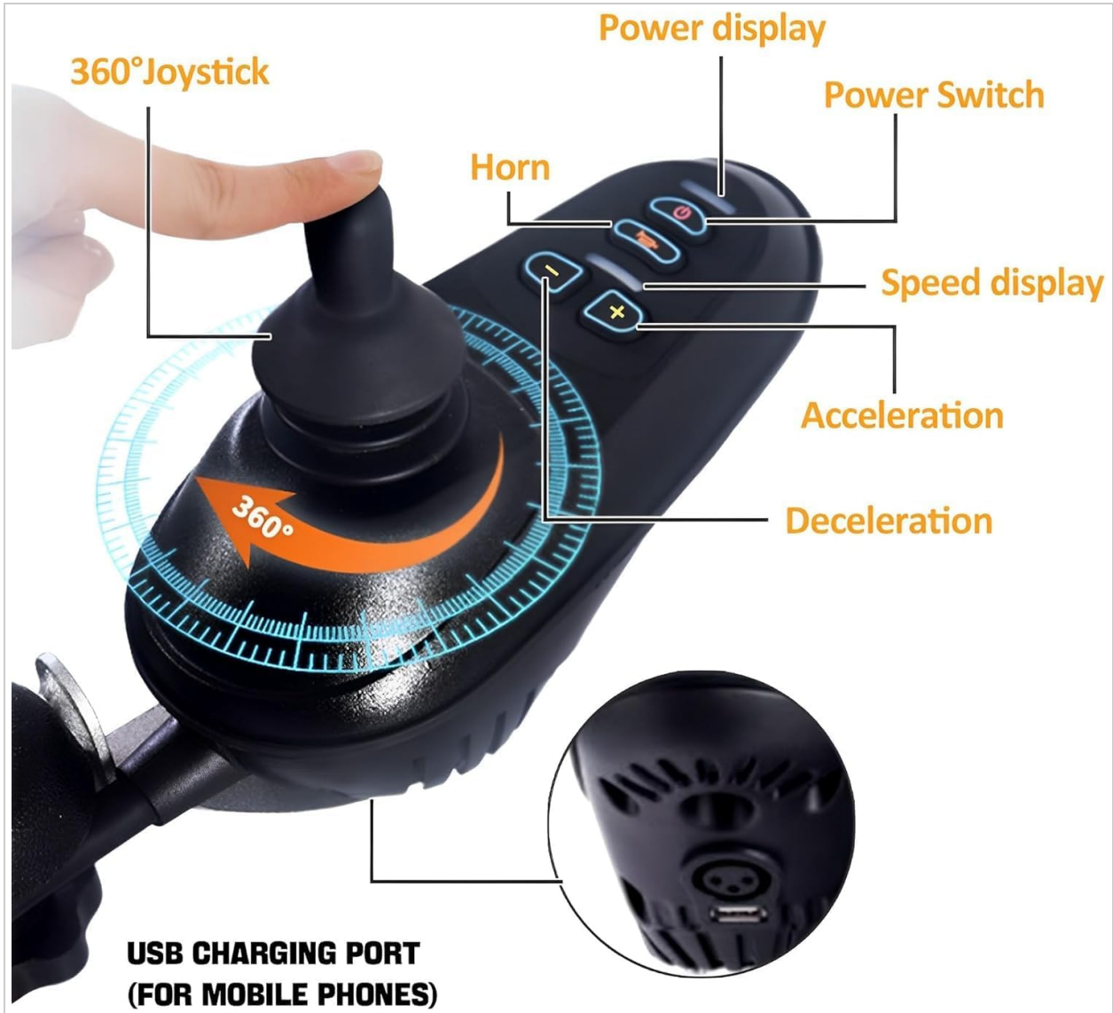
Figure 4.1: The intelligent joystick controller features a 360-degree joystick, power switch, power display, horn button, speed gear display, acceleration and deceleration controls, and a USB charging port.