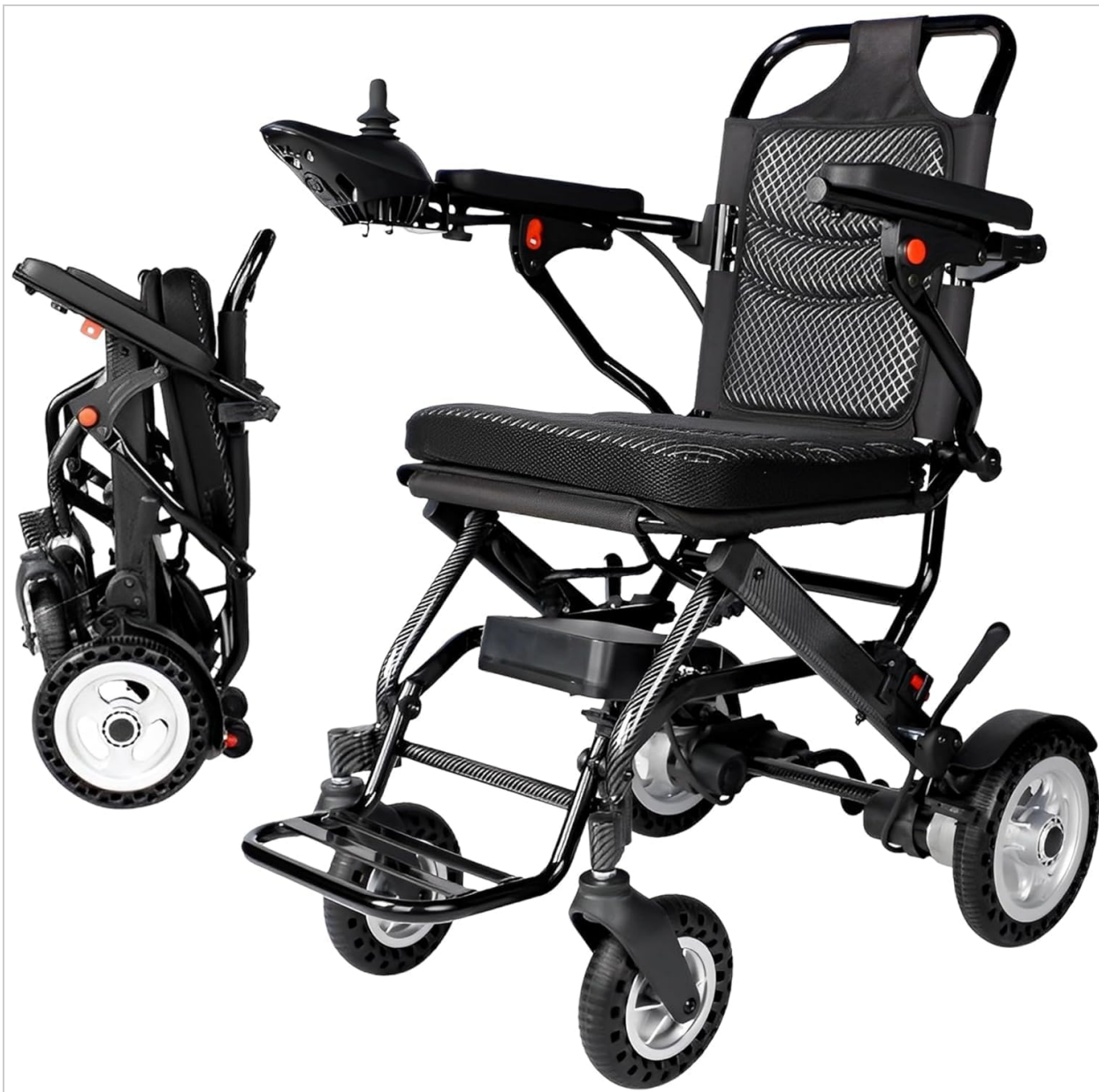
Figure 2.1: The loktch HE702-1 Electric Wheelchair, shown both unfolded and compactly folded for transport.