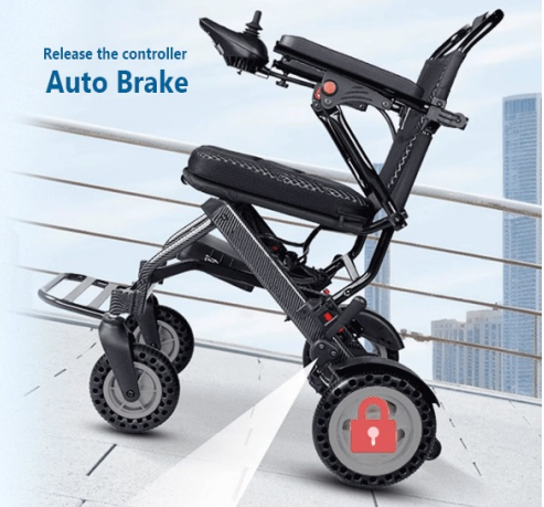
Figure 4.3: The New Smart Brake system automatically parks the wheelchair even without power, featuring reverse anti-rollback wheels and dual handbrakes for comprehensive protection.