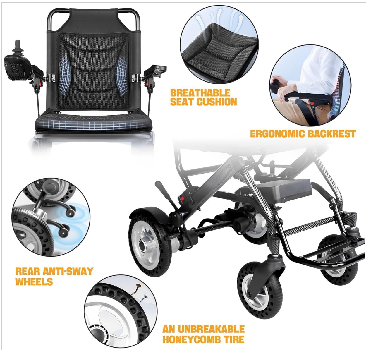
Figure 2.3: Close-up of comfort features such as the breathable seat cushion and ergonomic backrest, along with rear anti-sway wheels and the durable honeycomb tire.