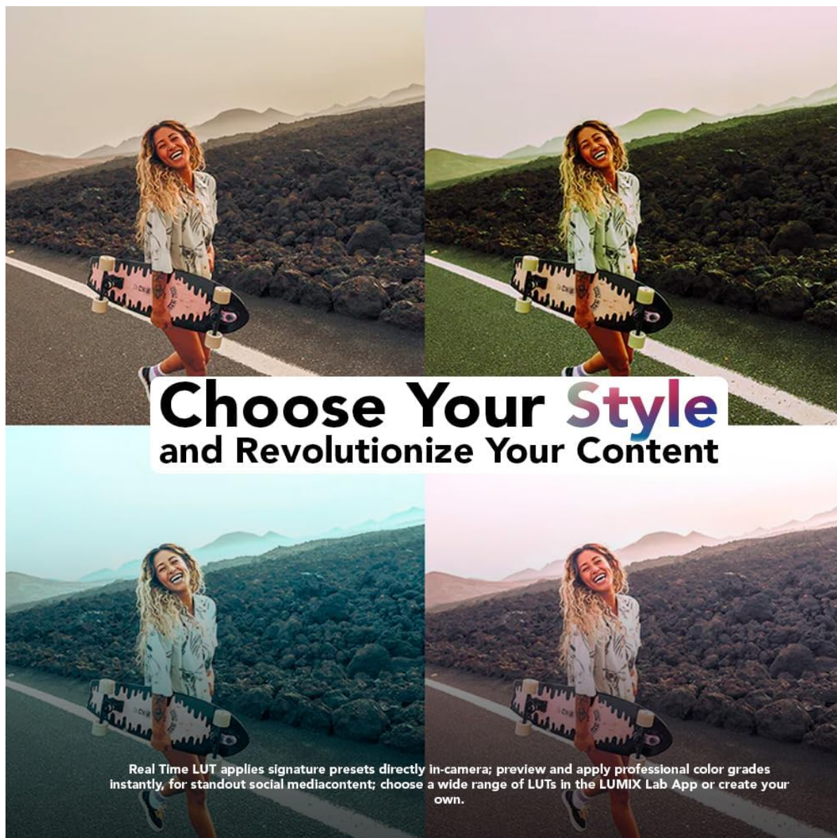
Figure 4.2: Real Time LUT application for instant color grading.

Your browser does not support the video tag.