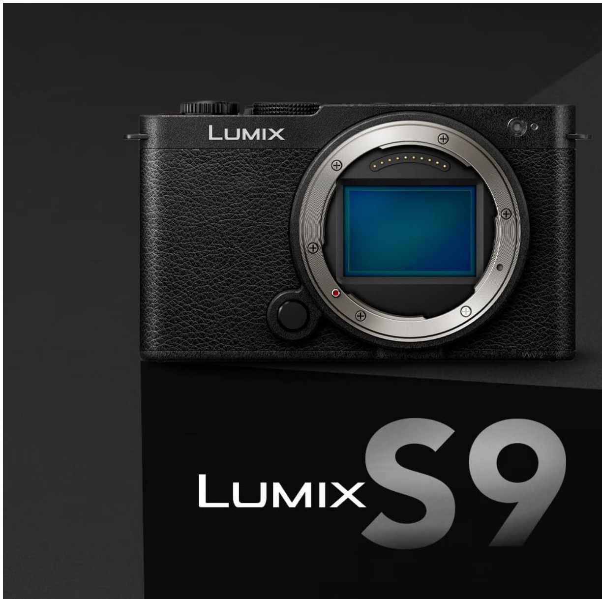
Figure 3.1: LUMIX S9 camera body with L-mount for lens attachment.

the lens clockwise until it clicks into place. To detach, press the lens release button on the camera body and rotate the lens counter-clockwise.